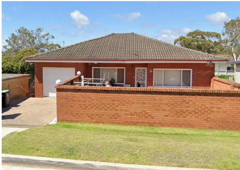
View of the adjoining eastern dwelling