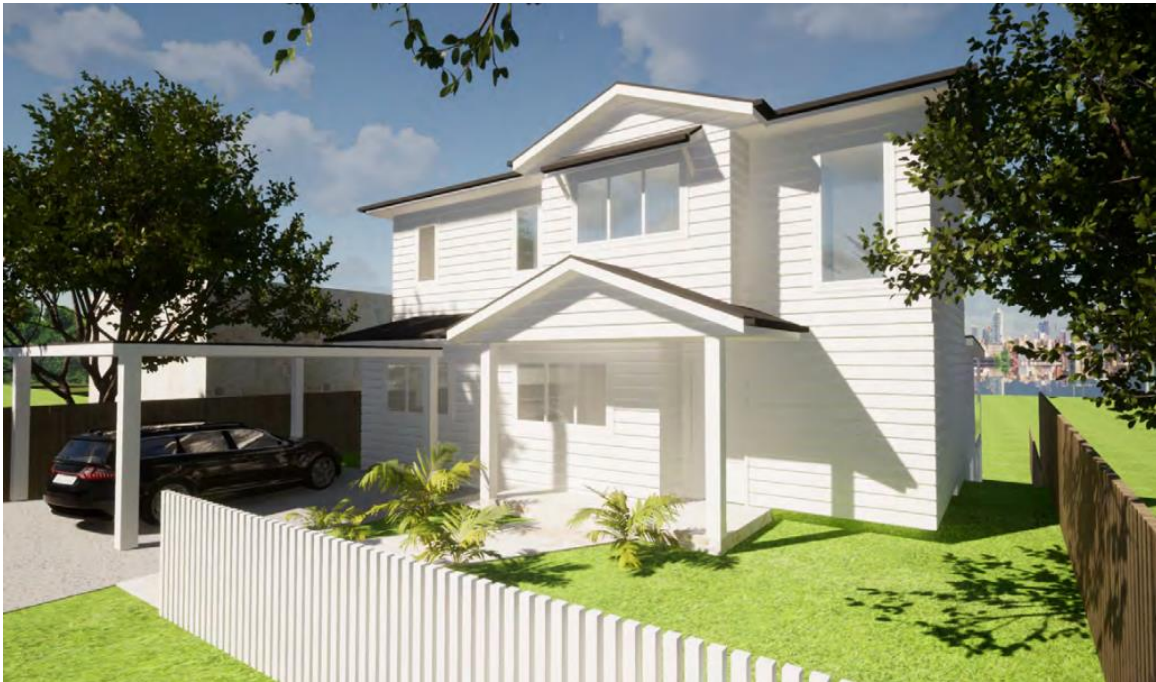
Artists Impression of the Proposed Addition

The existing separation between dwellings coupled with the design solutions will ensure that privacy and overshadowing issues are reasonably resolved.