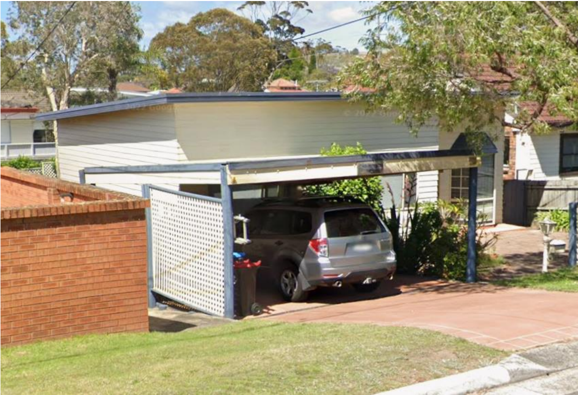
View of the existing dwelling

dwelling is well presented although older in style and appears particularly small when compared with the surrounding large dwellings in the immediate locality of the site.