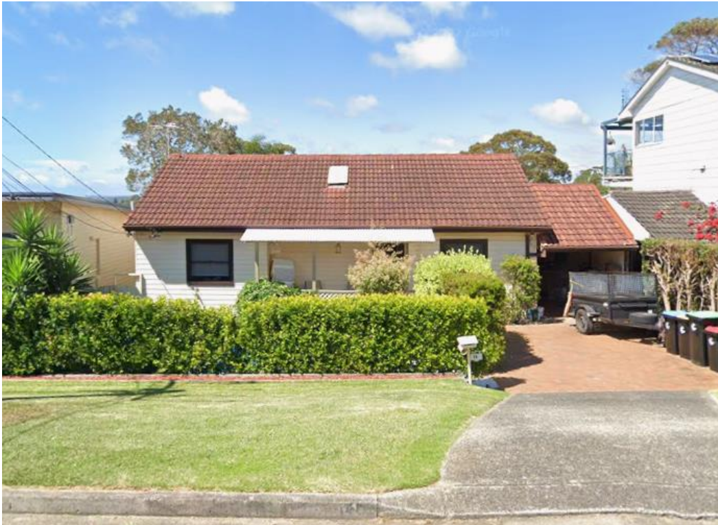
View of the adjoining western dwelling

Shadows cast by the proposed addition will fall in a sweeping motion towards the south and partially across the rear of the adjoining eastern and western dwellings.