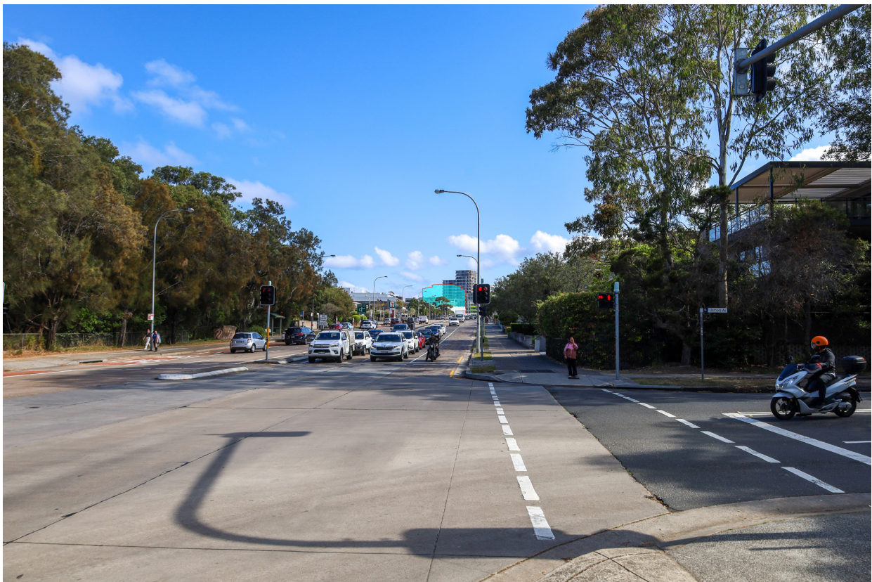
Difference between the complying and non-complying building envelop