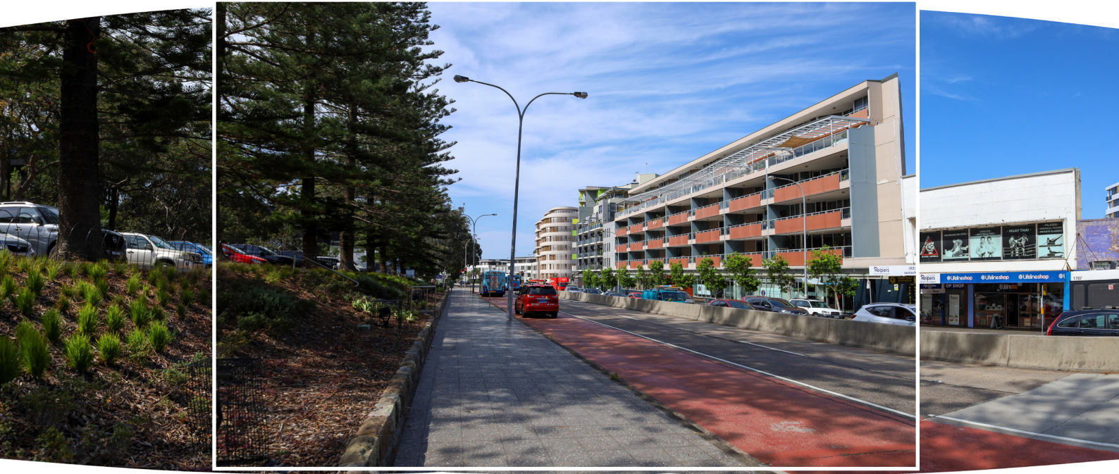
Panorama with nested image in white frame for additional context closer to natural field of view