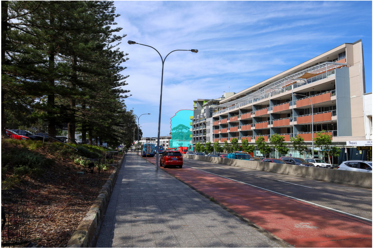
Visual impact in cyan with red outline