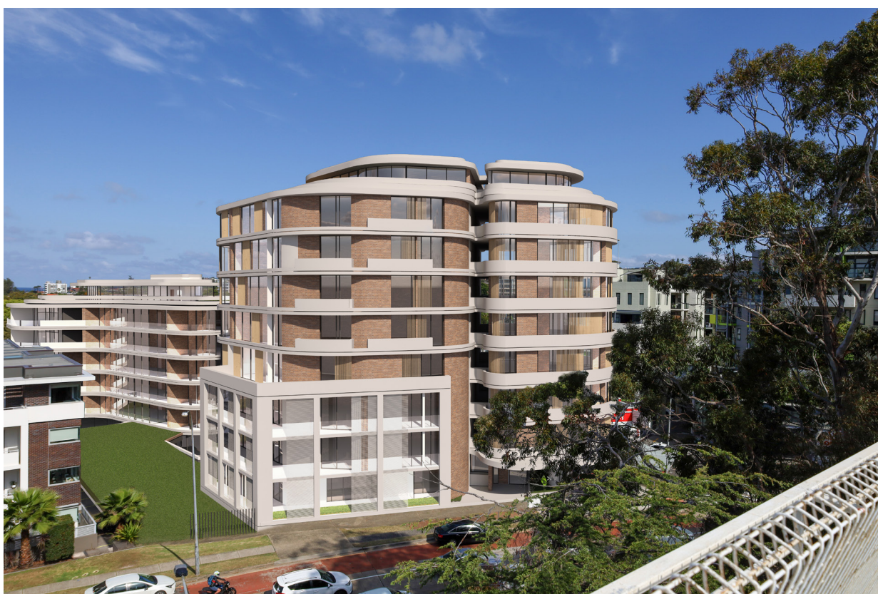
Photomontaged view of new proposal