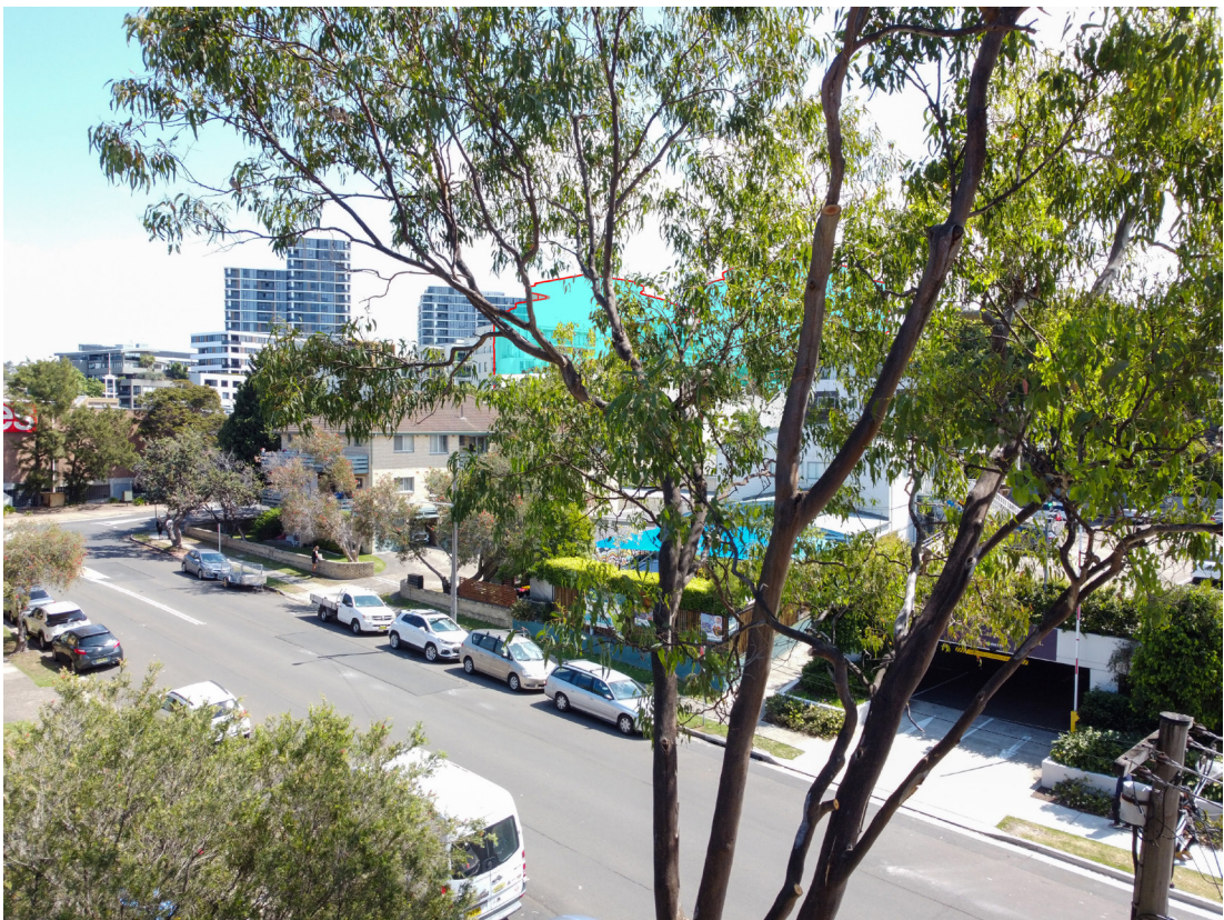
Difference between the complying and non-complying building envelope