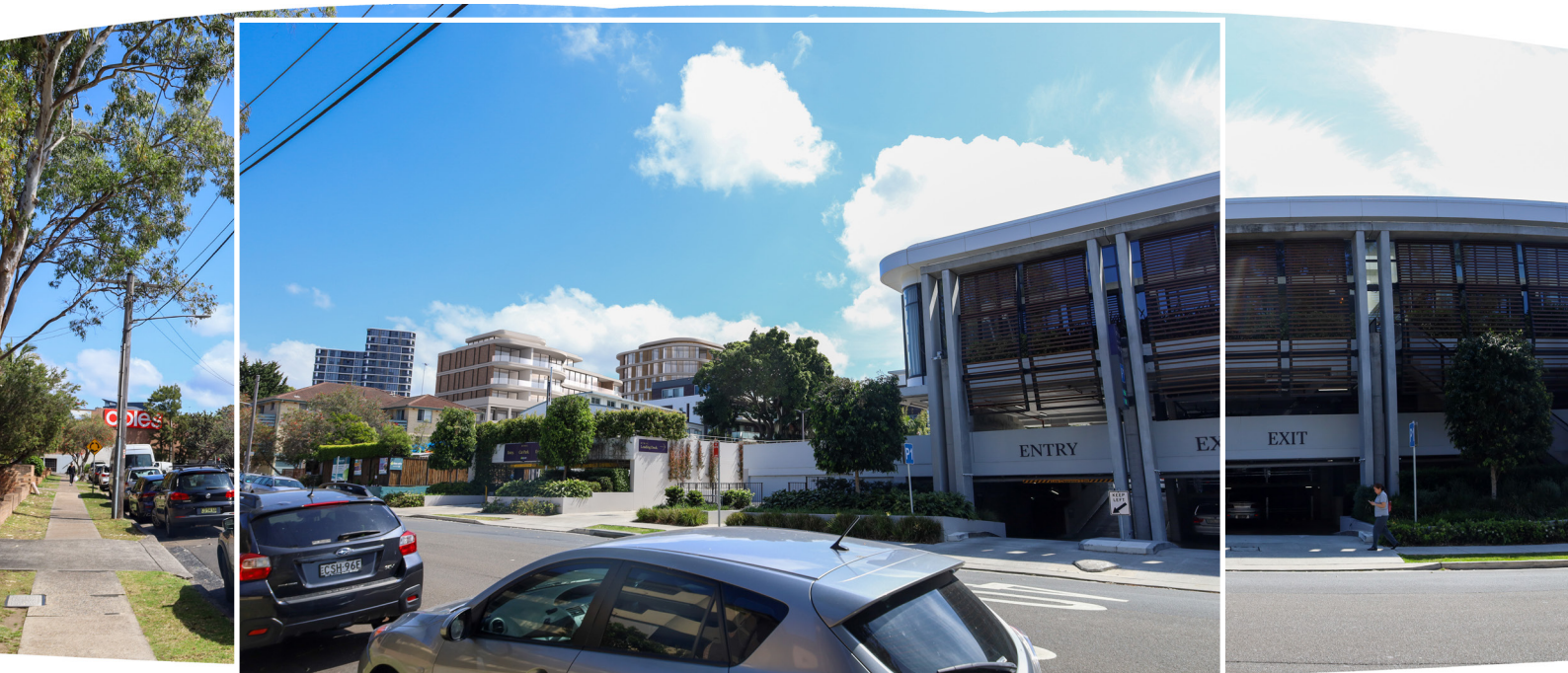
Panorama with nested image in white frame for additional context closer to natural field of view