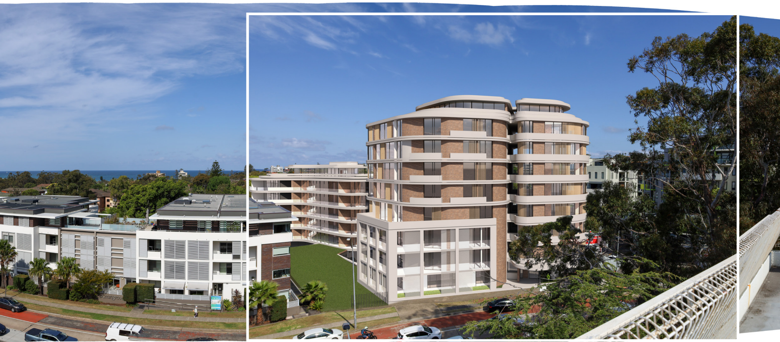
Panorama with nested image in white frame for additional context closer to natural field of view