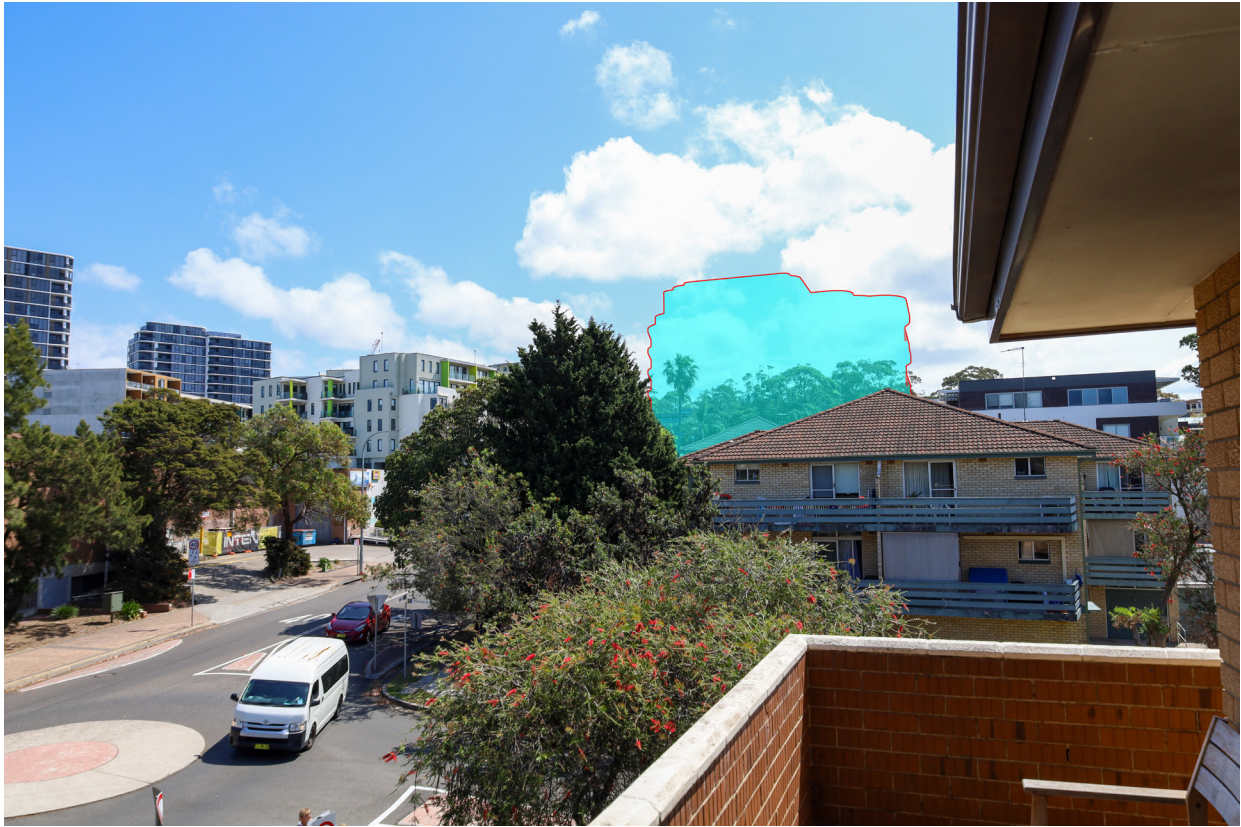
Visual impact in cyan with red outline