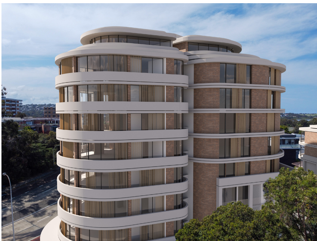
Photomontaged view of new proposal