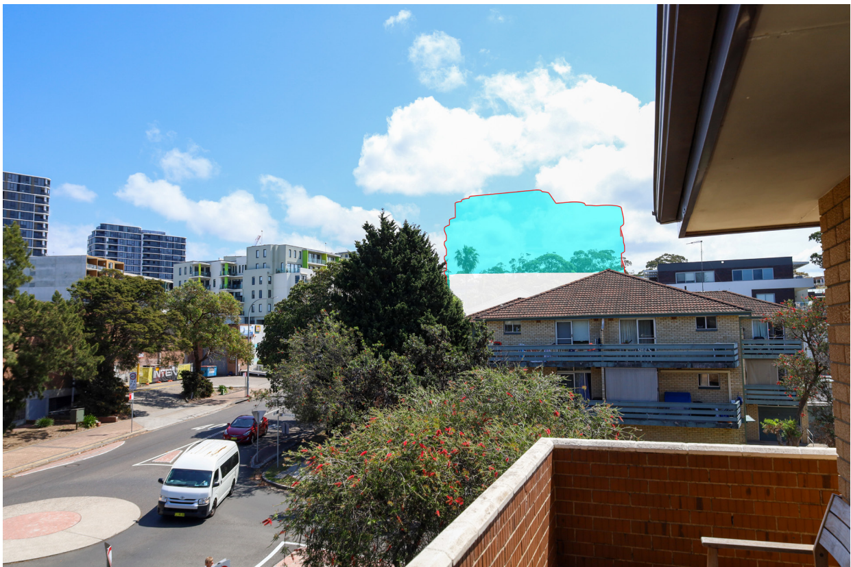
Difference between the complying and non-complying building envelope