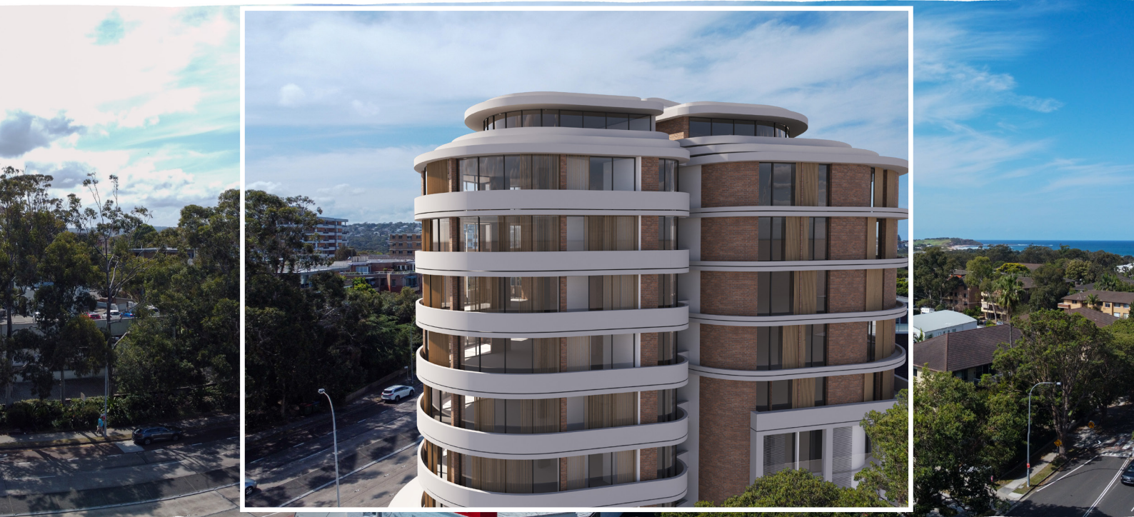
Panorama with nested image in white frame for additional context closer to natural field of view