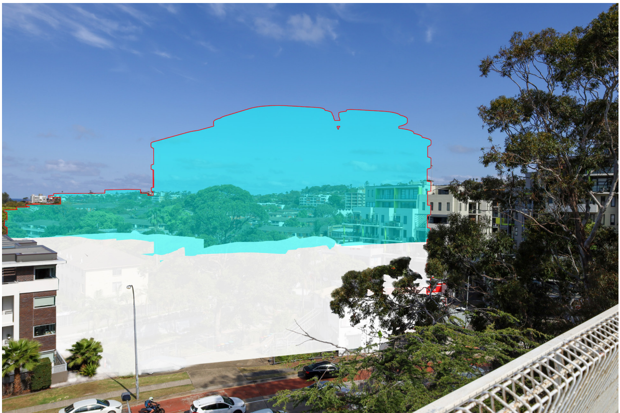
Difference between the complying and non-complying building envelope