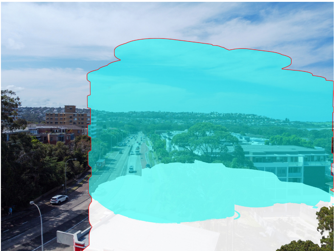
Difference between the complying and non-complying building envelope