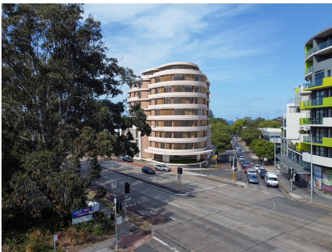
Photomontaged view of new proposal