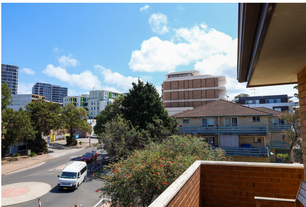
Photomontaged view of new proposal