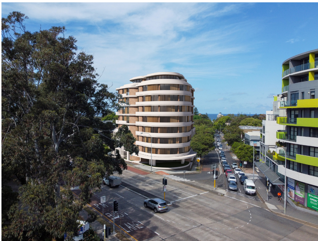
Photomontaged view of new proposal