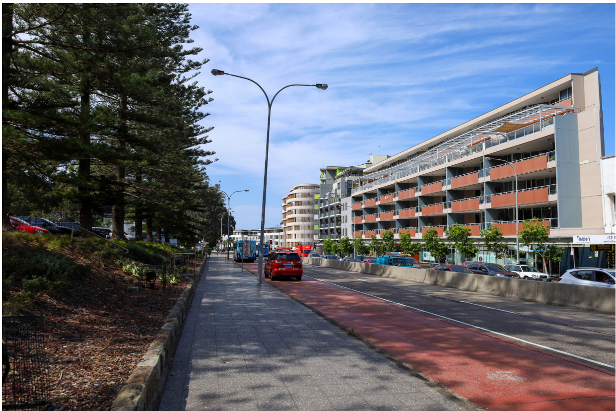
Photomontaged view of new proposal