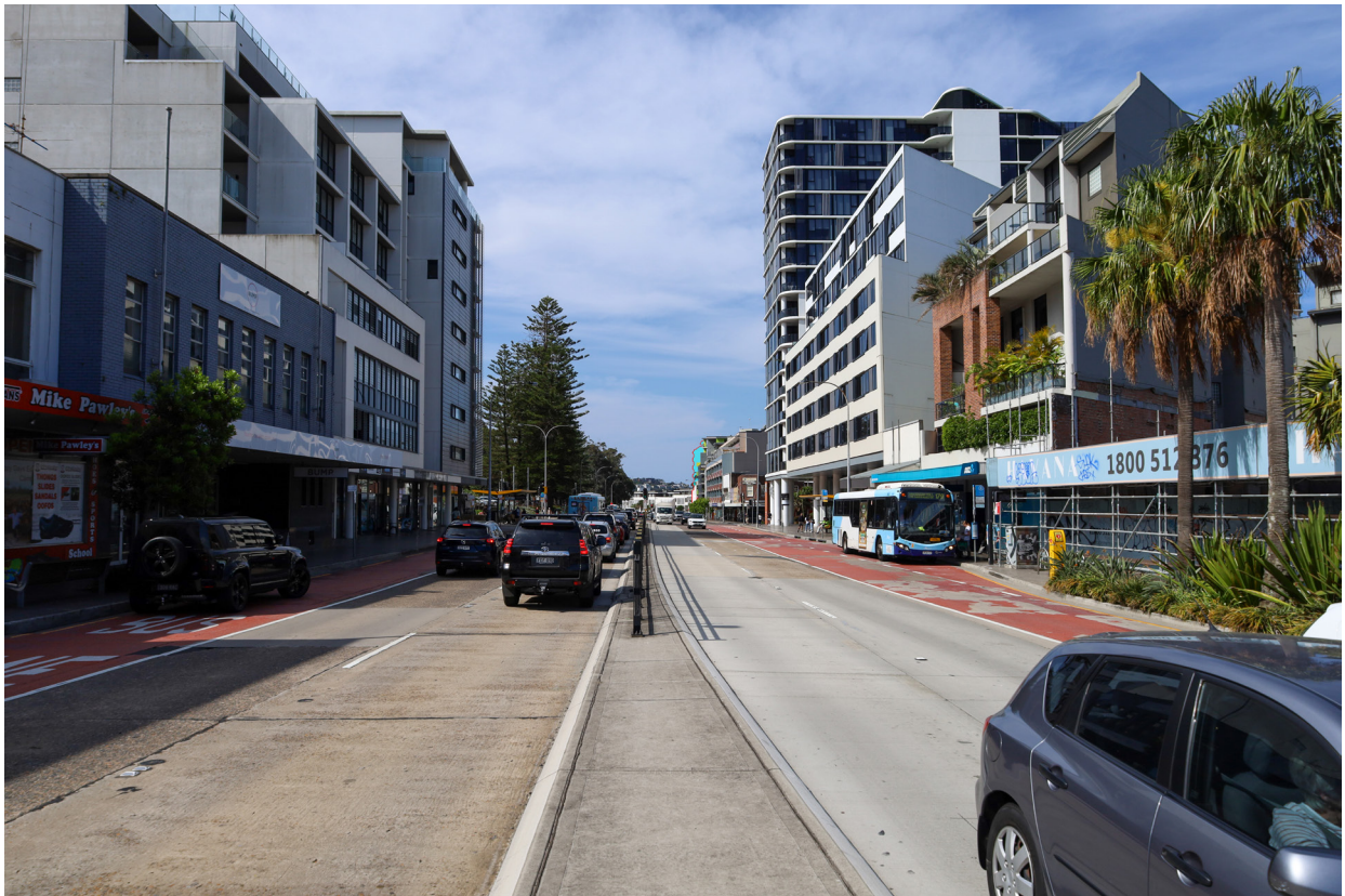
Difference between the complying and non-complying building envelope