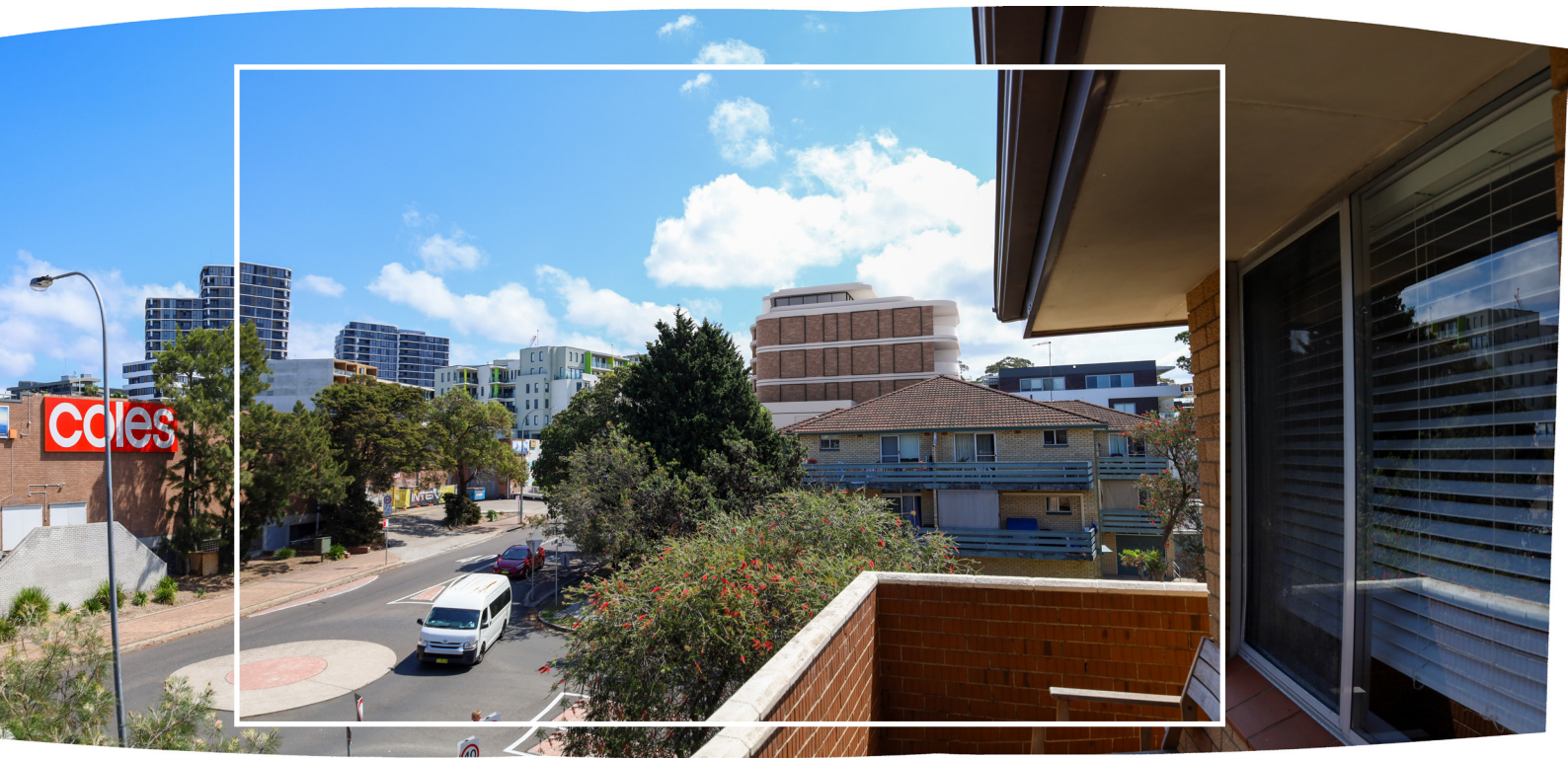
Panorama with nested image in white frame for additional context closer to natural field of view