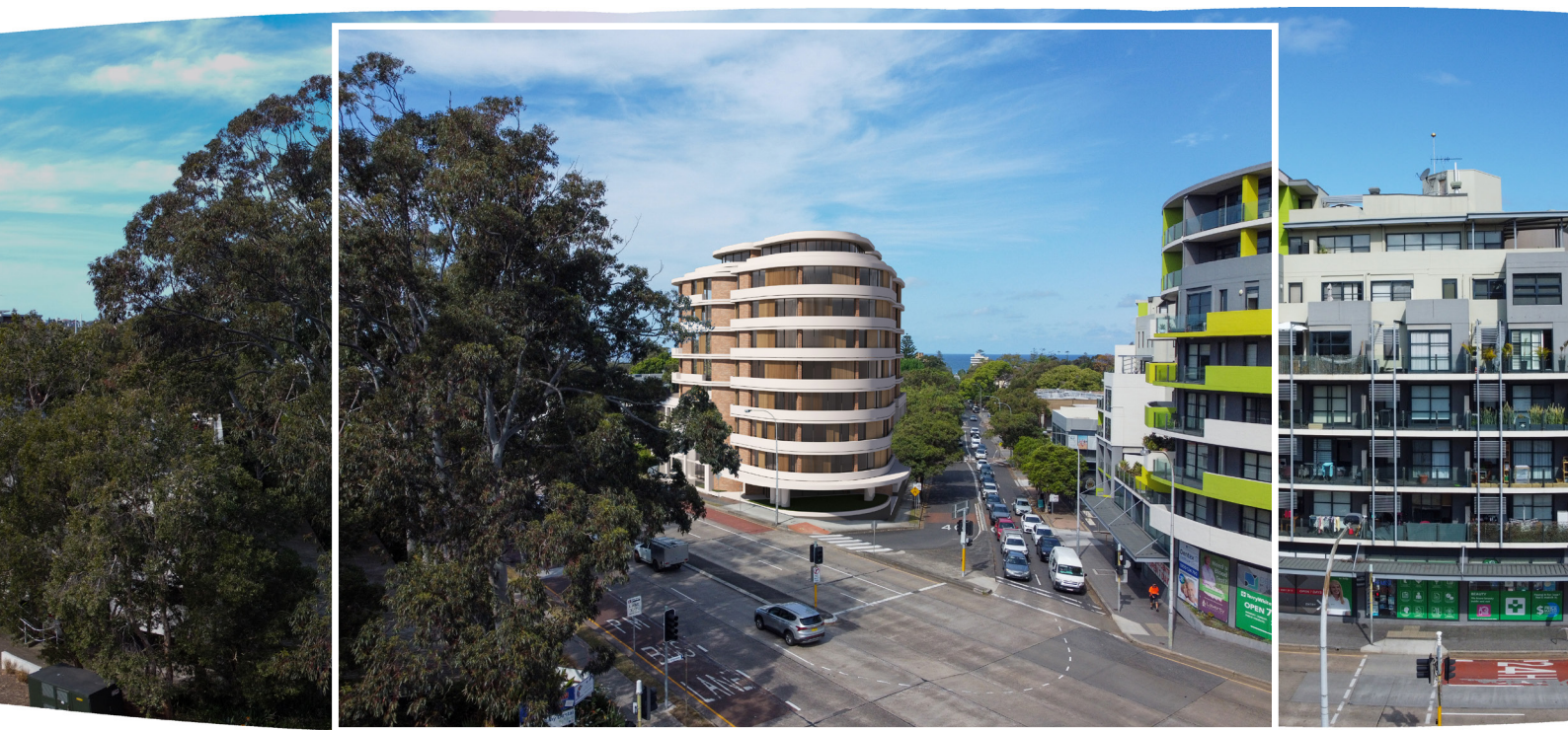
Panorama with nested image in white frame for additional context closer to natural field of view