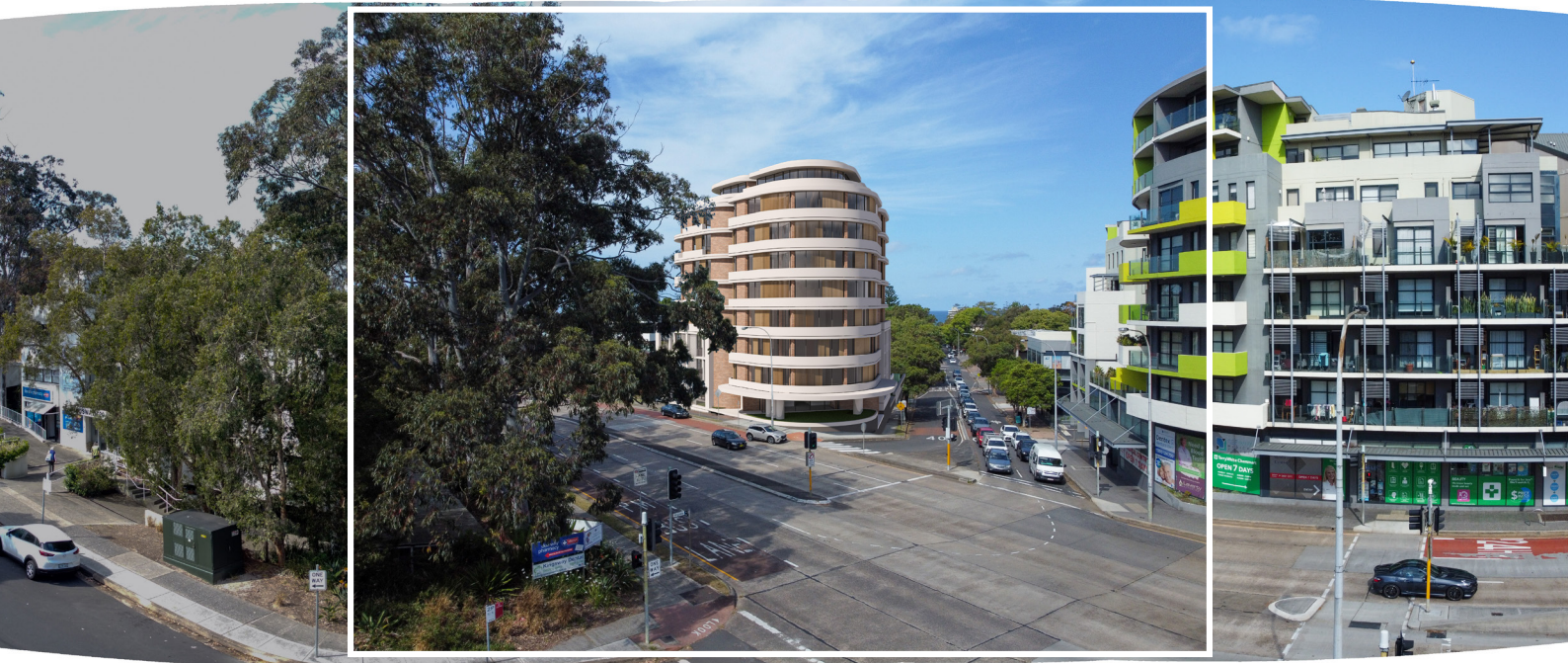
Panorama with nested image in white frame for additional context closer to natural field of view