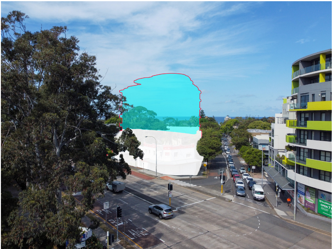
Difference between the complying and non-complying building envelope