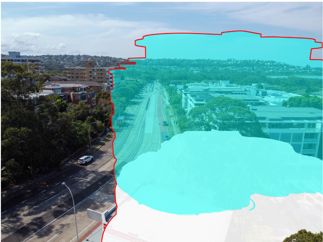
Difference between the complying and non-complying building envelope