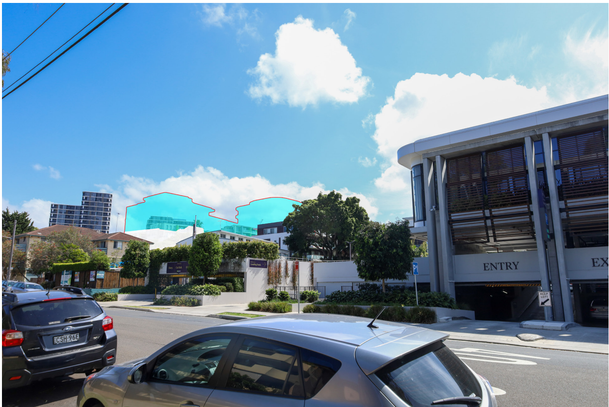
Difference between the complying and non-complying building envelope