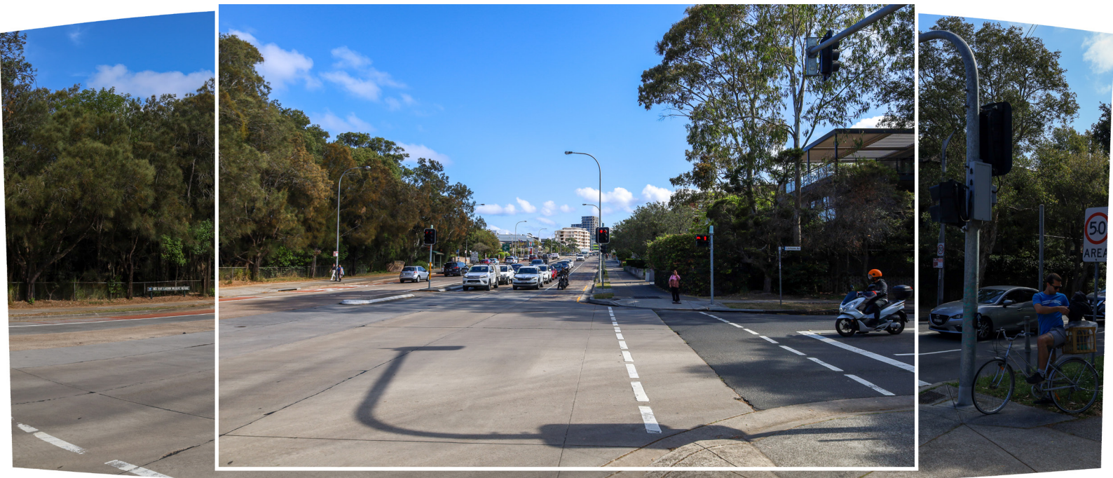
Panorama with nested image in white frame for additional context closer to natural field of view