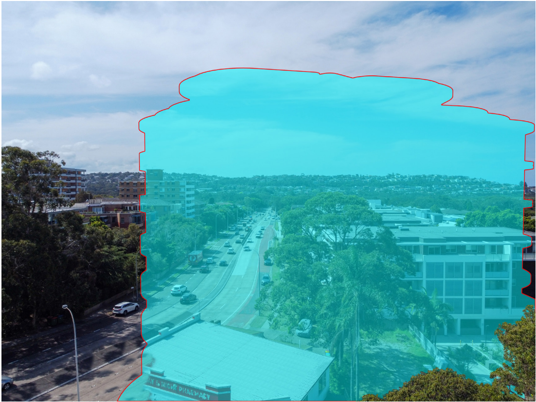
Visual impact in cyan with red outline