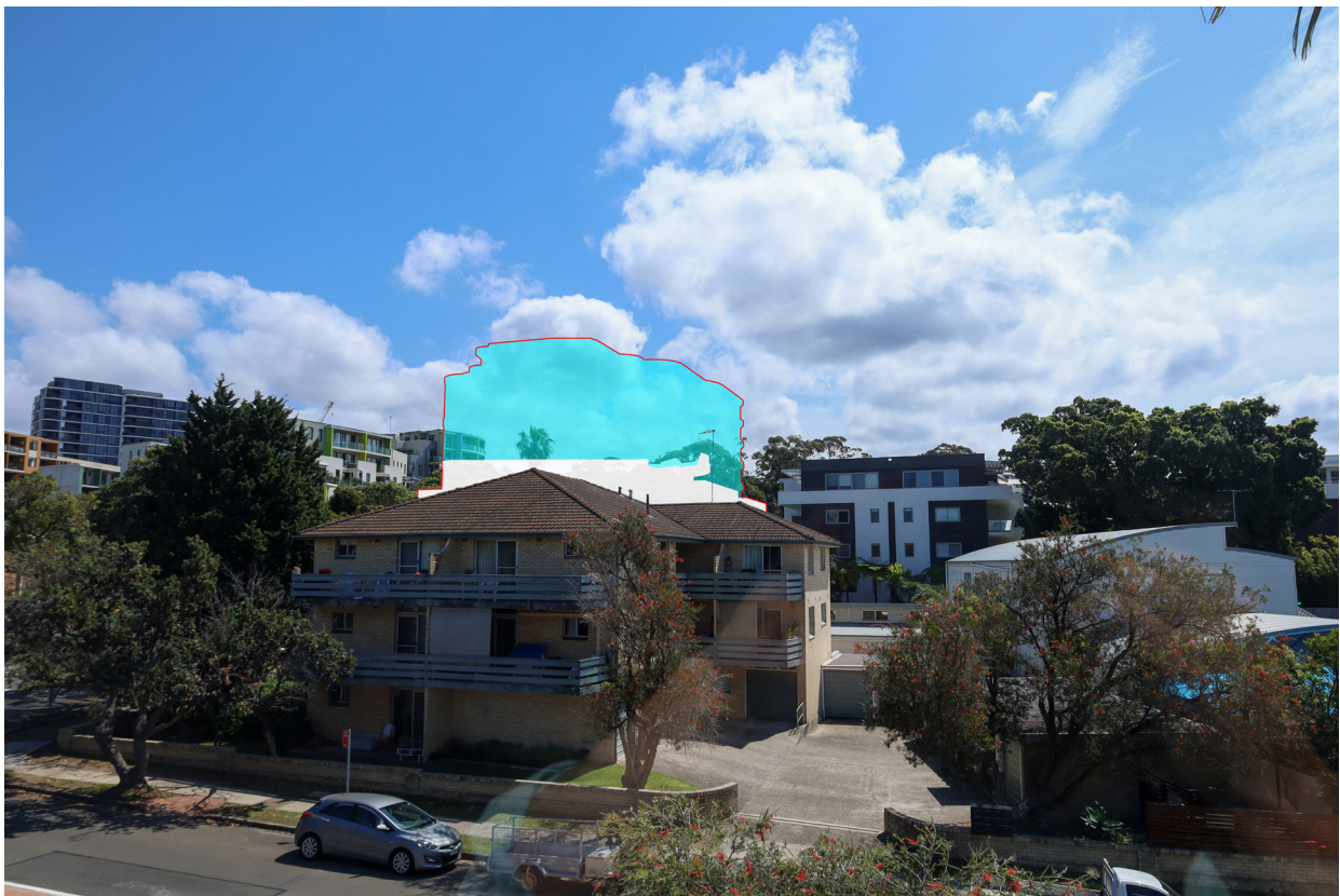
Difference between the complying and non-complying building envelope