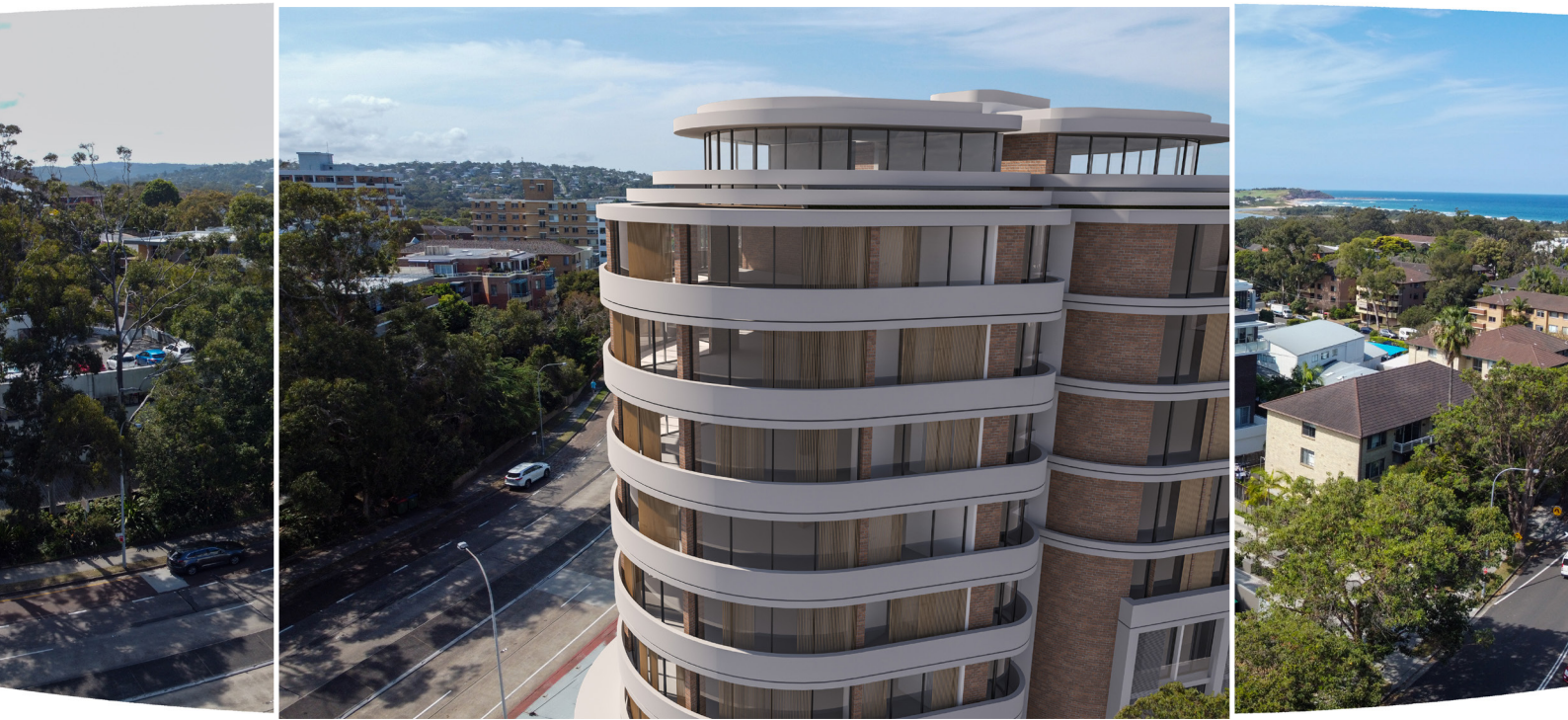
Panorama with nested image in white frame for additional context closer to natural field of view