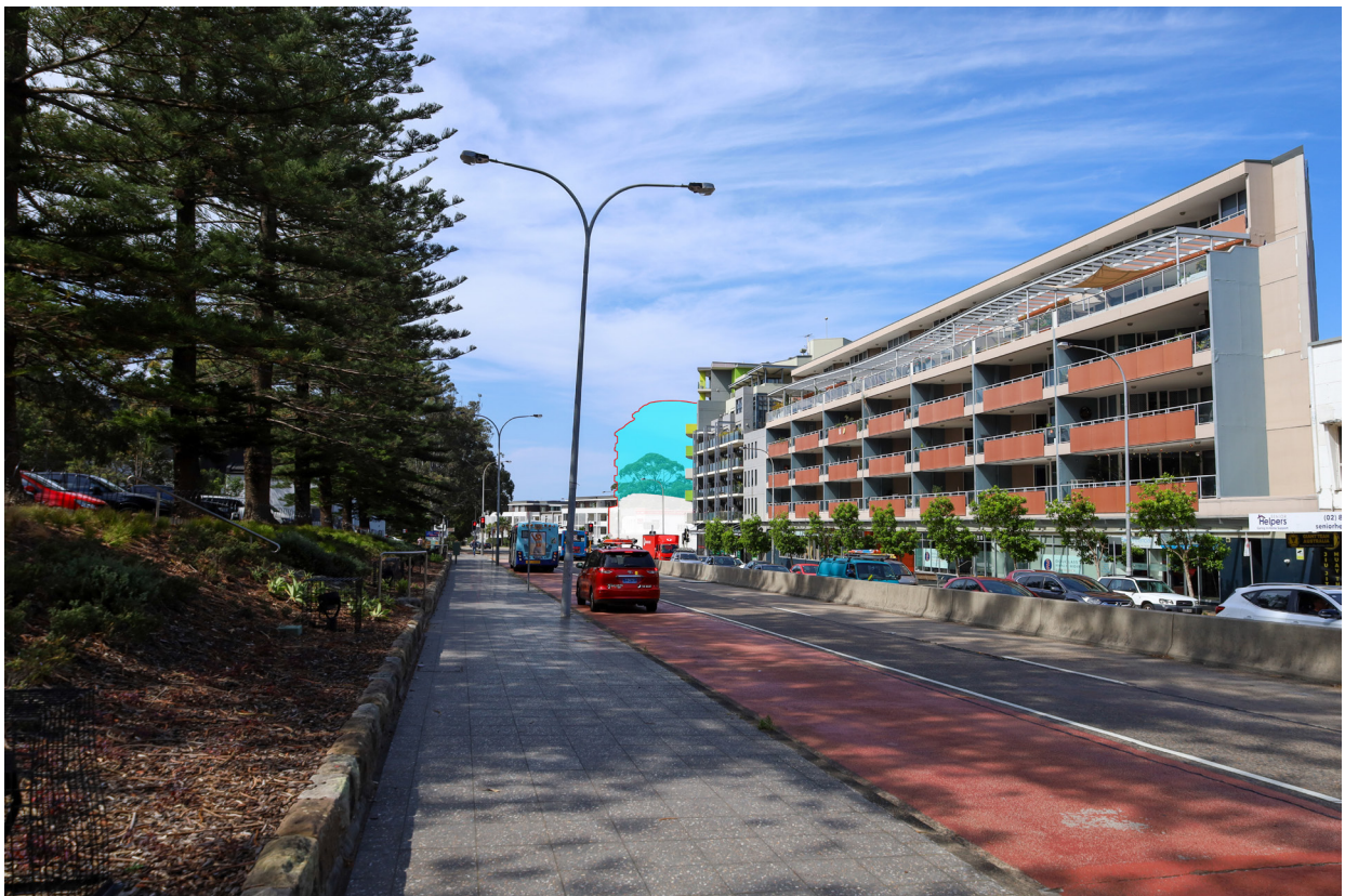
Difference between the complying and non-complying building envelope