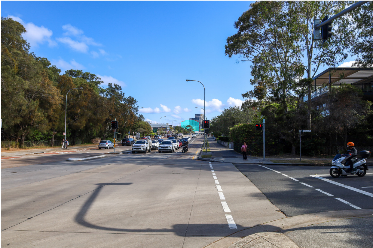
Visual impact in cyan with red outline