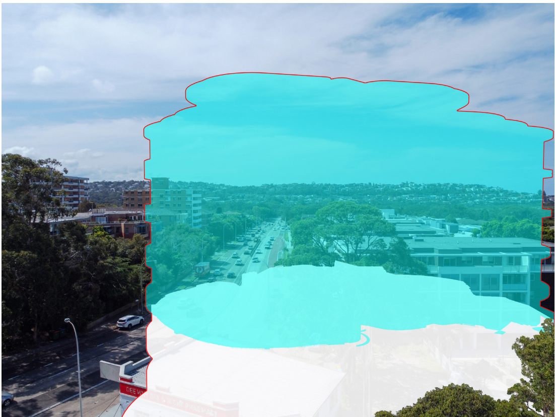
Difference between the complying and non-complying building envelope