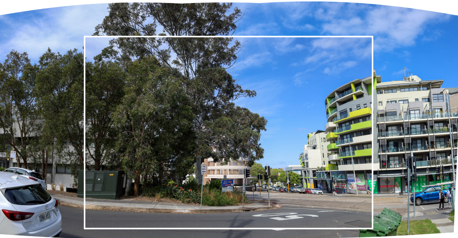
Panorama with nested image in white frame for additional context closer to natural field of view