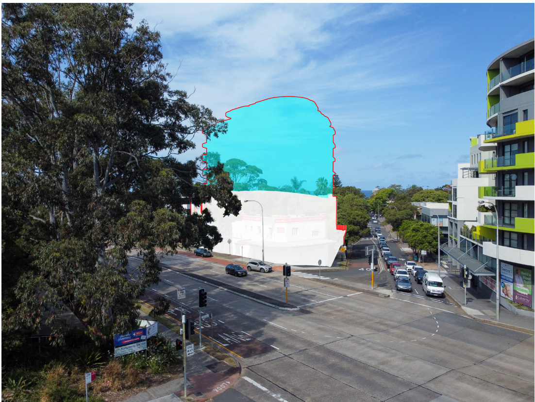
Difference between the complying and non-complying building envelope