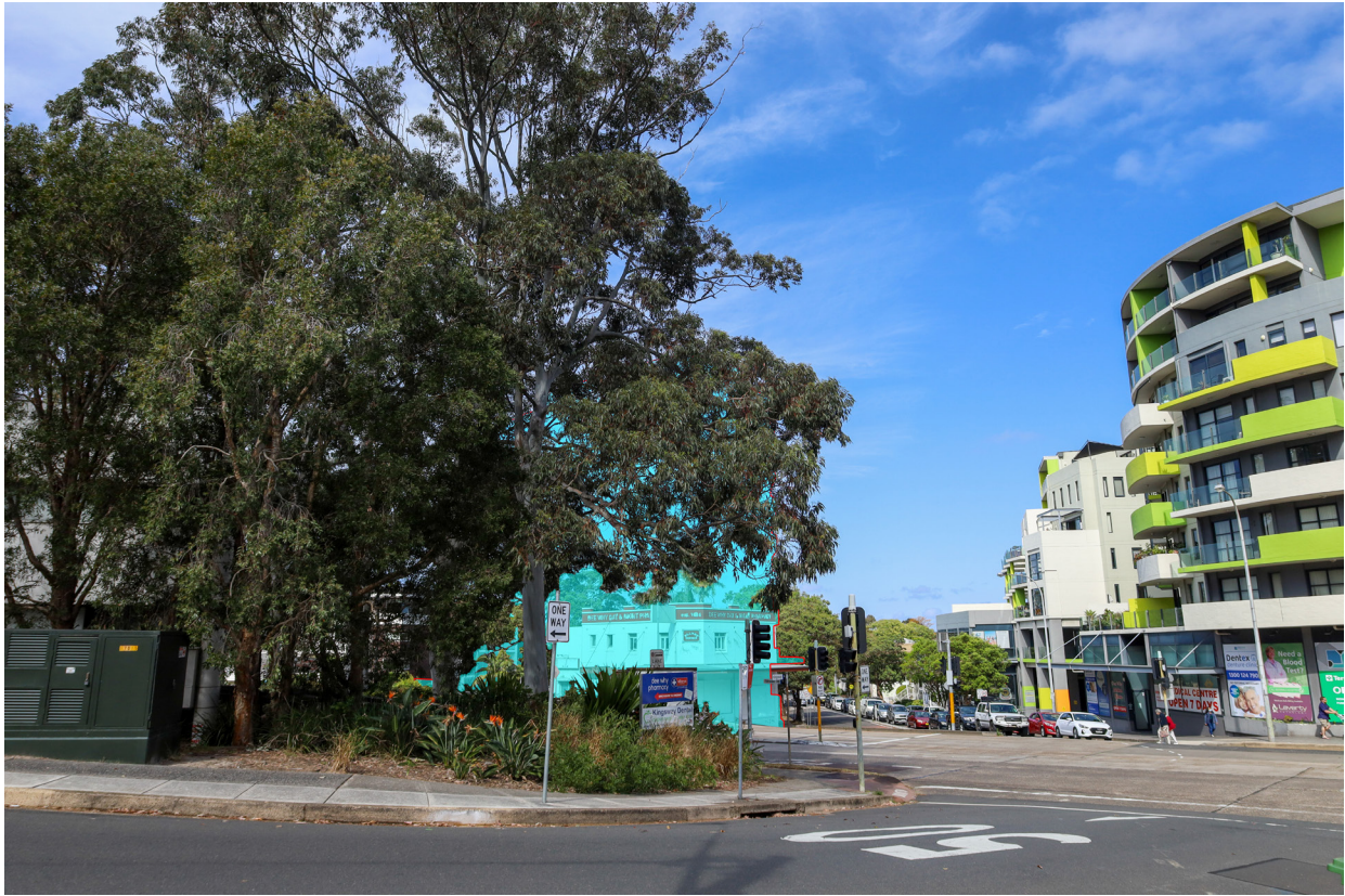
Visual impact in cyan with red outline