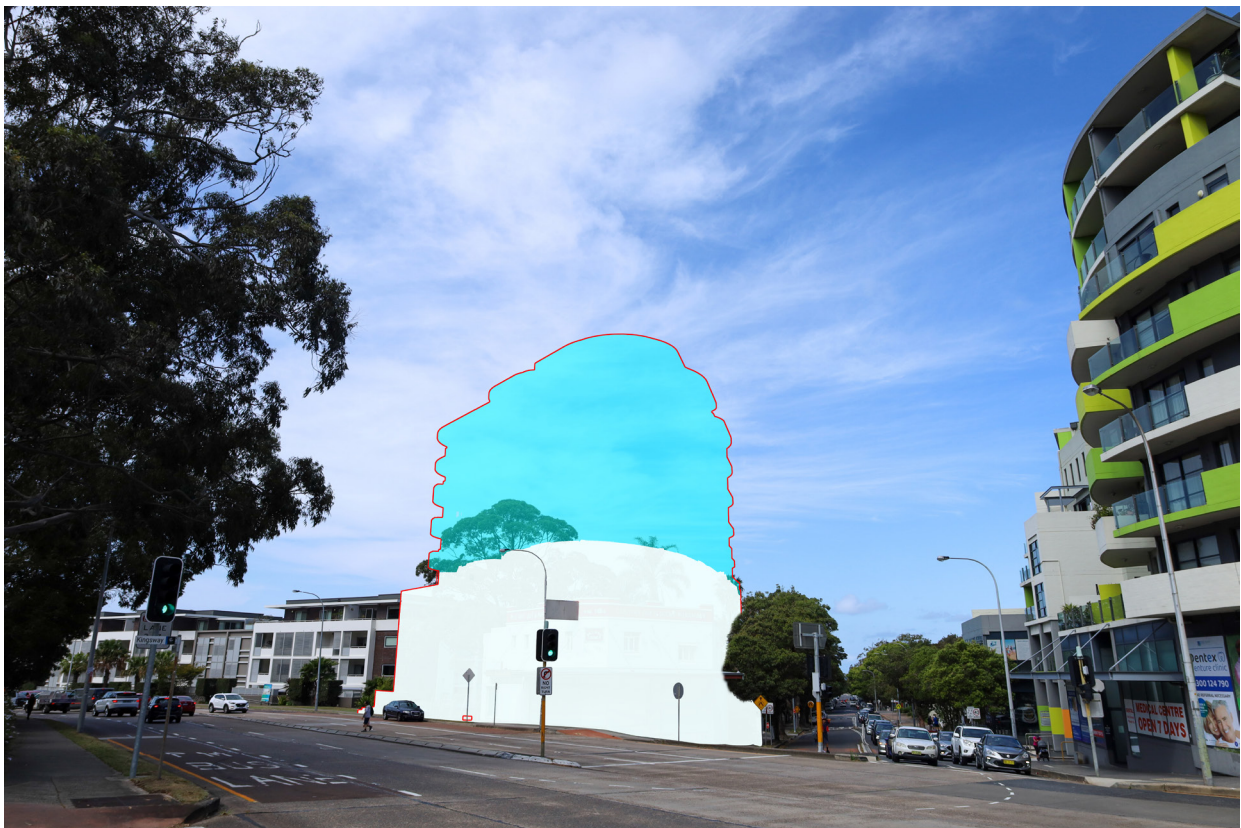
Difference between the complying and non-complying building envelope