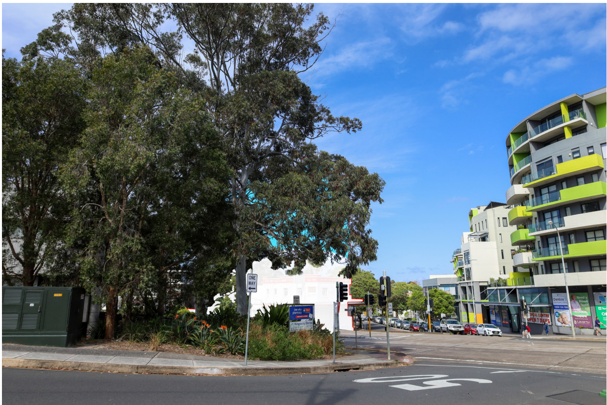
Difference between the complying and non-complying building envelope