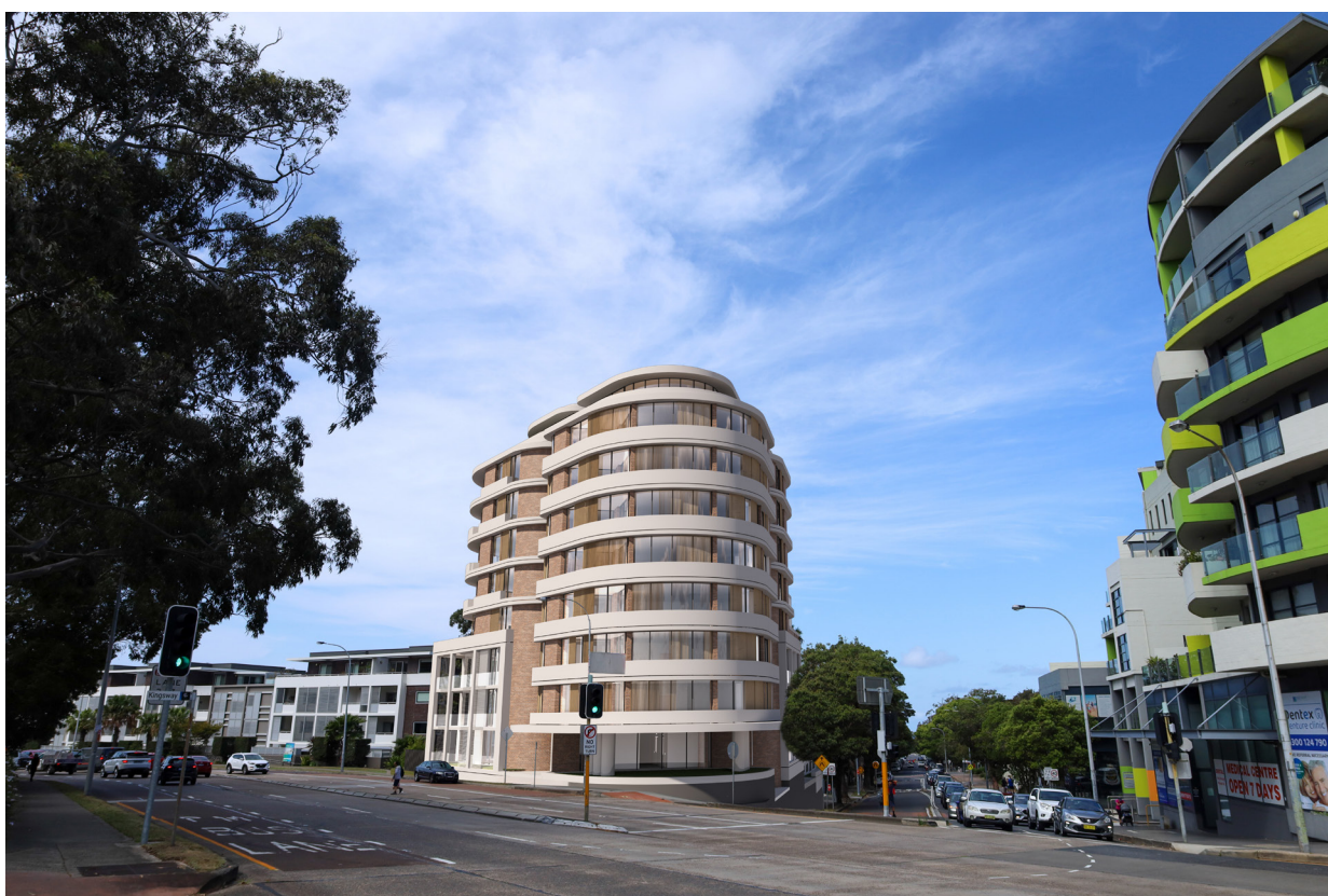
Photomontaged view of new proposal