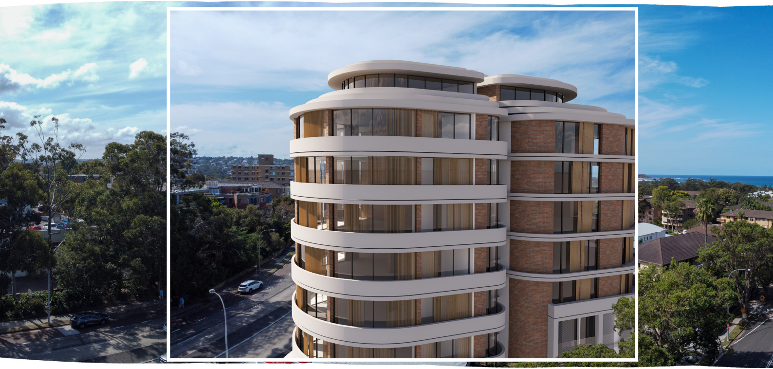
Panorama with nested image in white frame for additional context closer to natural field of view