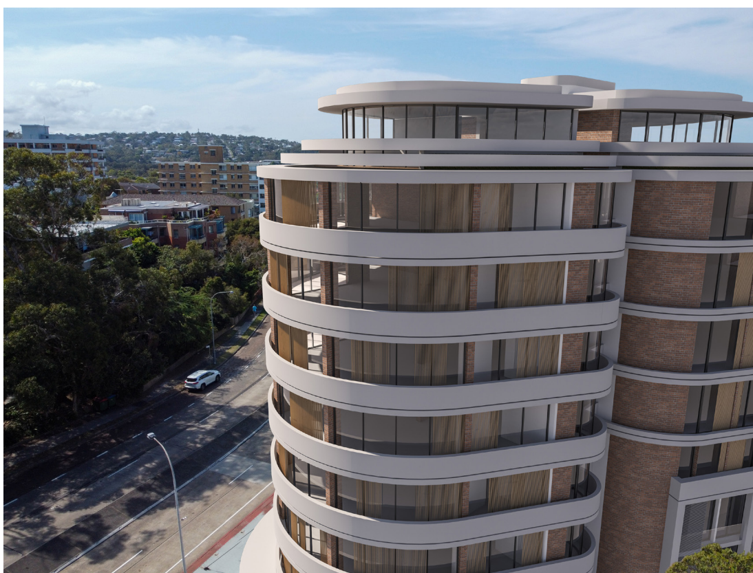
Photomontaged view of new proposal