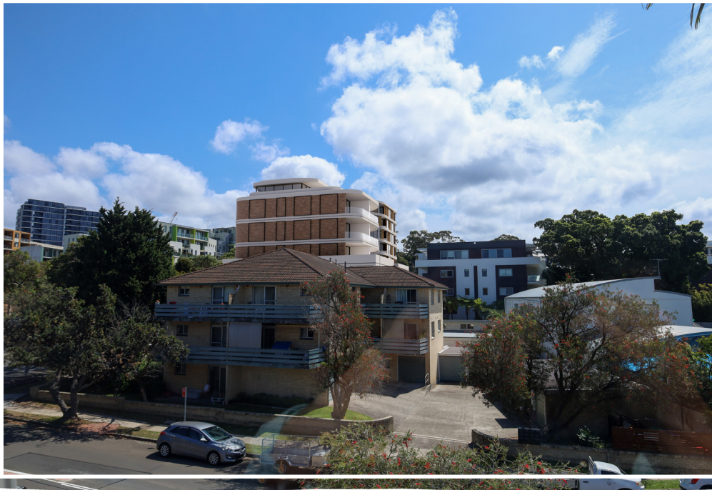
Panorama with nested image in white frame for additional context closer to natural field of view