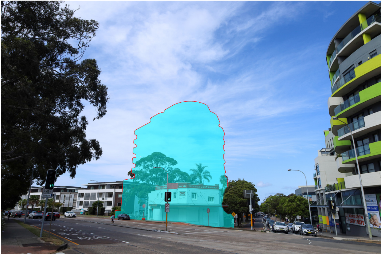
Visual impact in cyan with red outline