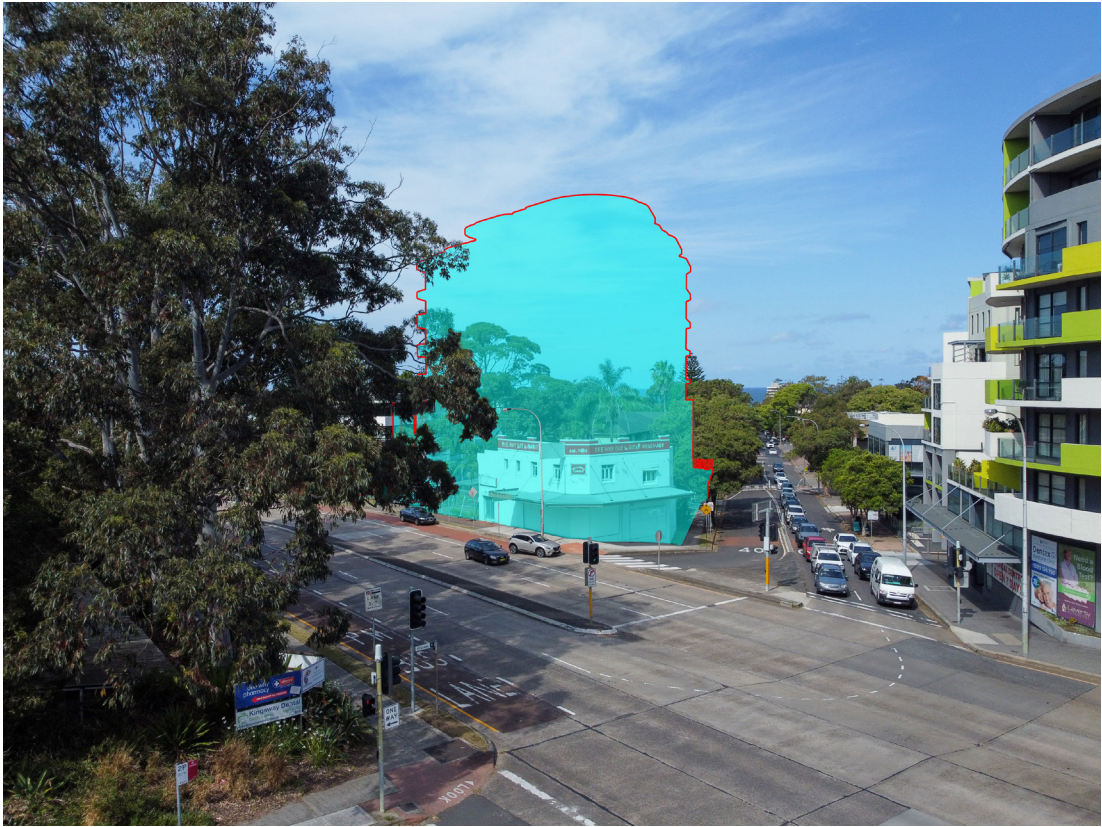
Visual impact in cyan with red outline