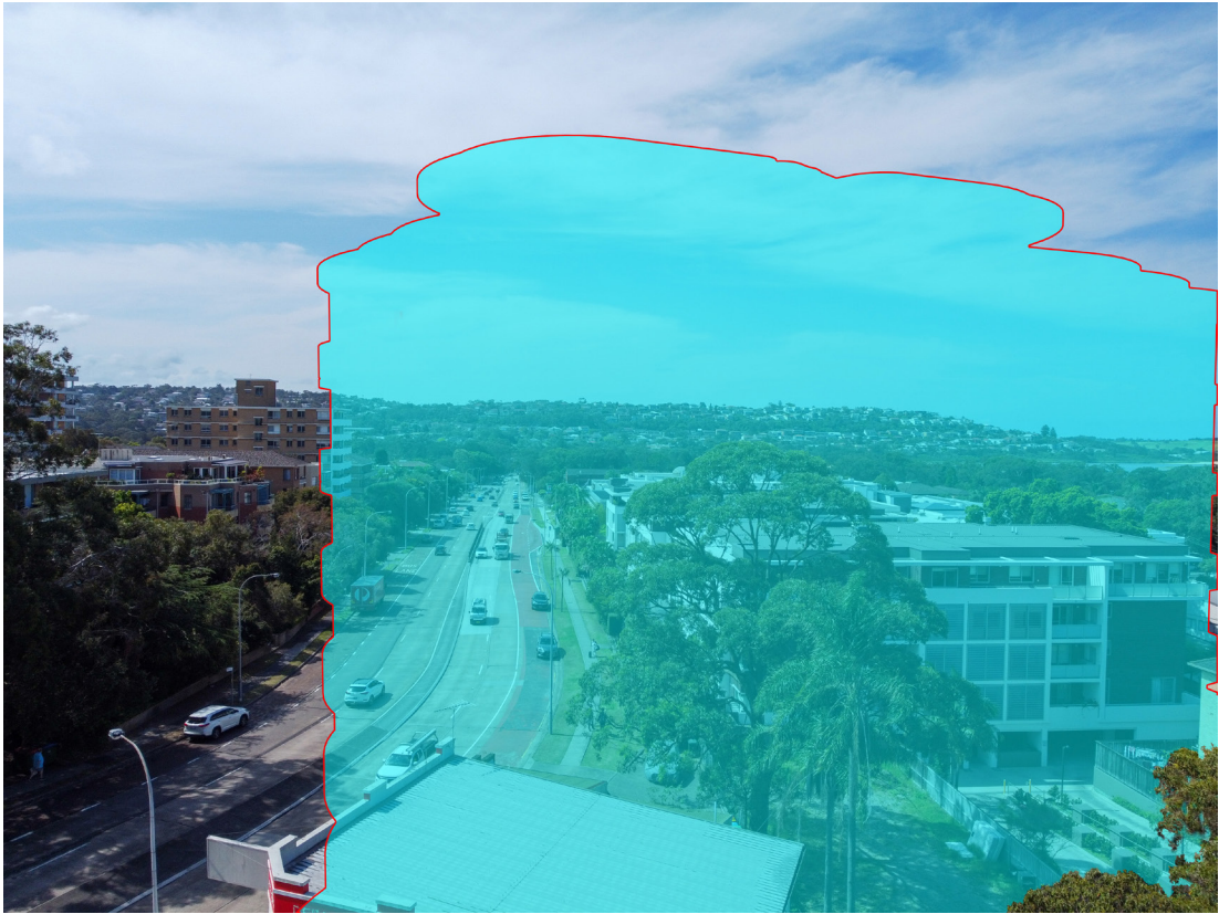
Visual impact in cyan with red outline