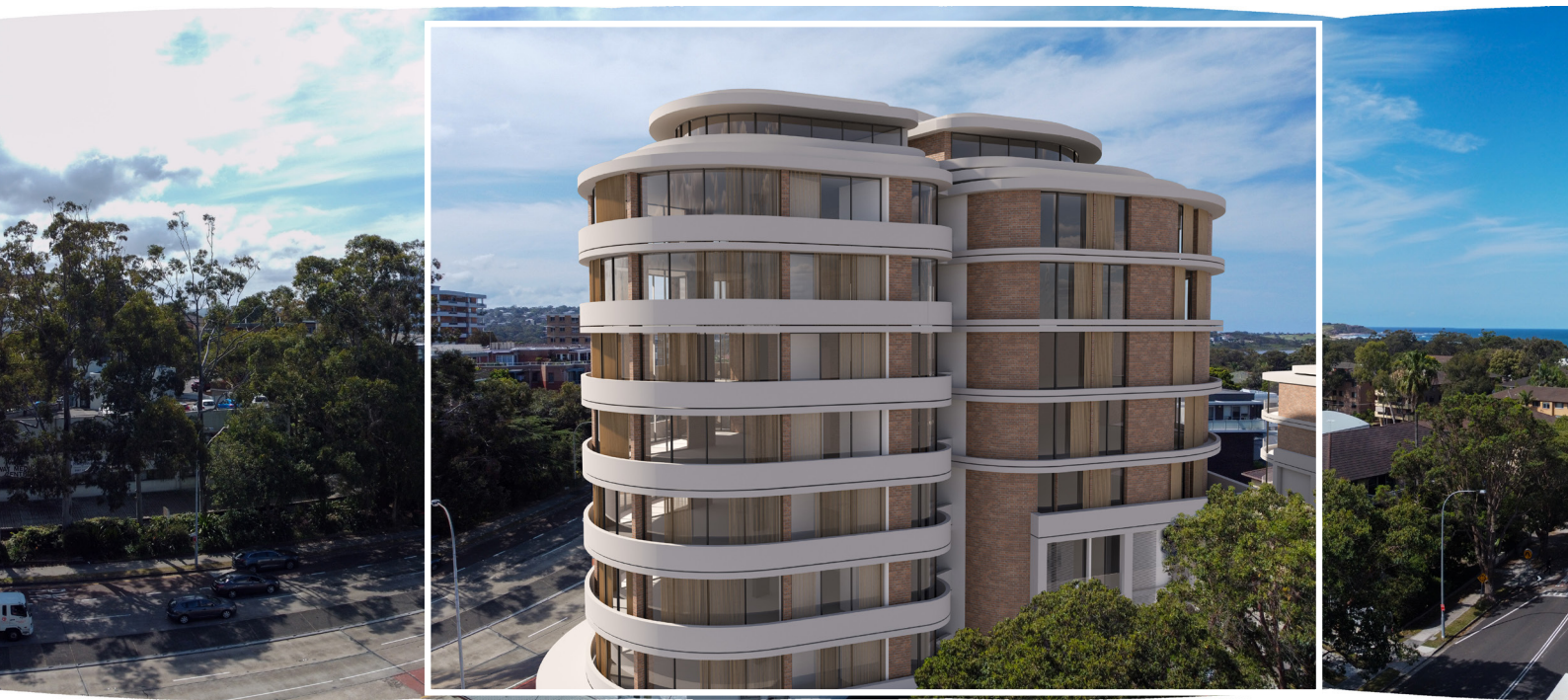
Panorama with nested image in white frame for additional context closer to natural field of view