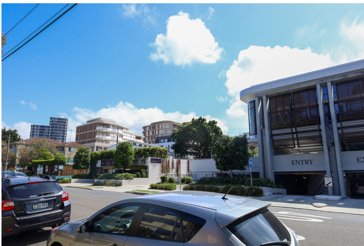
Photomontaged view of new proposal