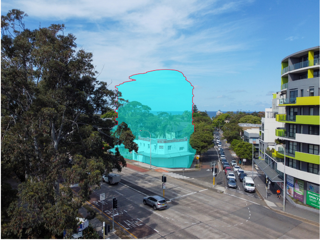
Visual impact in cyan with red outline