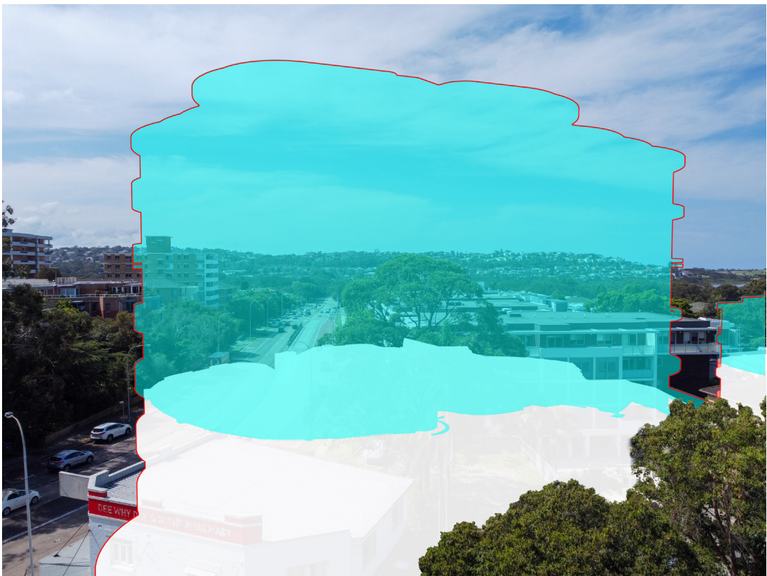
Difference between the complying and non-complying building envelope