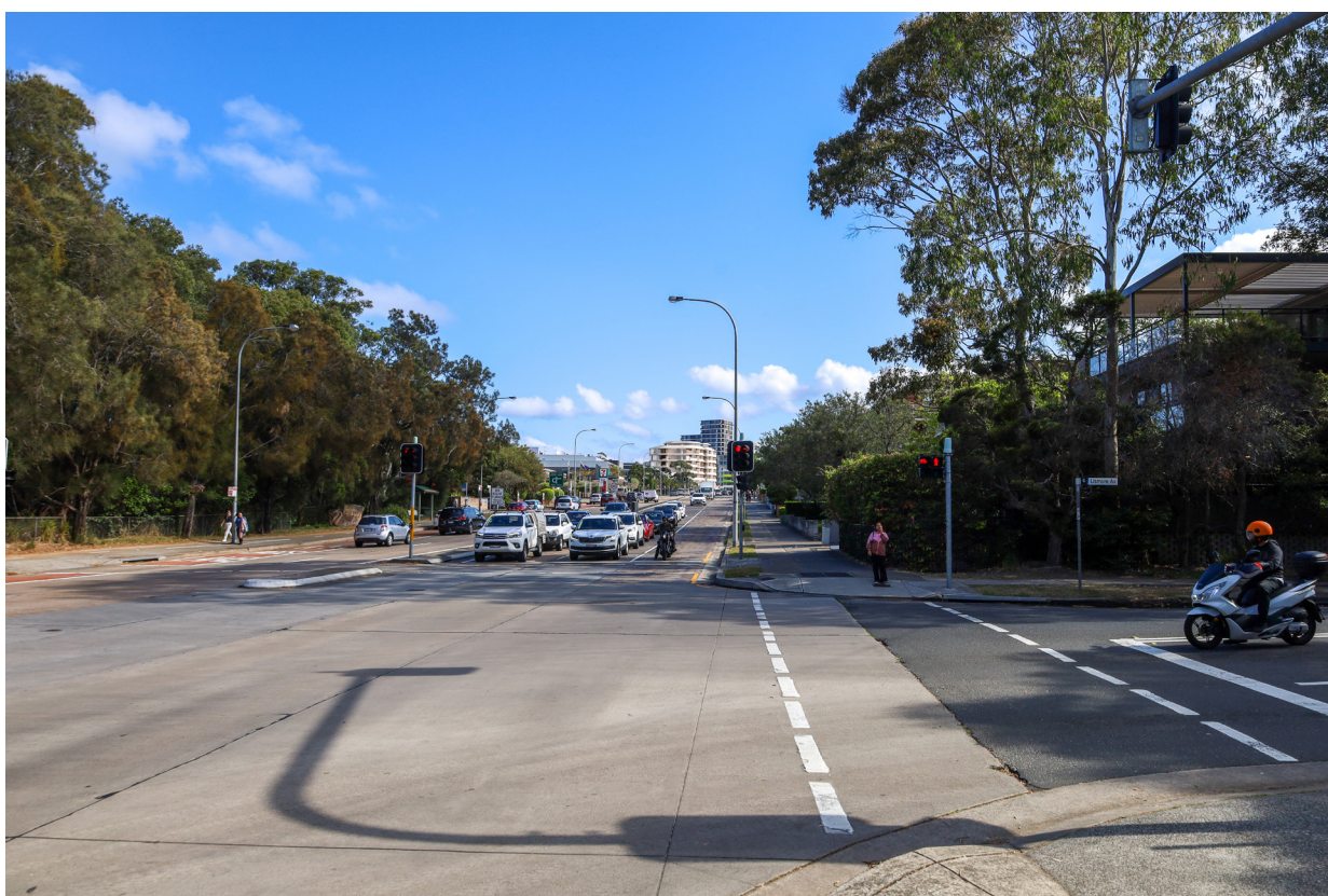
Photomontaged view of new proposal