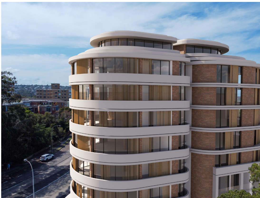
Photomontaged view of new proposal