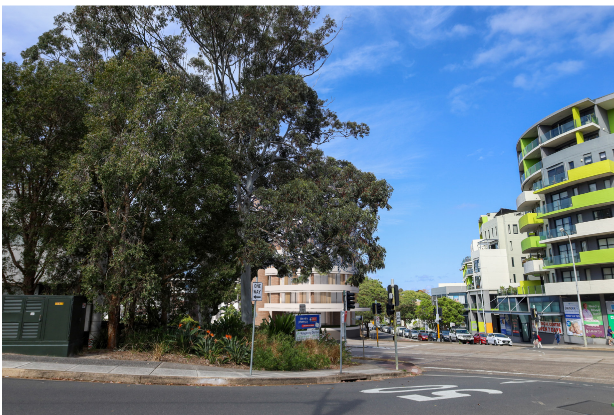
Photomontaged view of new proposal