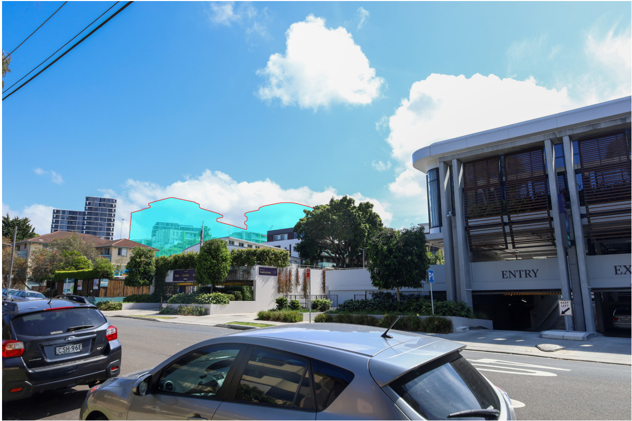
Visual impact in cyan with red outline