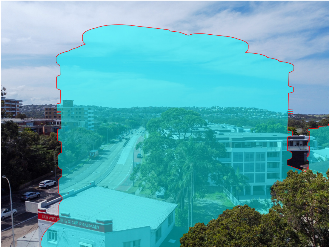
Visual impact in cyan with red outline