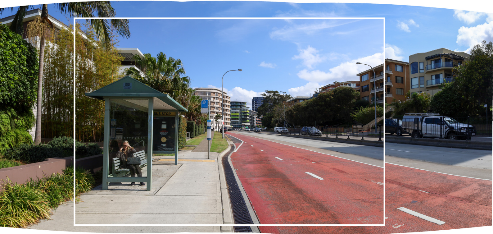
Panorama with nested image in white frame for additional context closer to natural field of view