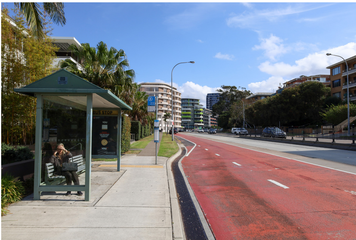
Photomontaged view of new proposal