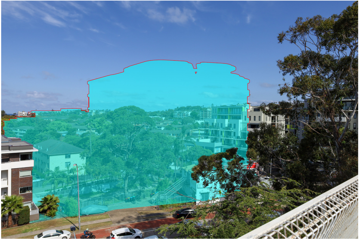
Visual impact in cyan with red outline