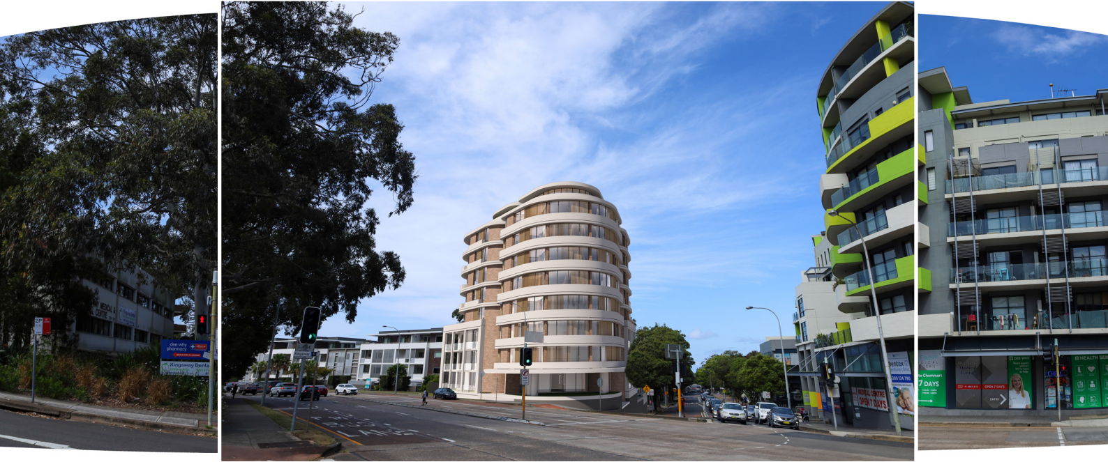
Panorama with nested image in white frame for additional context closer to natural field of view