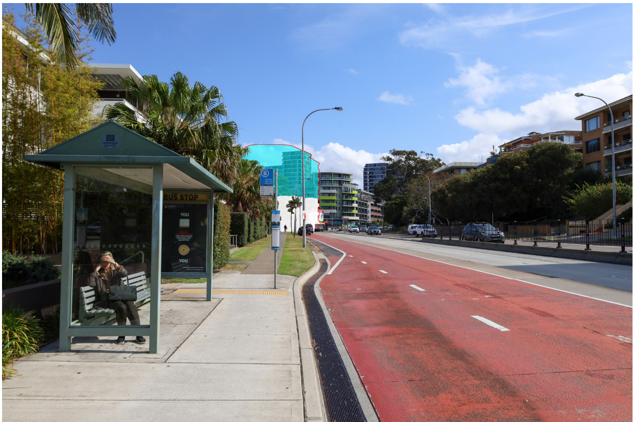
Difference between the complying and non-complying building envelope