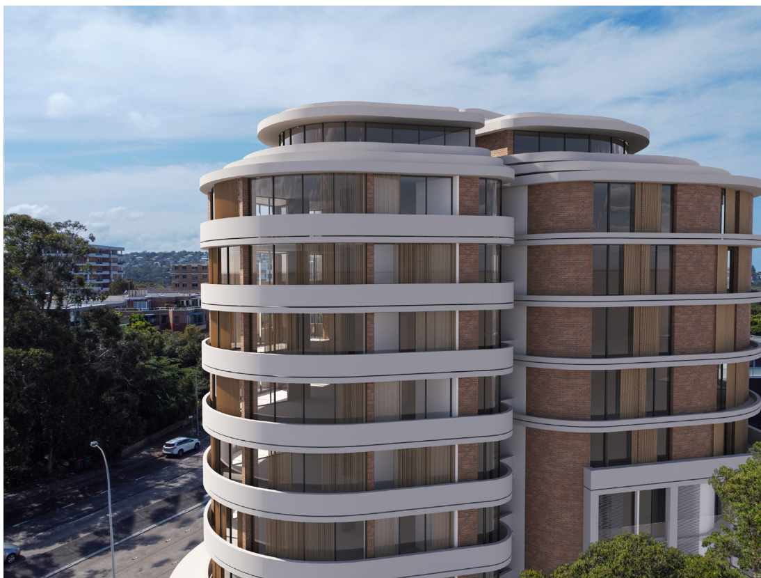
Photomontaged view of new proposal