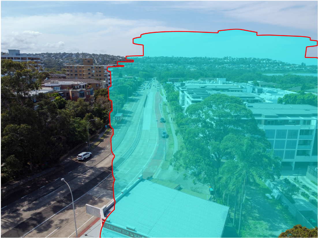
Visual impact in cyan with red outline