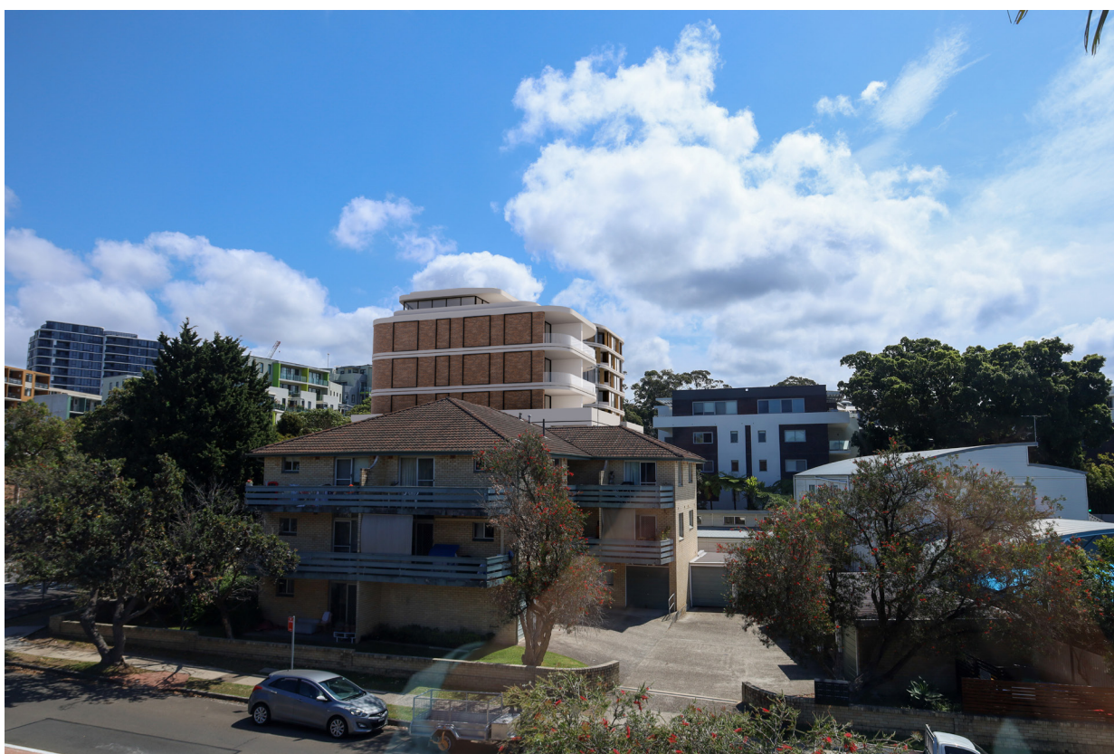
Photomontaged view of new proposal