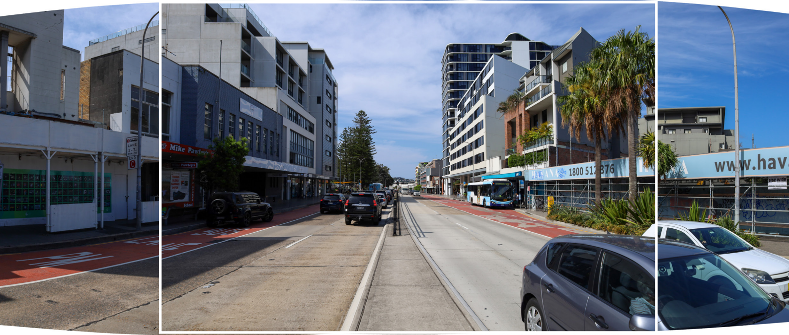
Panorama with nested image in white frame for additional context closer to natural field of view