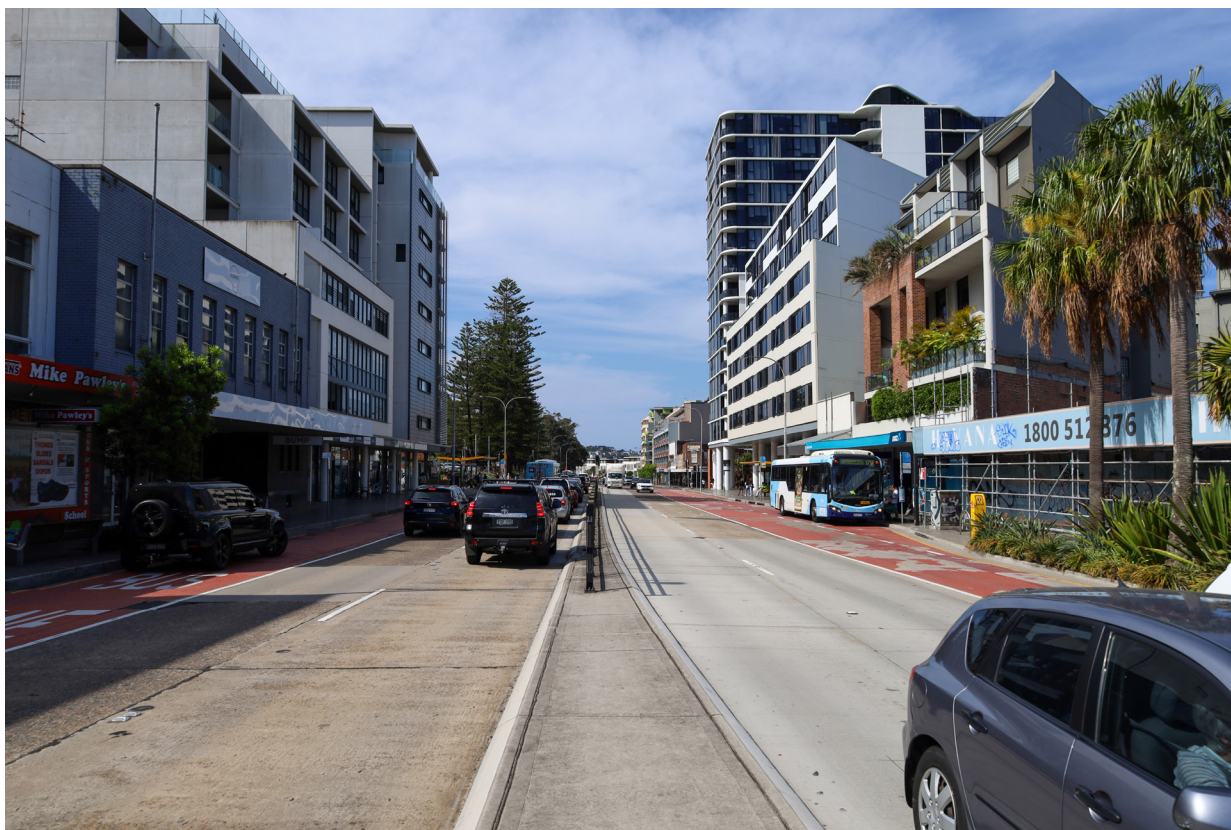
Photomontaged view of new proposal