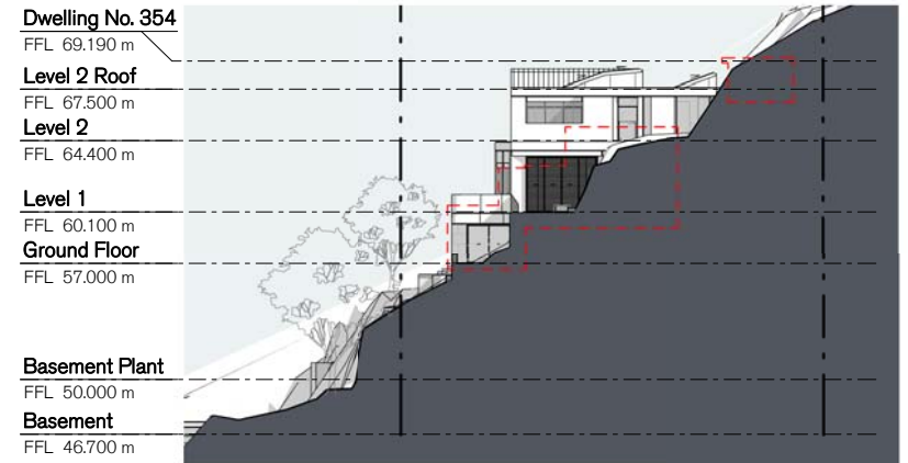
4 | Elevation North Notification 1 : 500