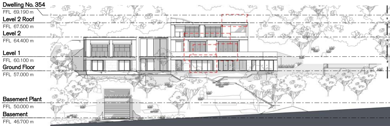
1 | Elevation East Notification 1 : 500