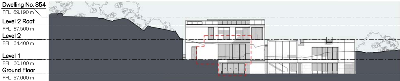
3 | Elevation West Notification 1 : 500