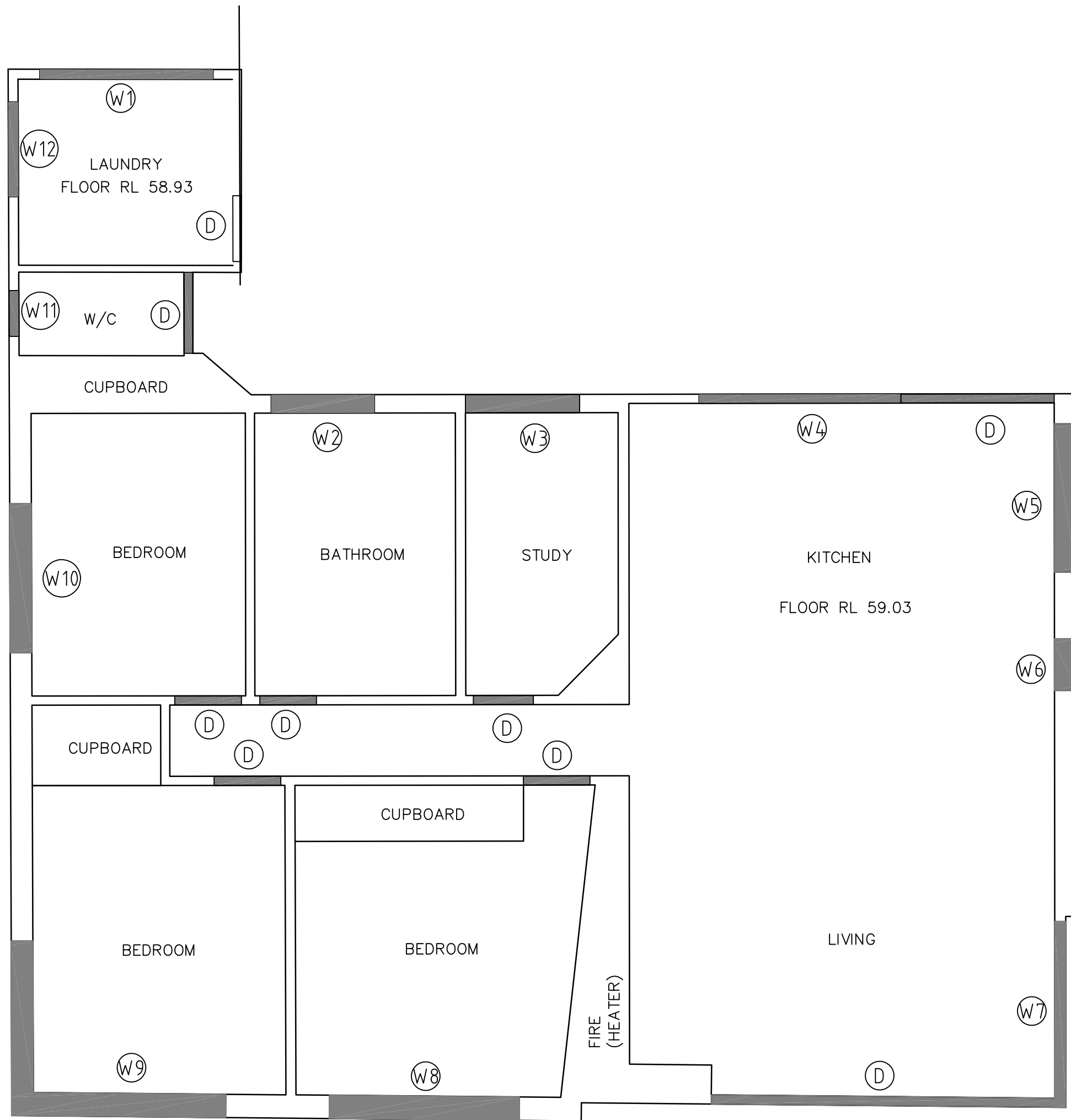
UPPER FLOOR INTERNAL FLOOR PLAN