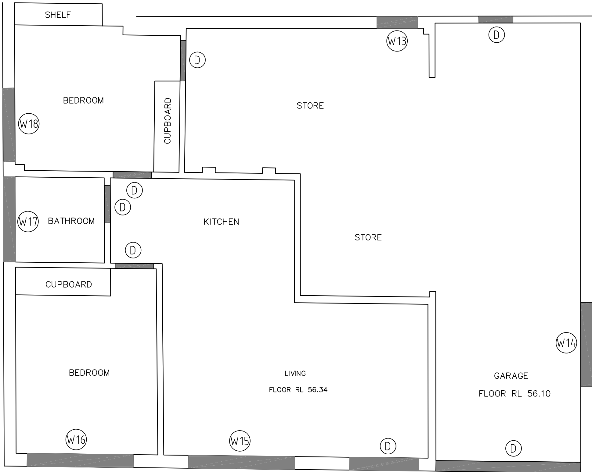
LOWER FLOOR INTERNAL FLOOR PLAN