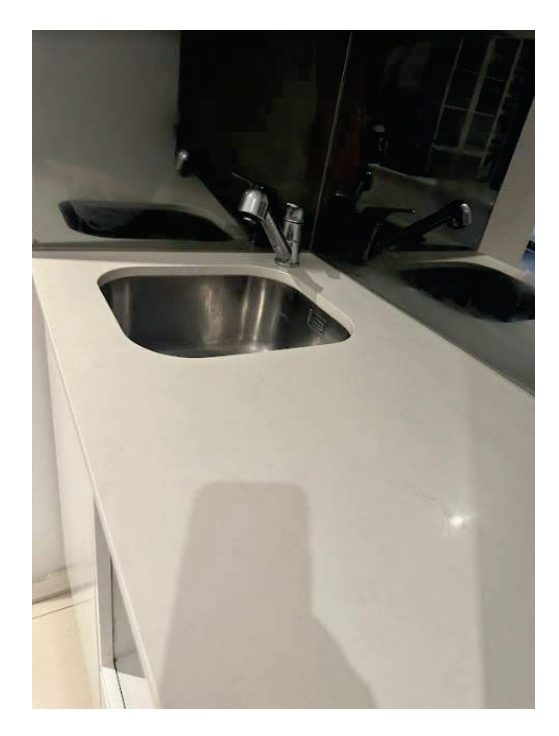
Sink with hot and cold mixer