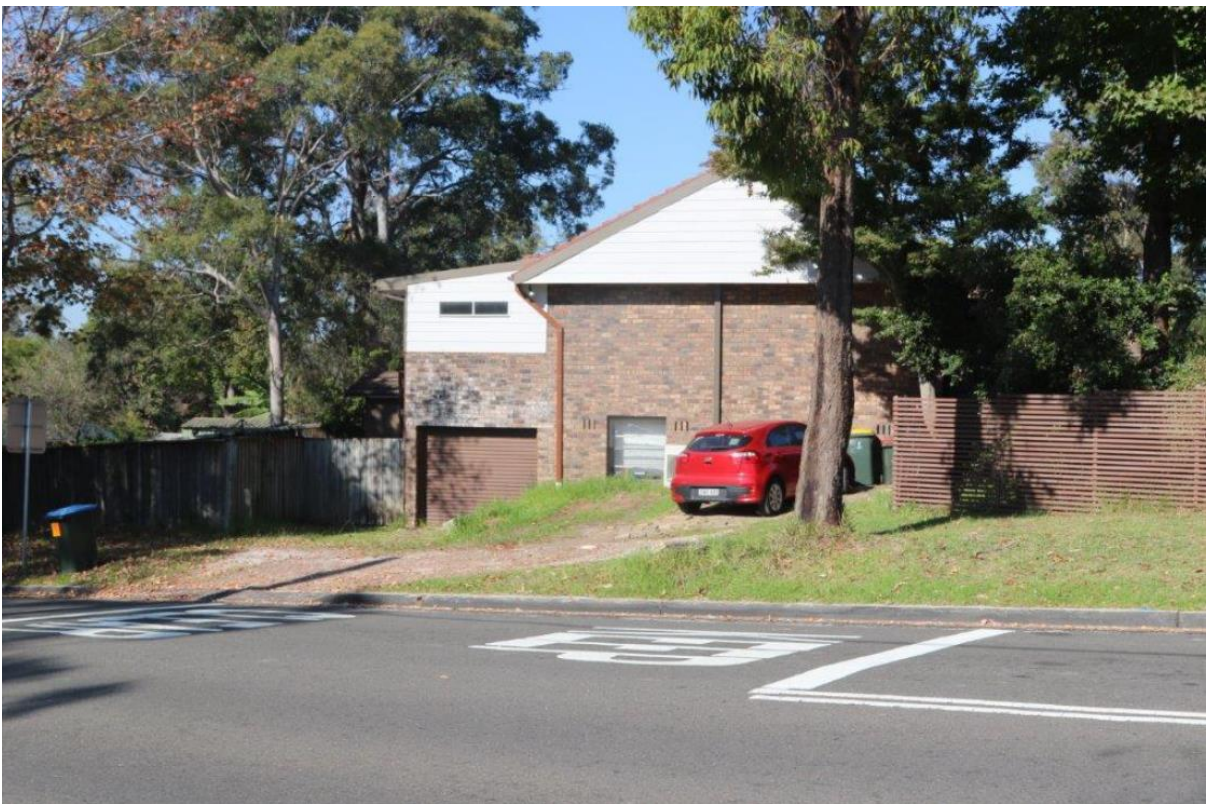
Figure3 –existing vehicle access point and secondary street frontage character (Adams Street)