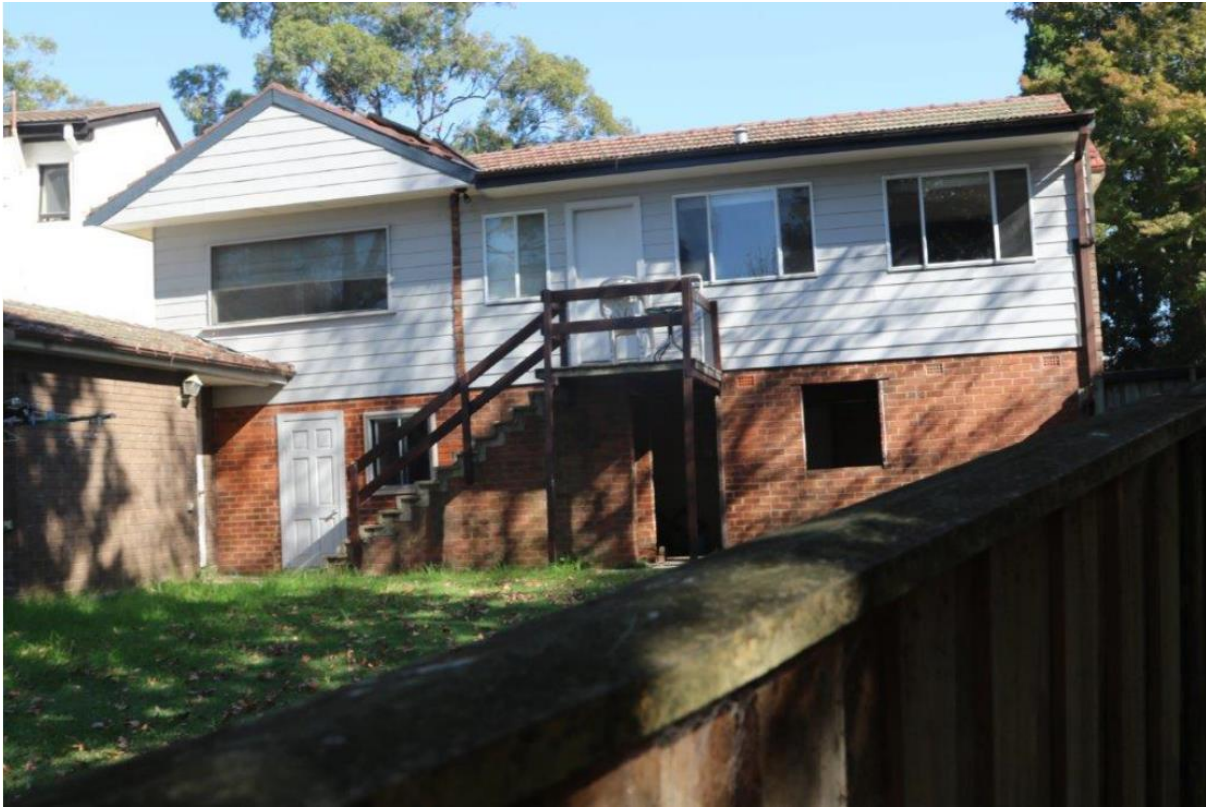
Figure 2 - existing dwelling as viewed from the rear