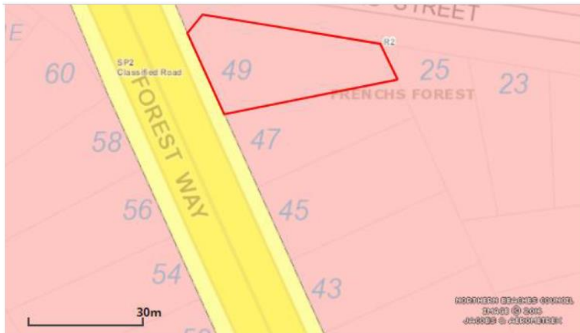
WARRINGAH LAND ZONING MAP

As previously noted, the site is zoned R2 Low Density Residential pursuant to the provisions of the Warringah Local Environmental Plan 2011. Secondary Dwelling are a permissible use with development consent in the zone.