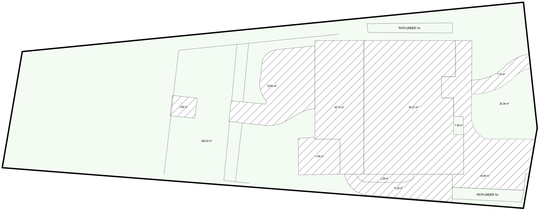
EXISTING LANDSCAPED AREA PLAN