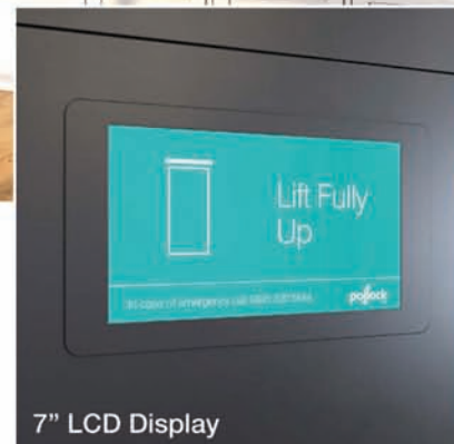
7" LCD Display

“ We love our Iconic Elevator. Quiet and stylish – we were able to choose colours that perfectly matched our decor and the service was outstanding. ”