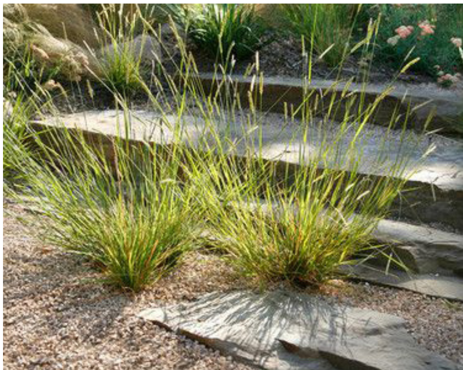
Native grasses and understorey planting