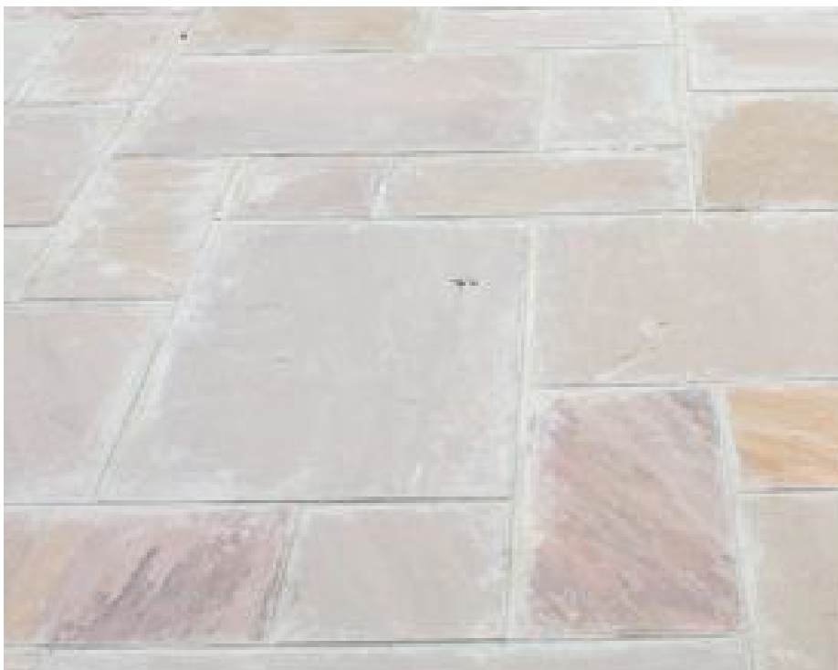
Proposed sandstone paving to match existing