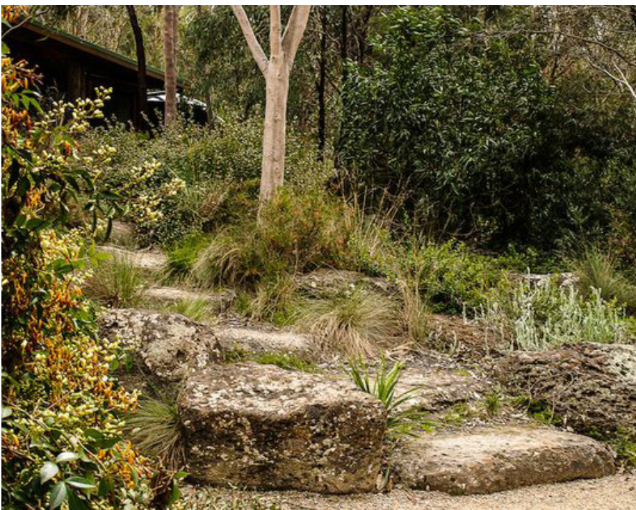
Native planting with bush rock access paths