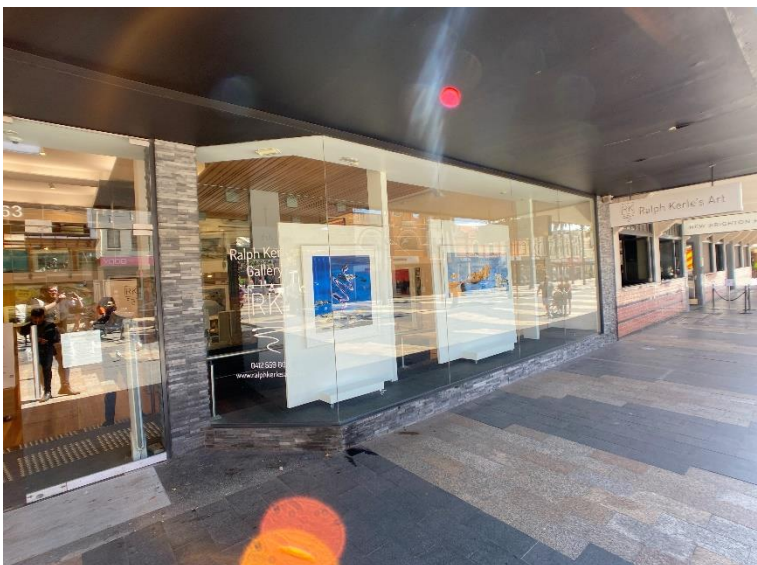
The subject frontage, since altered, shows plain contemporary sheeting on the soffit of the suspended awning.