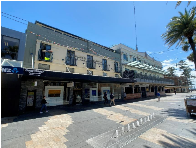
Subject site from The Corso.