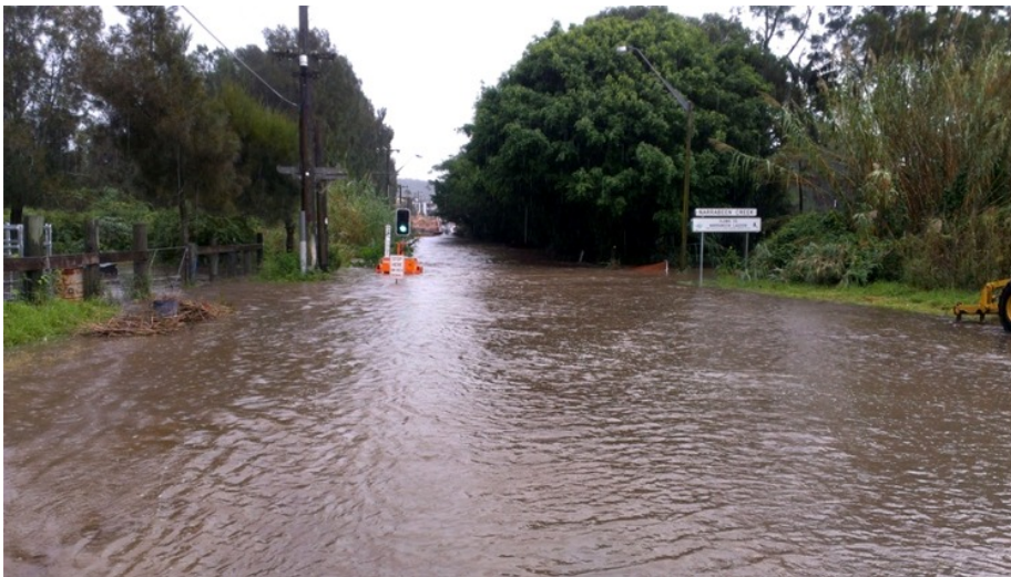
Macpherson Street rain event when the Culvert was under construction