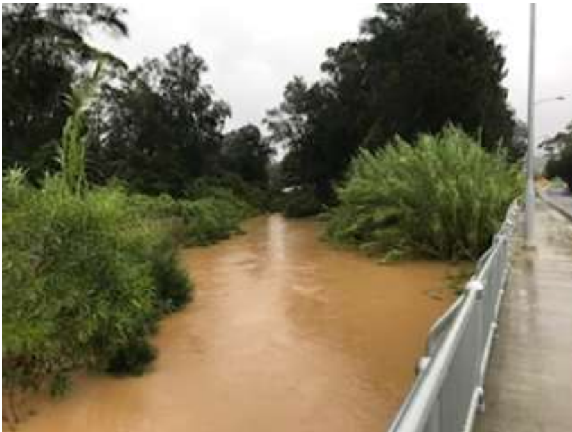
Downstream – creek almost at the road level