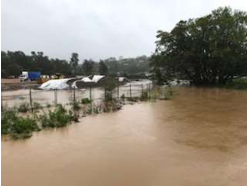
Upstream – almost at the filled level of 2 Macpherson Street