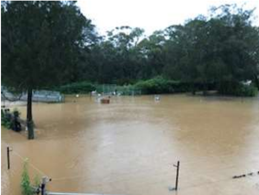
Downstream horse paddock