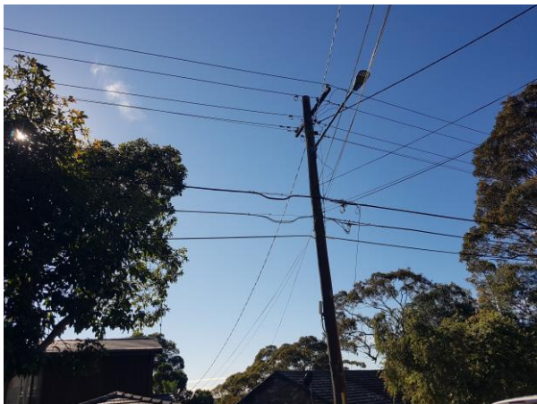
Existing electrical supply point