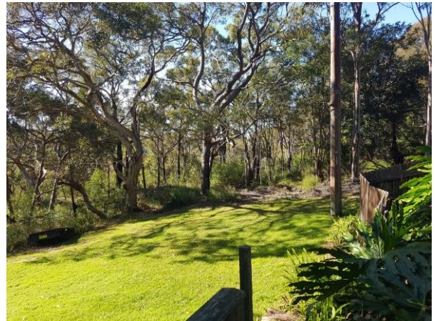
Main bushfire risk, looking North East