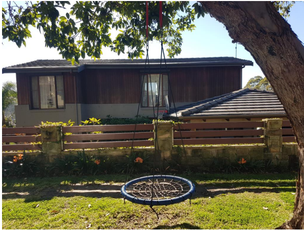
Existing residence, looking North