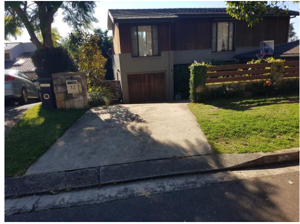
Existing driveway / access, looking North