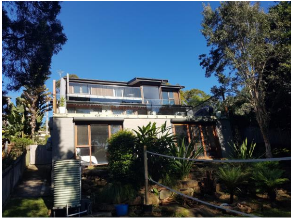
Existing residence, rear elevation, looking South