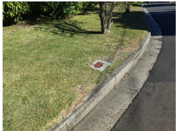
Reticulated water supply