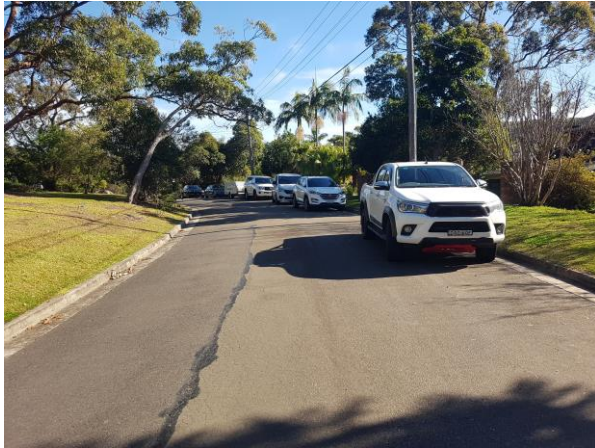
Badcoe Road, looking West