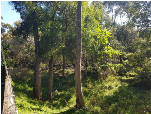
Main bushfire risk, looking North West