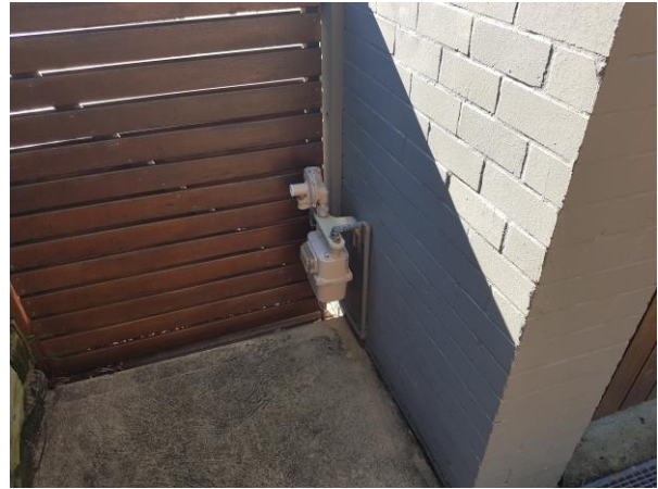
Existing reticulated gas supply