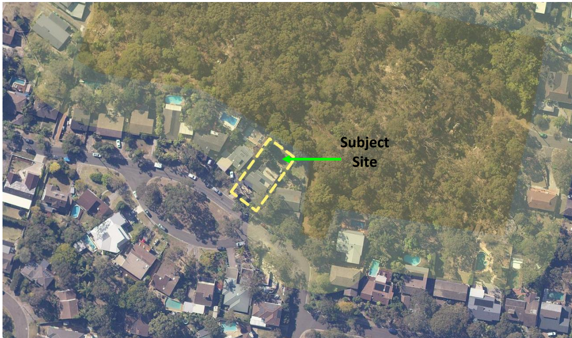
Extract Northern Beaches Council LGA Bushfire Prone Land Map