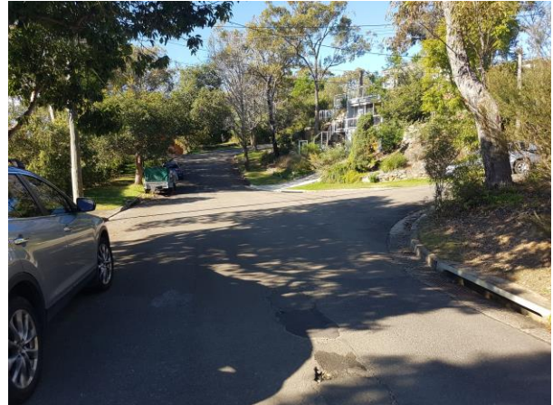
Badcoe Road, looking East