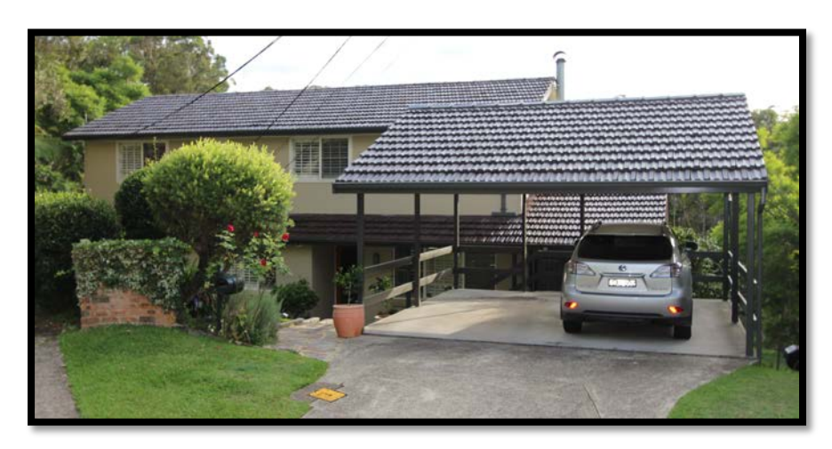
Fig 2: 5 Mulawa Place as seen from the street. (Action Plans 2019).