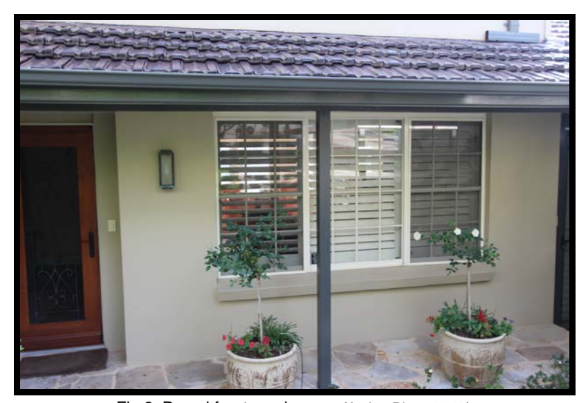
Fig 3: Paved front porch area. (Action Plans 2019).