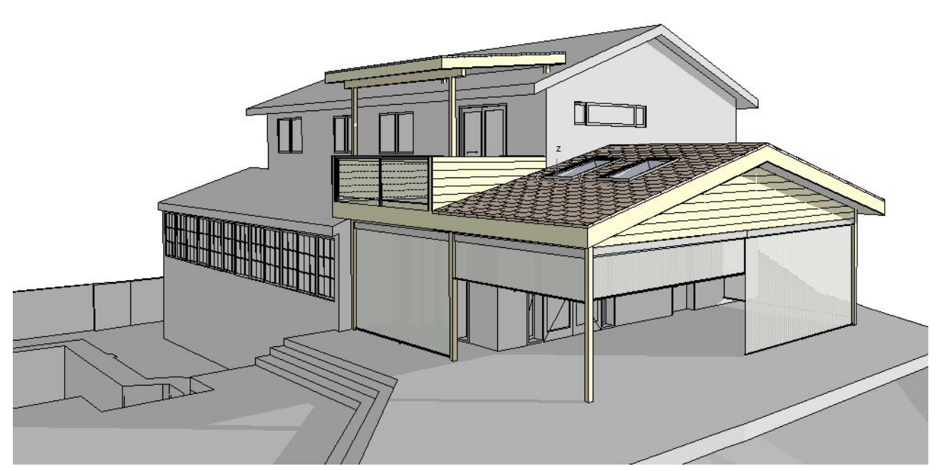
Fig 7: Proposed works at No. 102 Fuller Street. (Action Plans 2019).