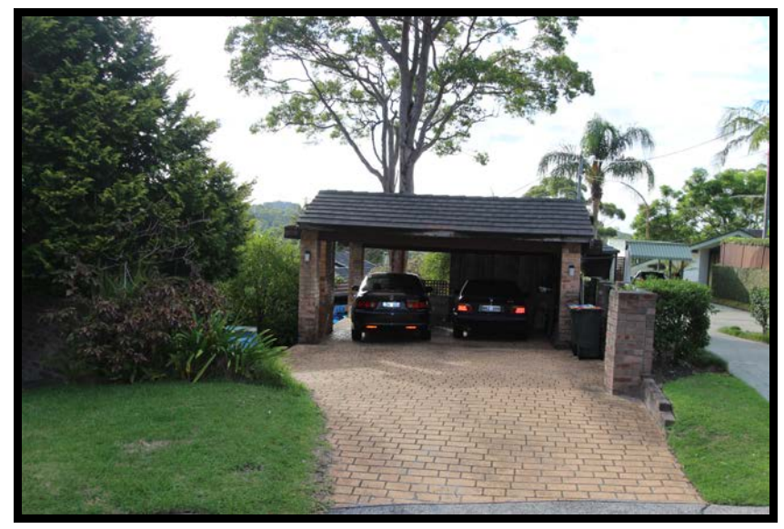
Fig 5: No. 6 Mulawa Place as seen from Mulawa Place (Action plans 2019).

The surrounding area predominantly consists of single or two storeys residential dwellings. The adjoining property to the south, 6 Mulawa Place, is a brick residence with a tiled roof and vehicular access from Mulawa Place. To the north, 4 Mulawa Place, is a double storey brick residence with tiled roof. The property has vehicular access from Mulawa Place.