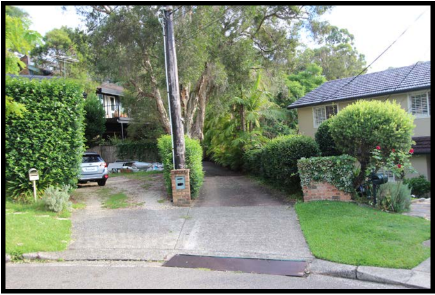
Fig 6: No. 4 Mulawa Place as seen from Mulawa Place (Google maps 2019).