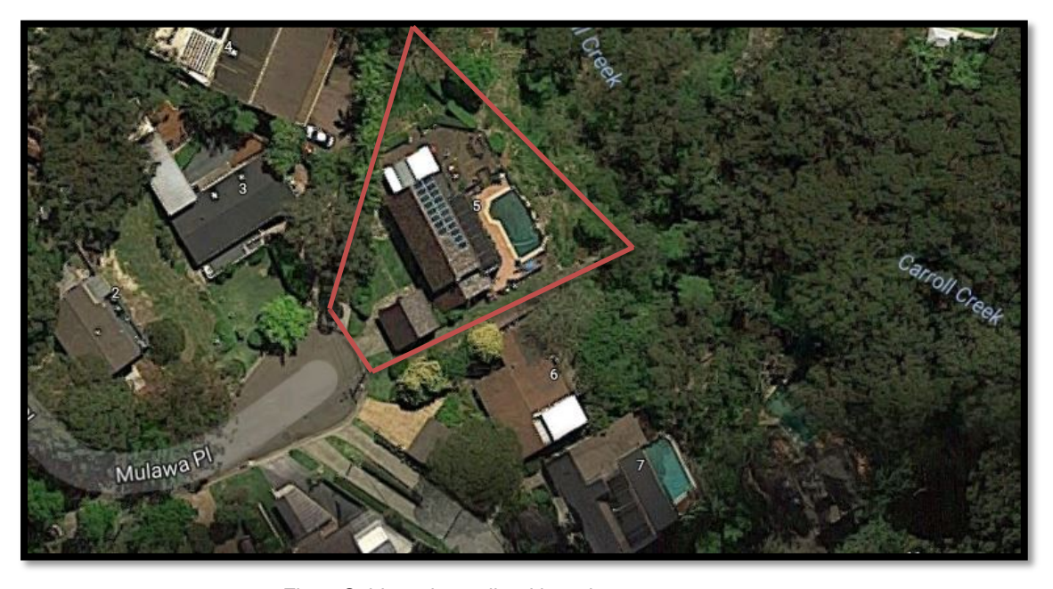
Fig 1: Subject site outlined in red (Google maps 2019).

The site slopes gently from South to North.