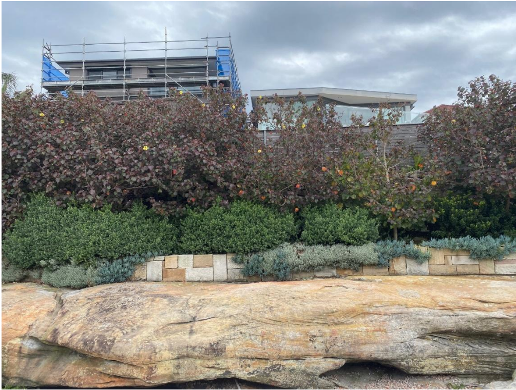
Photograph of the subject site 10 Beverley Place, Curl Curl looking west from the rear of the site