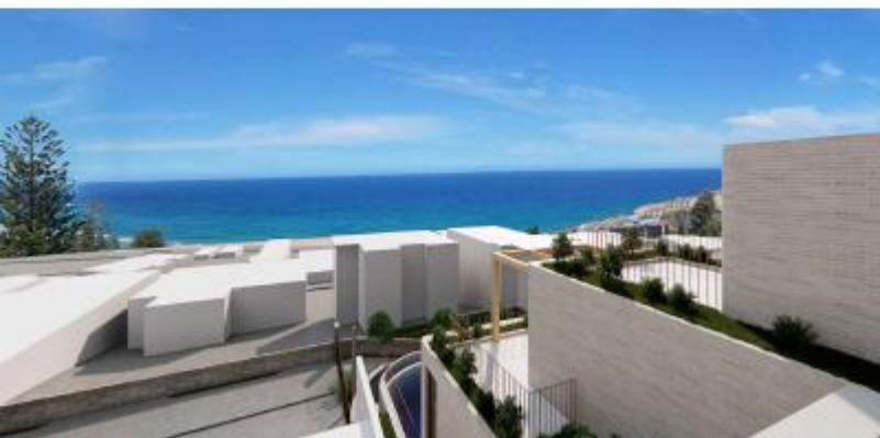
3 | VIEW - No 7

Based on the above view assessments, it is my opinion that there is minimal impact to existing view corridors and reasonable view sharing is provided.