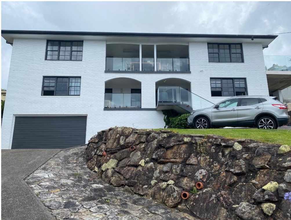
Photograph of the subject site 10 Beverley Place, Curl Curl – note existing 2-3 storey bulk and scale