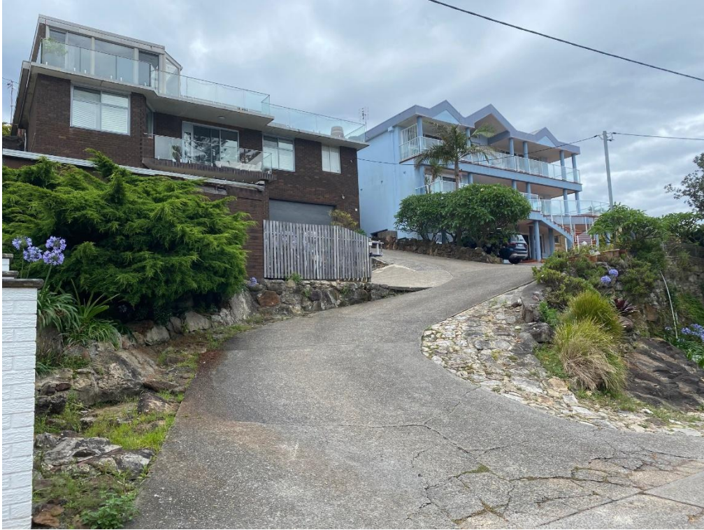
Photograph of adjoining properties to the north – 7 and 5 Beverley Place – note 3 storey bulk and scale