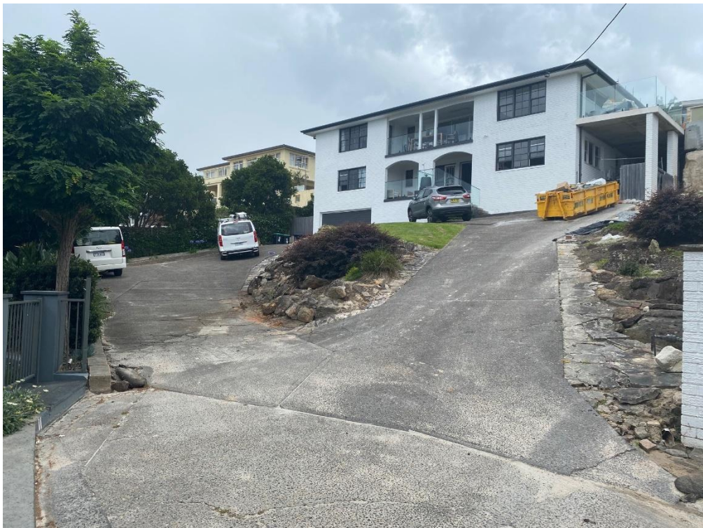
Photograph of the subject site 10 Beverley Place, Curl Curl looking south-west from the access handle – note existing 2-3 storey bulk and scale