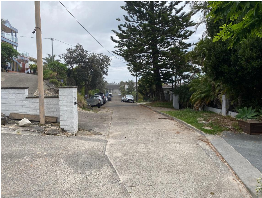
Photograph of the subject site 10 Beverley Place, Curl Curl looking north down the access handle