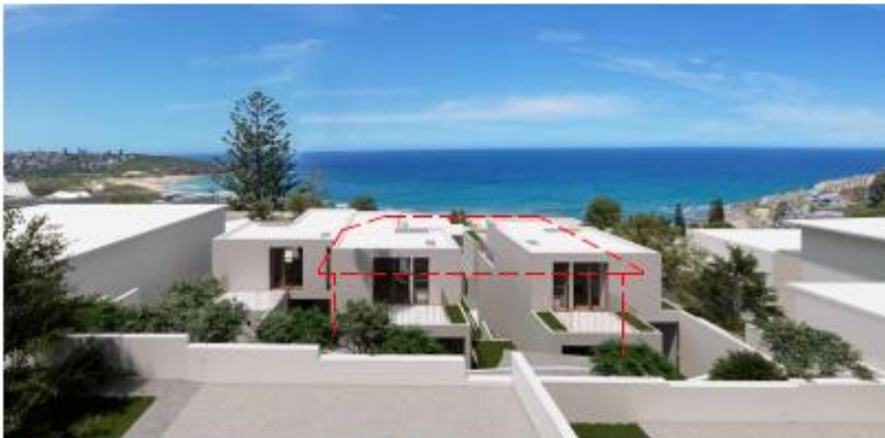
1 | VIEW - No 14 SEAVIEW AVENUE