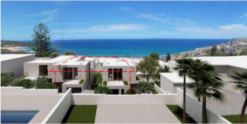
2 | VIEW - No 12 SEAVIEW AVENUE