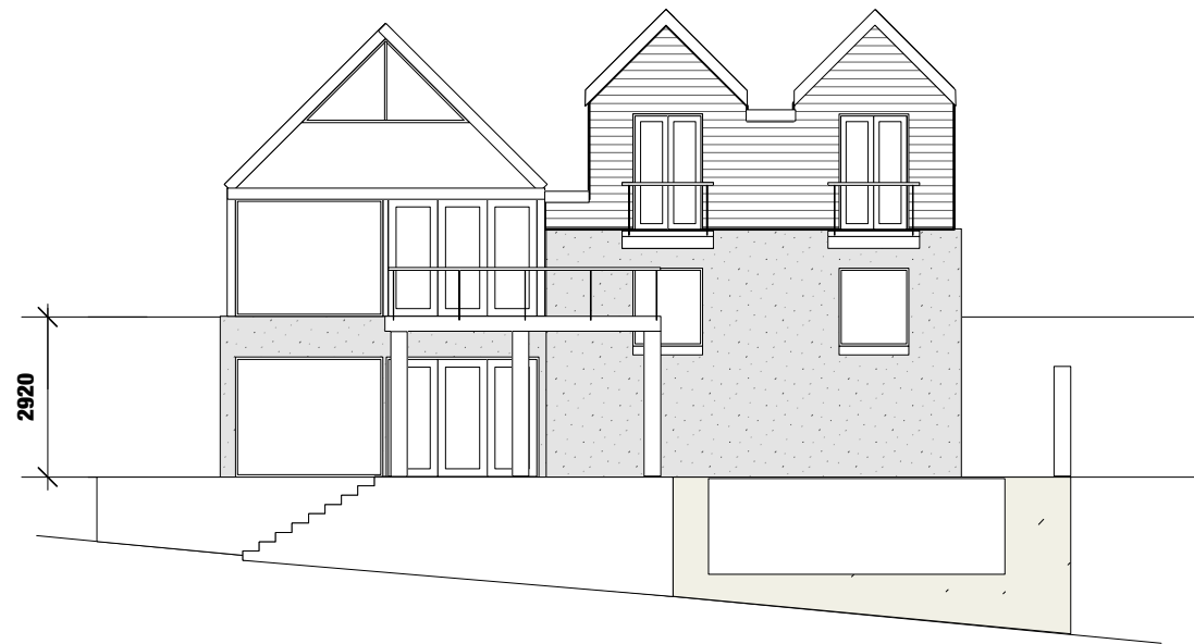
EXISTING ELEVATION 01