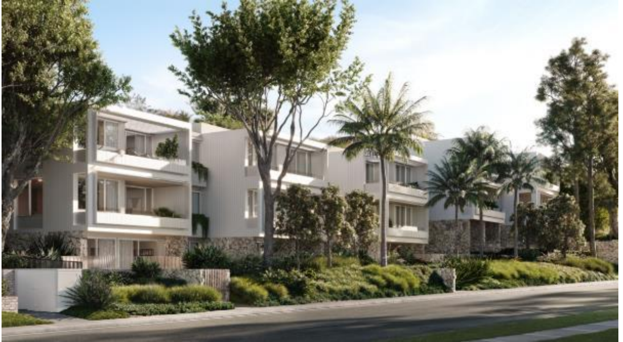
Figure 3 - Photograph montage of proposed development as viewed from Beaconsfield Street confirming that the non-compliant lift overruns will not be readily discernible in a streetscape context with the overall height, bulk and scale consistent with that established by the immediately adjoining residential flat building.

Notwithstanding the building height breaching elements, the resultant development is compatible with the height and scale of surrounding and nearby development and accordingly the proposal achieves this objective.