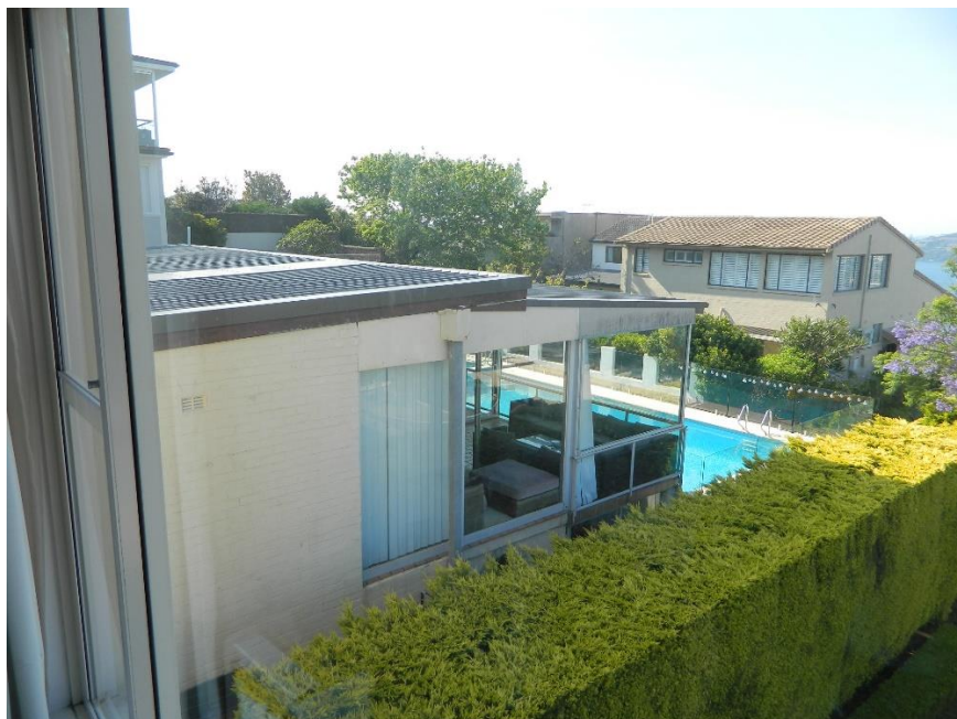
Photograph 1: View from master bedroom of 13 Moore Street to location of proposed terrace and glazing of 11 Moore Street.

Comment: The proposed additions do not orient the west facing glazing and upper level terrace to limit overlooking. Instead they are oriented towards the neighbouring property, as shown in the following photographs: