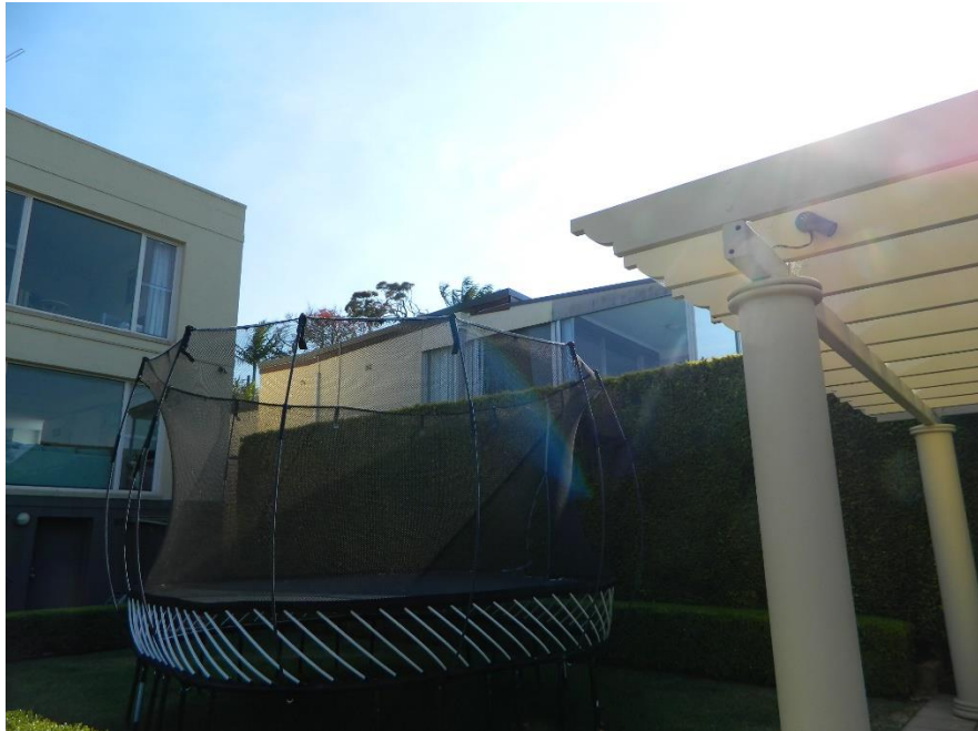
Photograph 1: View from principal private open space of 13 Moore Street to location of proposed terrace and glazing of 11 Moore Street.