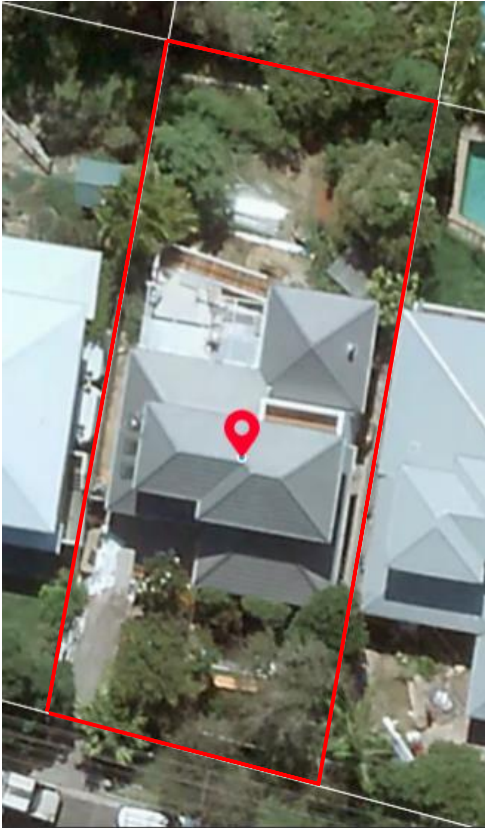
Figure 1: The subject site outlined in red ( metromap 2022 ).