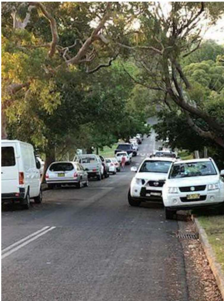
Figure 2- on street parking

Furthermore, myself and other residents of the street have legitimate concerns over the ability of Cooleena Road to support more on-street parking. On-street parking has become limited on the street and made worse during peak periods in the afternoons and evenings with people returning home. Images of the on-street parking situation are provided below.