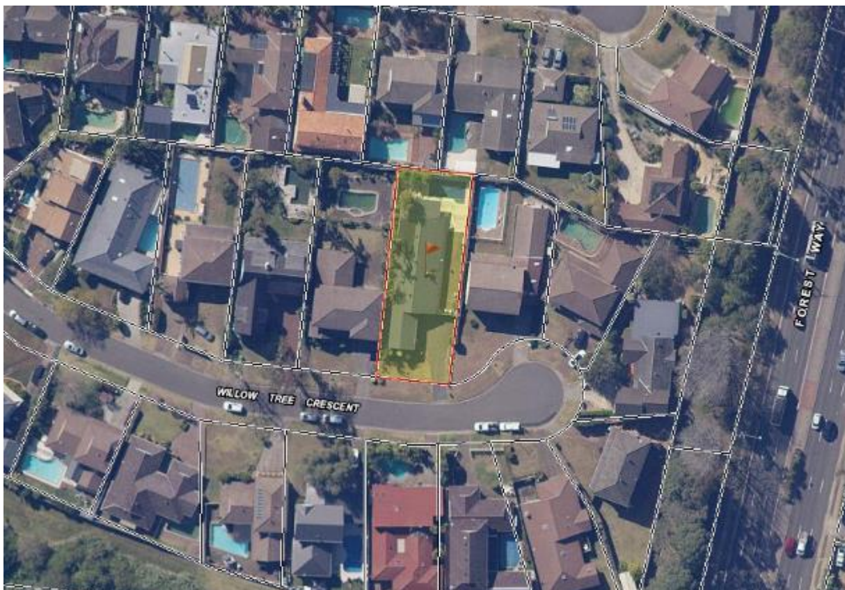
Aerial Photograph of Locality