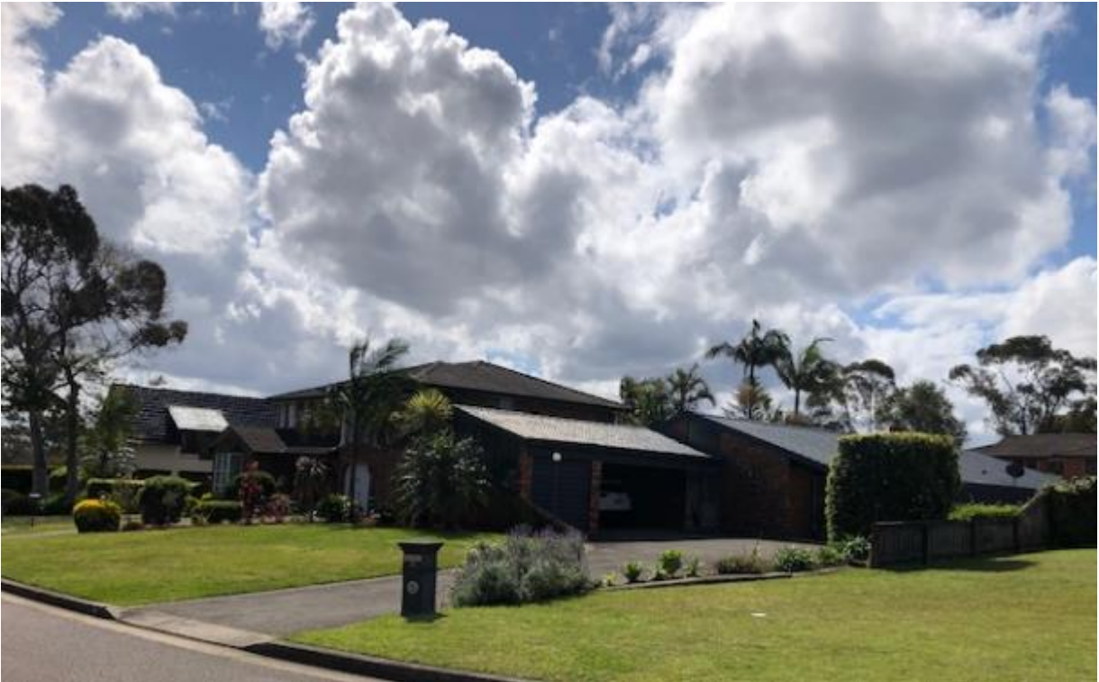
View of Subject Site from Willow Tree Crescent

The existing surrounding development comprises a mix of one and two storey detached residential dwellings on generally larger sized allotments to the subject site, interspersed with some residential flat buildings. More recent development comprises larger two storey dwellings of modern appearance.