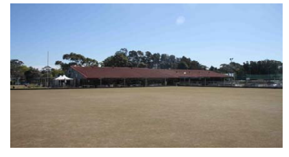
Ex. Club Building viewed from Stirgess Ave