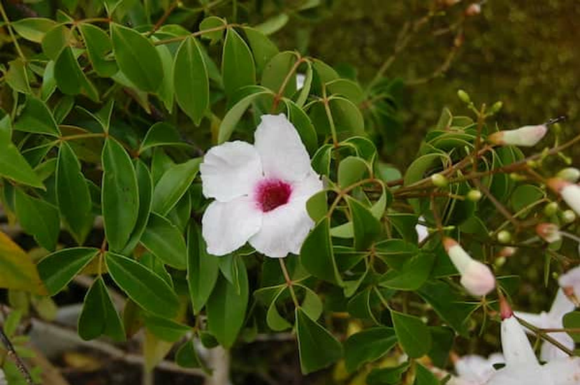
PANDOREA JASMINOIDES (BOWER VINE)

Do not scale from plans. All dimensions and levels shown on plan are subject to confirmation on site.