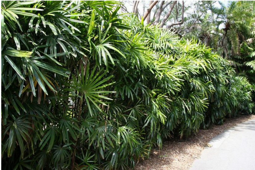
RHAPIS EXCELSA (LADY FINGER)