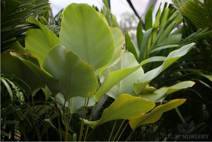
CALATHEA LUTEA (CIGAR PLANT)