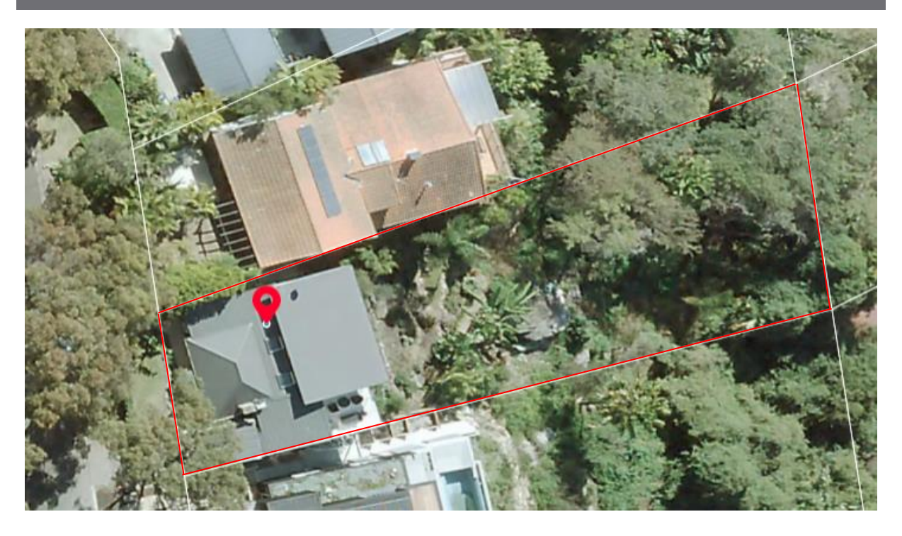
Figure 1: The subject site outlined in red (metromap 2022).