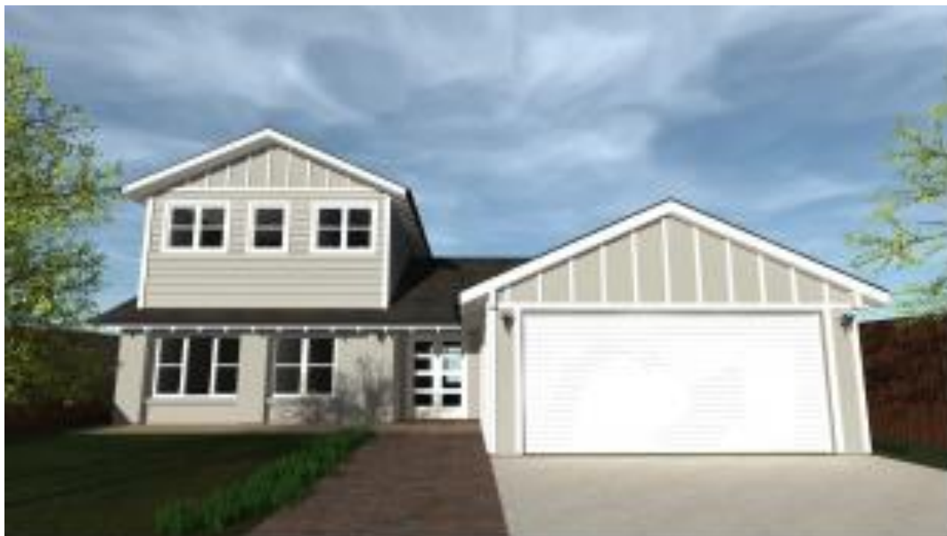
Proposed Streetscape elevation