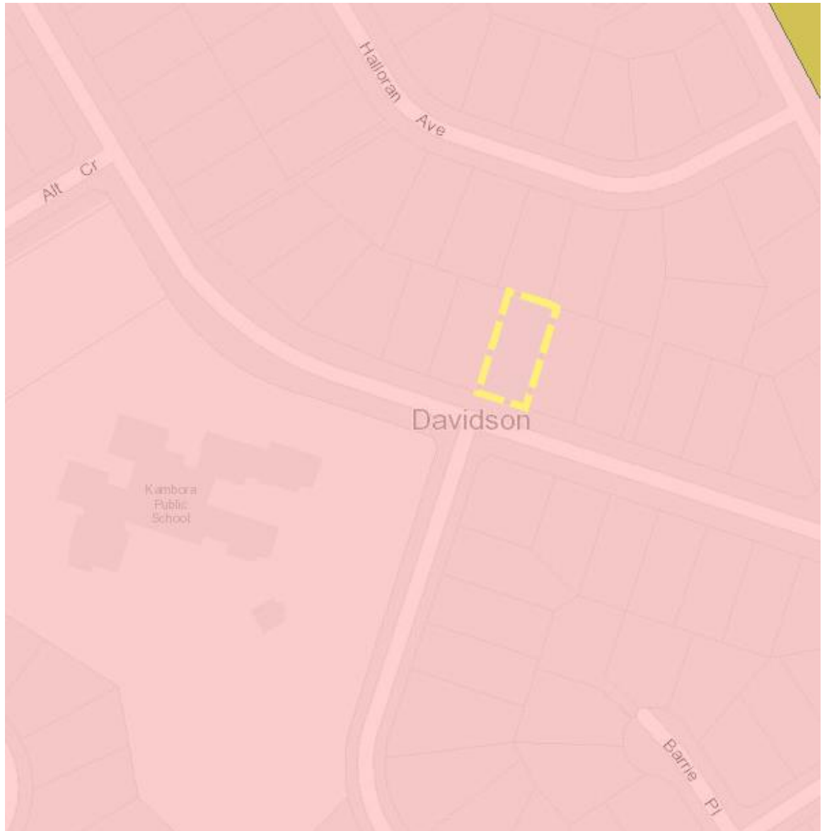
Land Zoning Extract – R2 Low Density Residential

The subject land is zoned R2 Low Density Residential pursuant to Warringah LEP 2011.