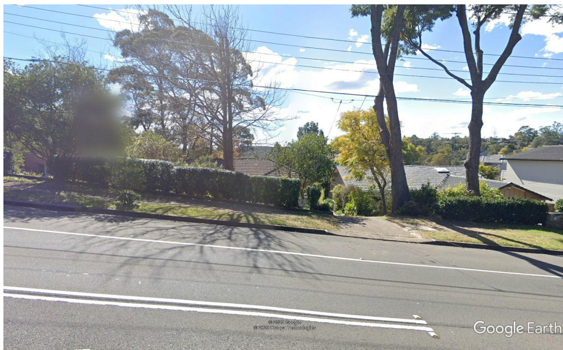
View of the adjoining western property