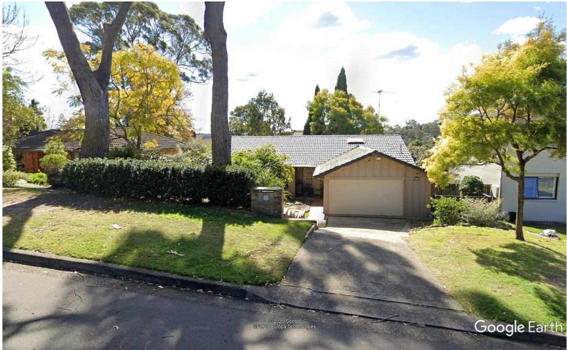
View from the street

The building is not listed under the Warringah Local Environmental Plan 2011 as having any heritage significance nor is it in the immediate vicinity of any items of heritage significance.