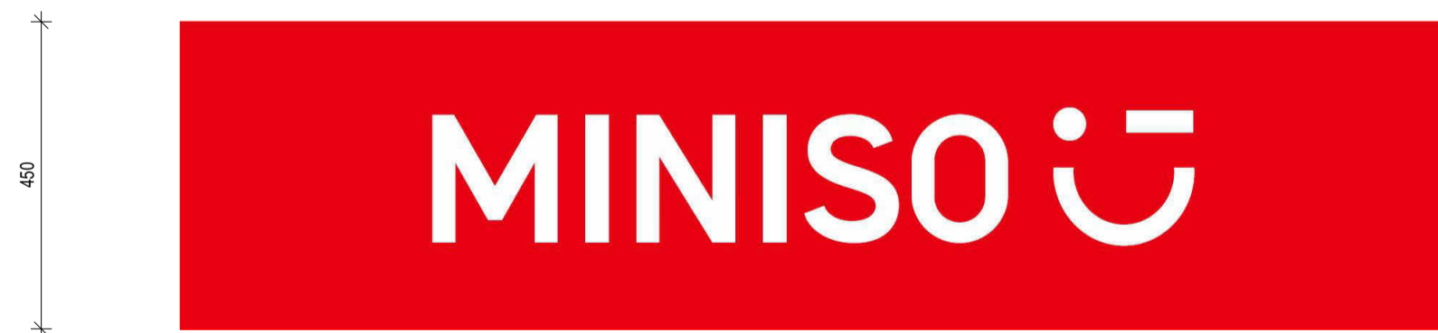
4 Drafting View Signage 2 - Miniso 1:10