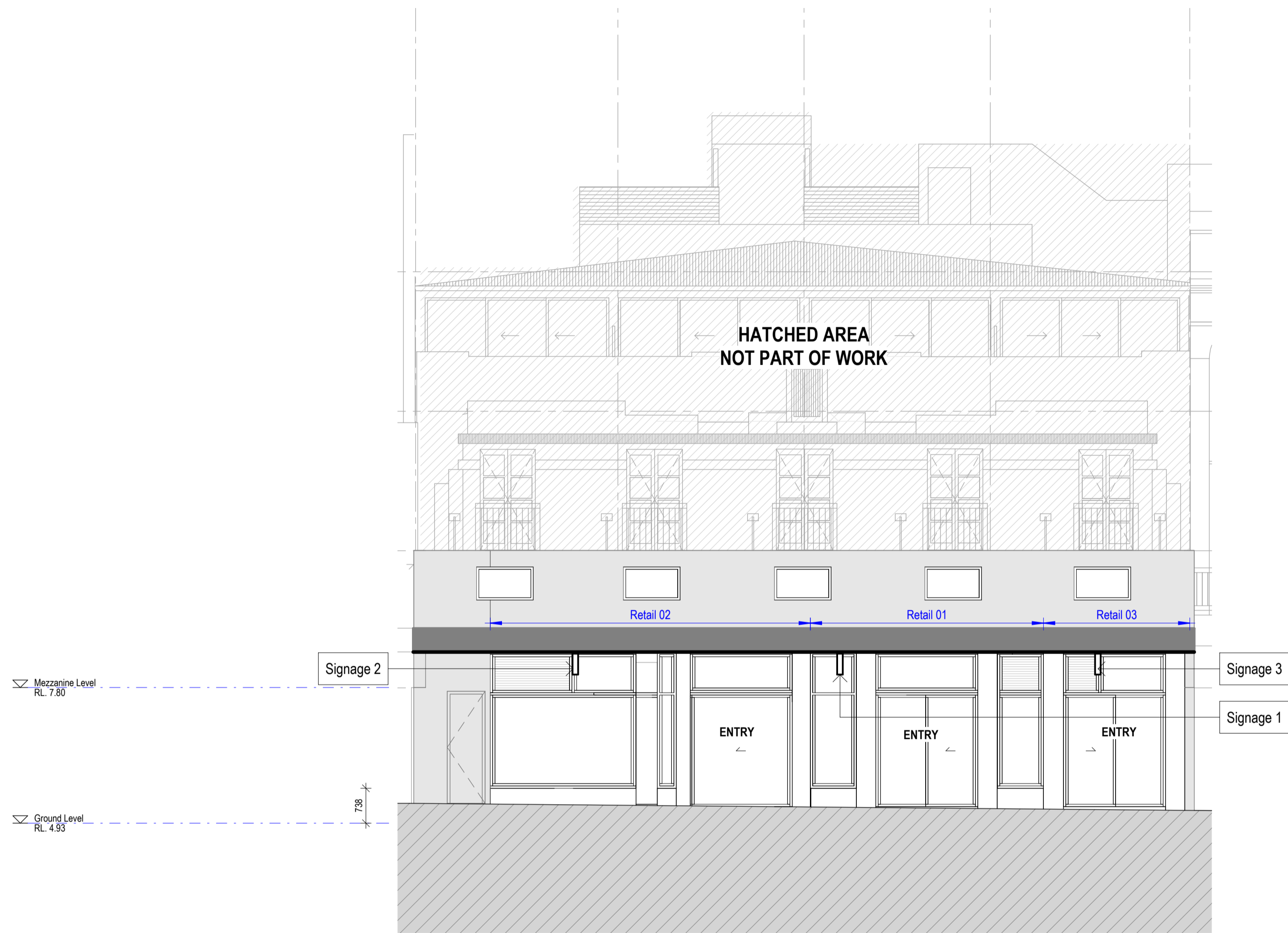
1 Elevation Elevation - Under Awning Signage 1:75