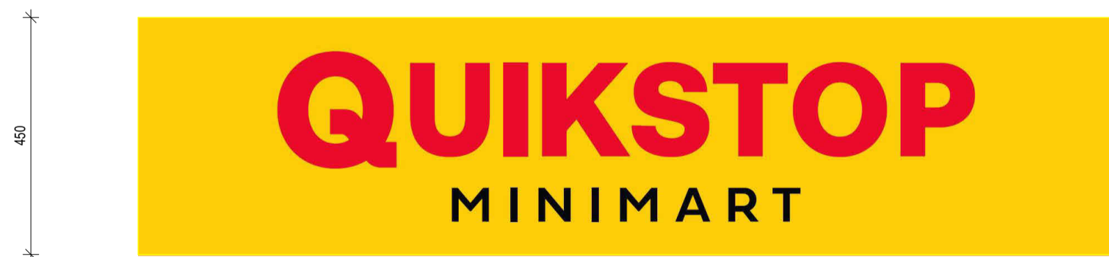
3 Drafting View Signage 1 - Quikstop 1:10