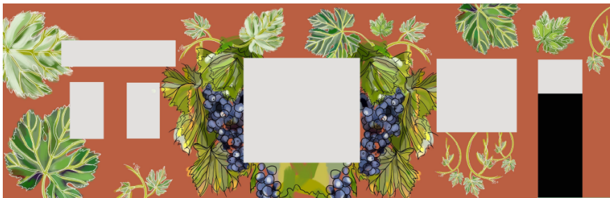
EXTERNAL MURAL CONCEPT DESIGN