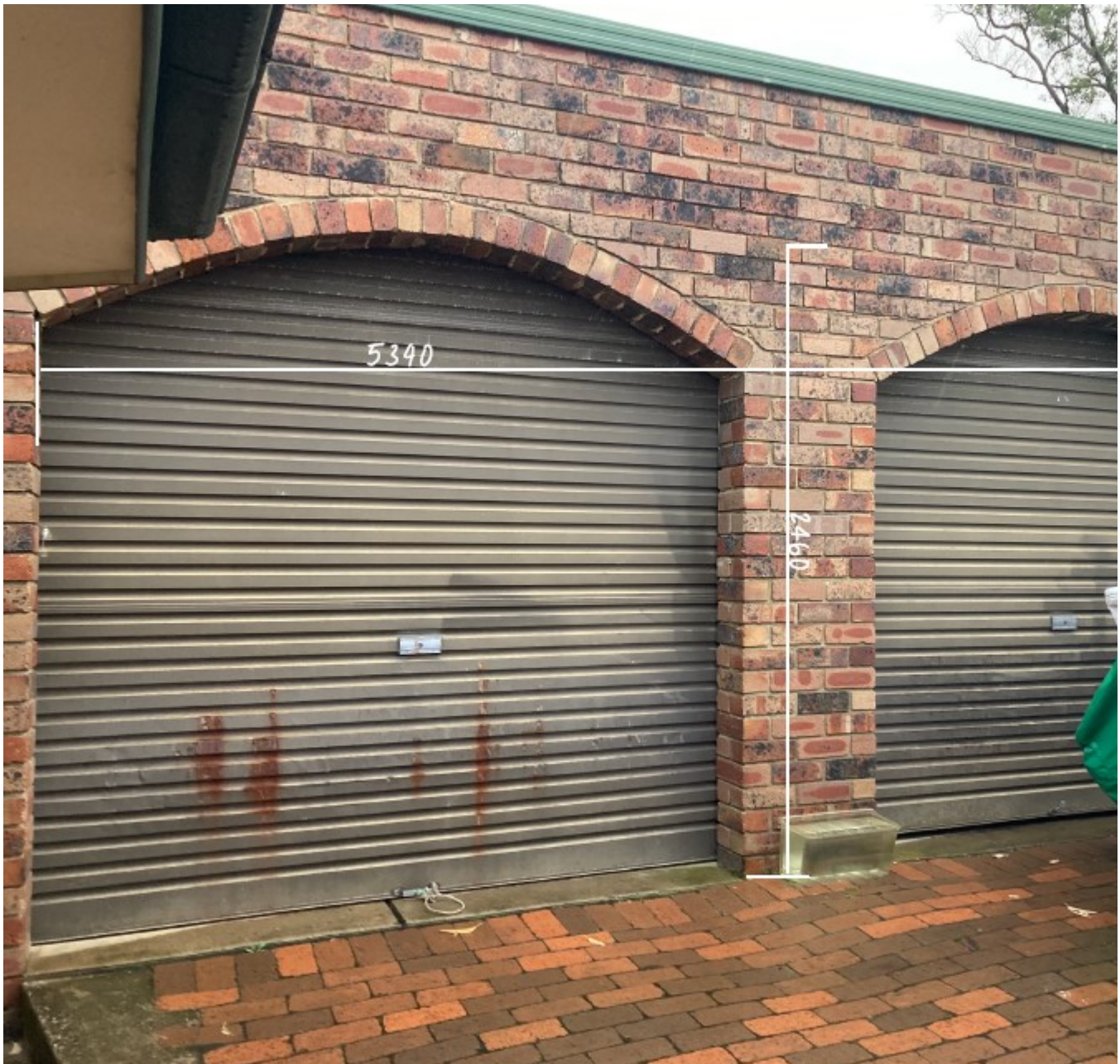
Figure 2 - Existing Garage