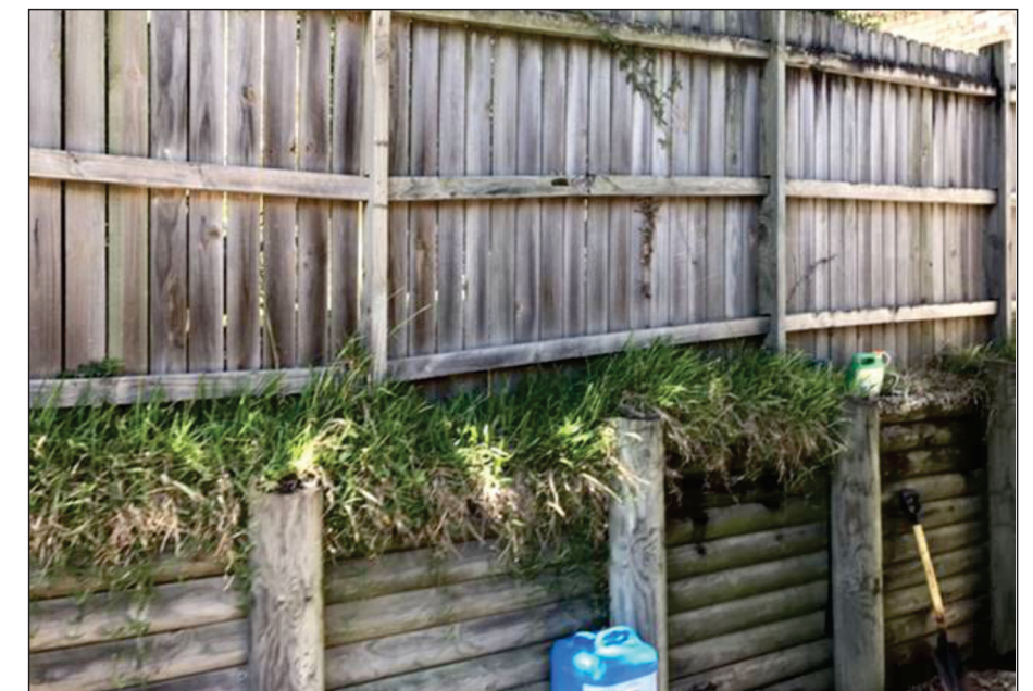
Current view from side of No. 13 Kuyora Place