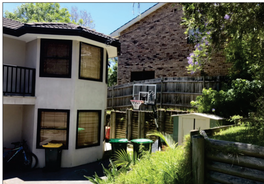
Current view from rear of No. 13 Kuyora Place