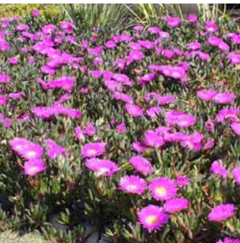
Carpobrotus glaucescens 'Aussie Rambler'