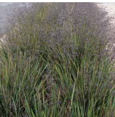
Dianella 'Little Rev'