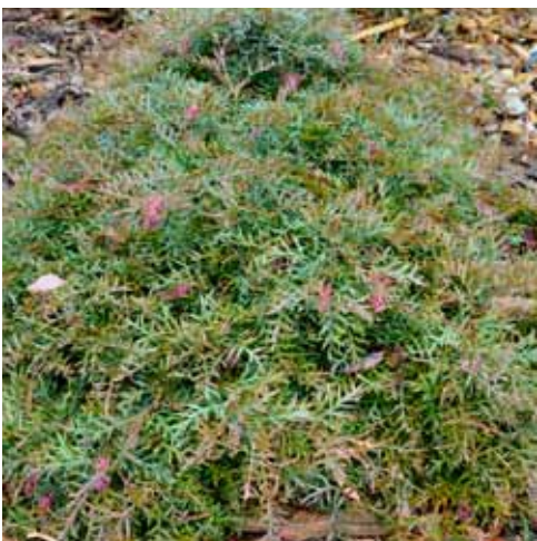
Grevillea 'Bronze Rambler'