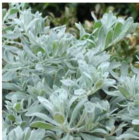
Eremophila glabra prostrate 'Blue Hoizon'