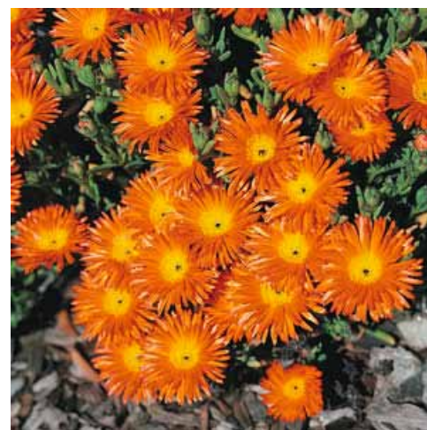
Mesembryanthemum 'Pig Face Orange'