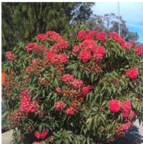
Corymbia ficifolia 'Summer Red'