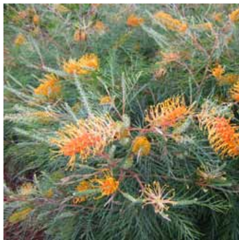
Grevillea 'Honey Gem'