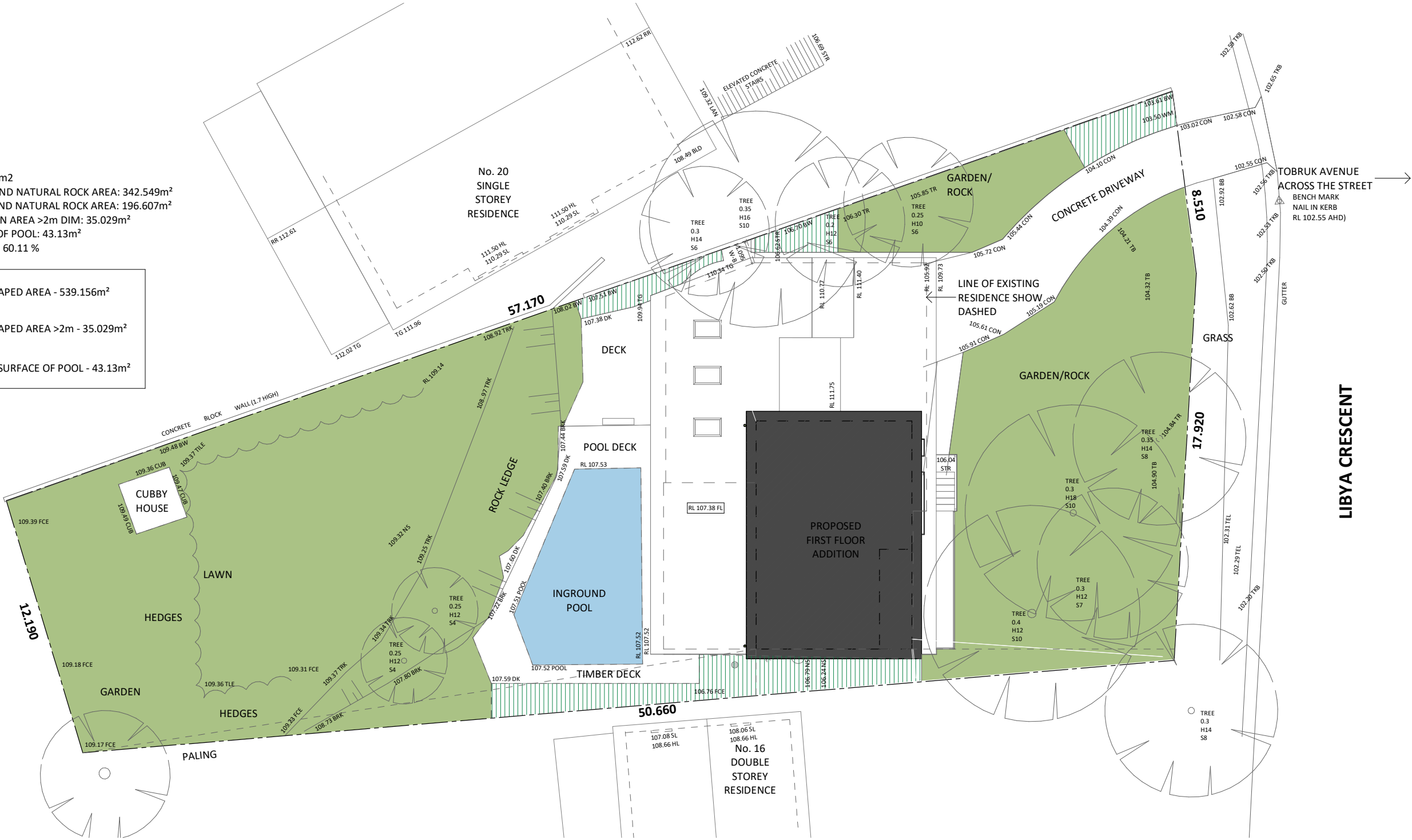
LANDSCAPE OPEN SPACE PLAN & CALCULATION 1 : 200