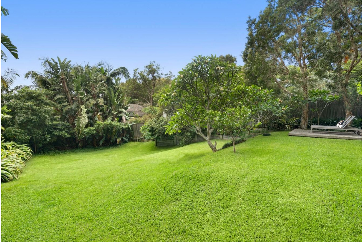
VIEW LOOKING TOWARDS THE NORTH EAST CORNER AND THE EASTERN SIDE BOUNDARY. THE MEDIUM FLOOD IS LOCATED TOWARDS THE REAR OF THE SITE IN THIS AREA