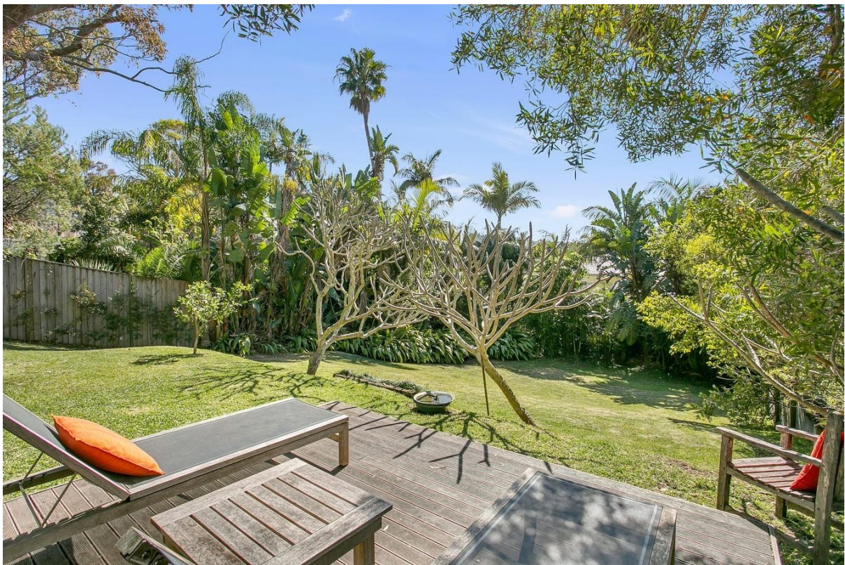
VIEW LOOKING TOWARDS THE NORTH WEST CORNER AND THE WESTERN SIDE BOUNDARY