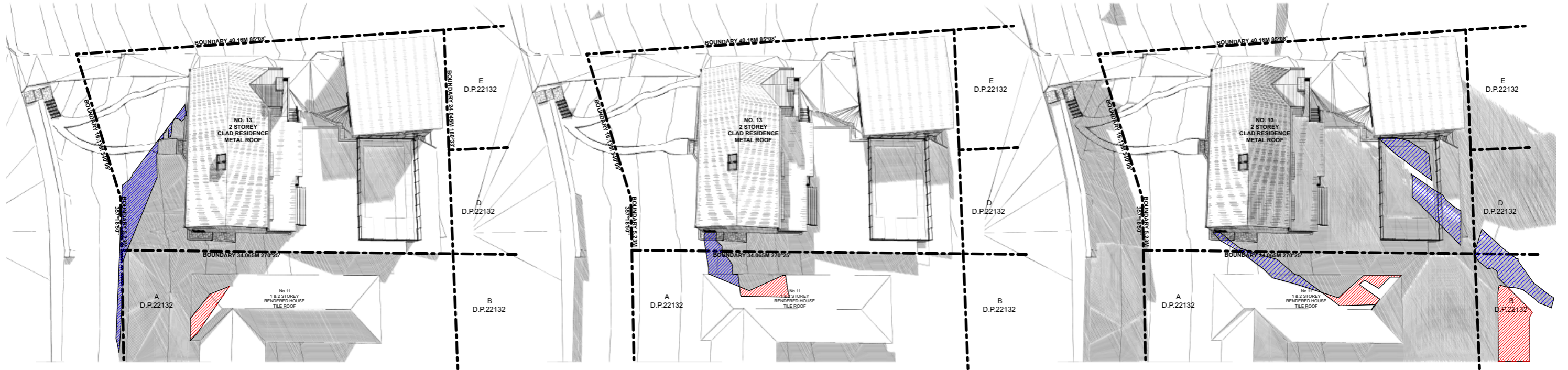
21st JUNE-9AM SHADOW DIAGRAMS (No change to roof line and shadowing of Secondary Dwelling)