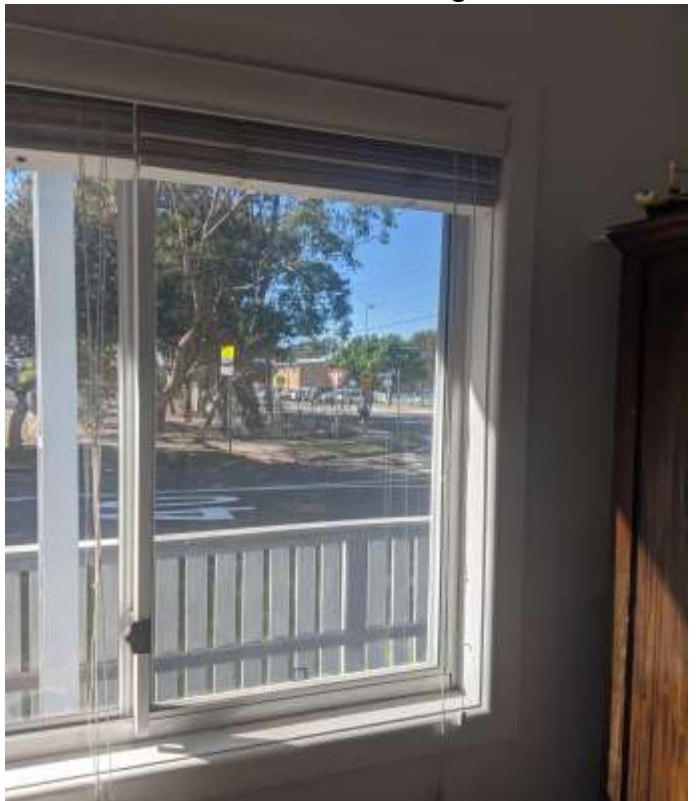
4. View from upstairs lounge room