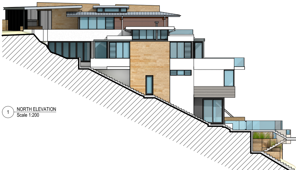
1 NORTH ELEVATION Scale 1:200