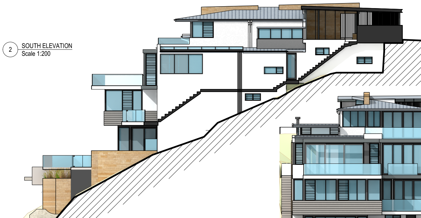
2 SOUTH ELEVATION Scale 1:200