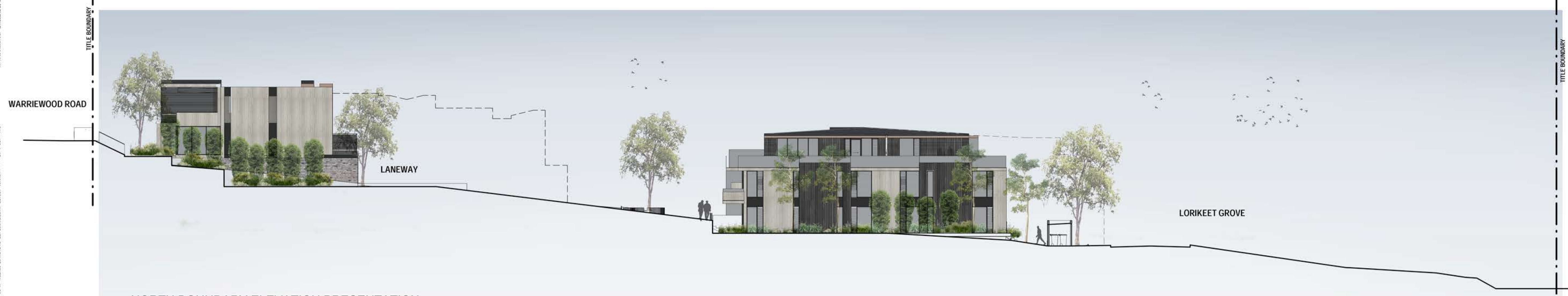
NORTH BOUNDARY ELEVATION PRESENTATION

PLAN DATE: 05/28/2020 10:00 AM DRAWING NO: NP-002