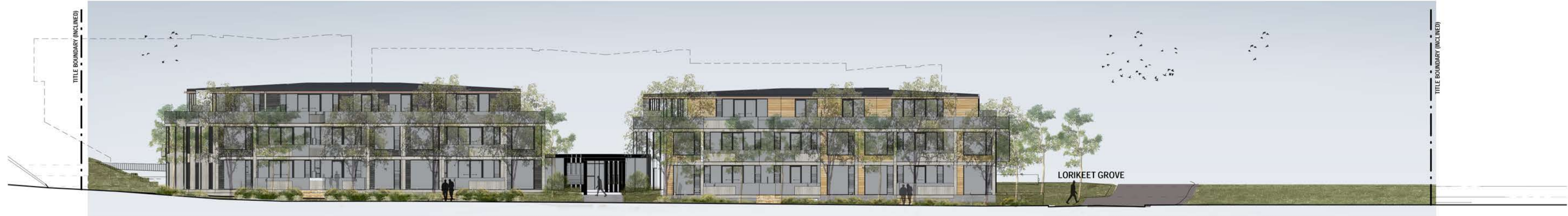
WEST BOUNDARY ELEVATION PRESENTATION