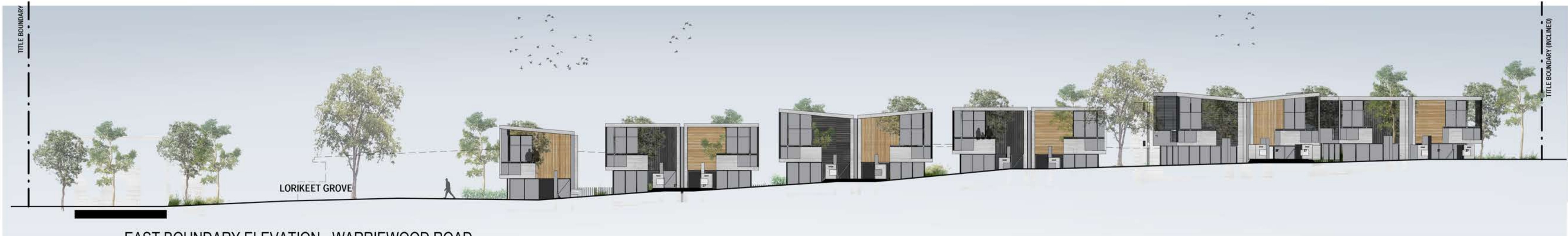
EAST BOUNDARY ELEVATION - WARRIEWOOD ROAD PRESENTATION