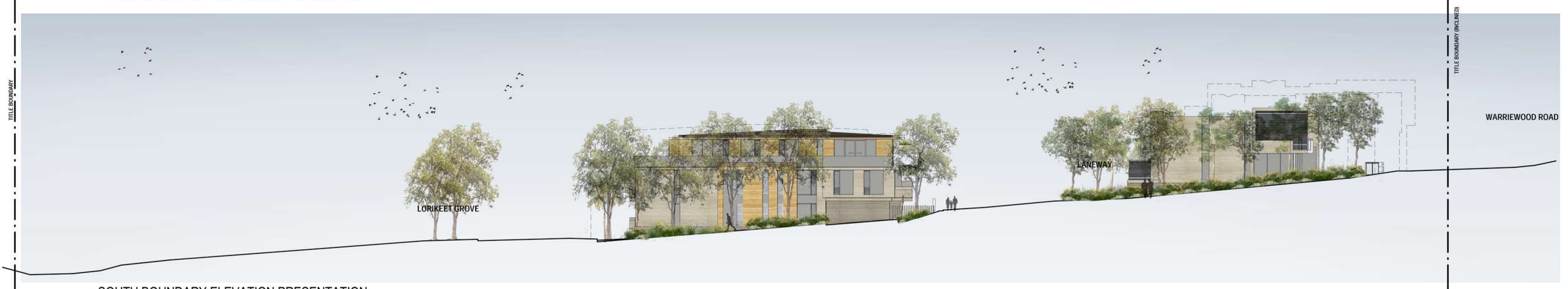
SOUTH BOUNDARY ELEVATION PRESENTATION