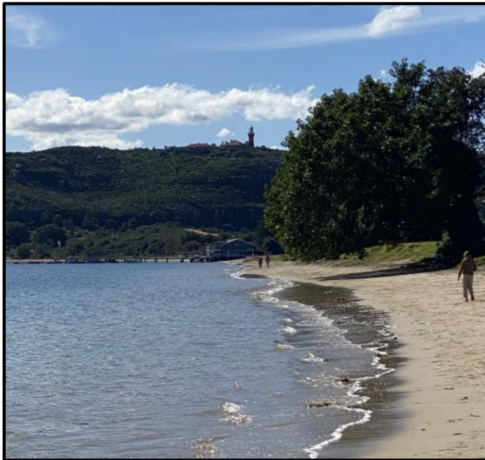
VIEW TOWARDS BARRENJOEY HEADLAND FROM STATION BEACH SOUTH OF EXISTING BOATHOUSE

(d) to allow for the reasonable sharing of views,