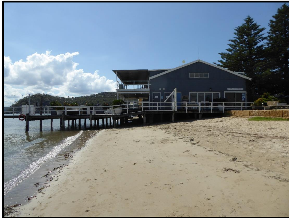
EXISTING BUILDING VIEWED FROM THE SOUTH