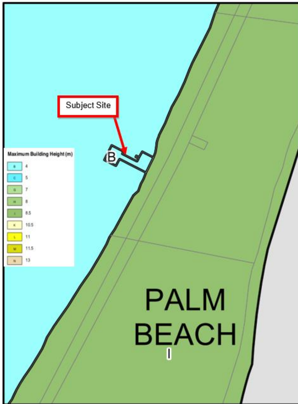
EXTRACT FROM PITTWATER LOCAL ENVIRONMENTAL PLAN 2014 – HEIGHT OF BUILDINGS MAP PRESCRIBING A 4M MAXIMUM BUILDING HEIGHT