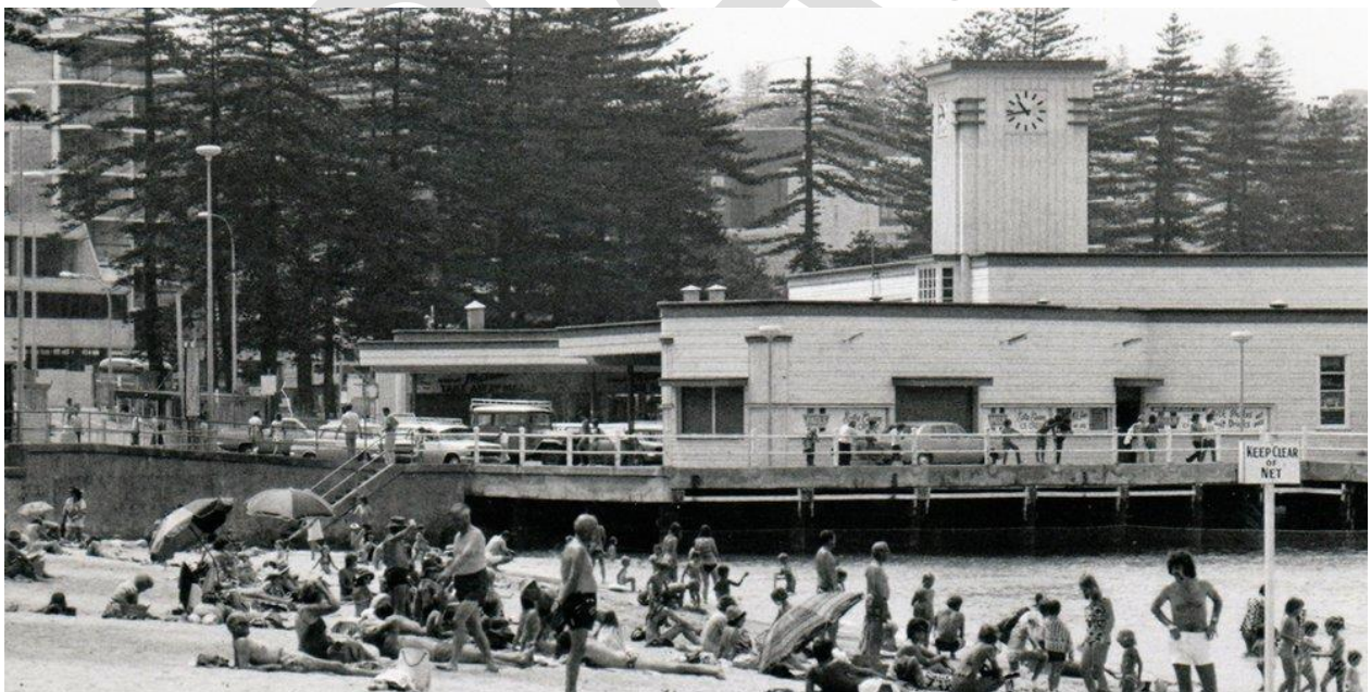
Figure 2: Photograph of Manly Wharf from the 1970s. Visible in the centre is the wharf balustrade, which is different to the existing.