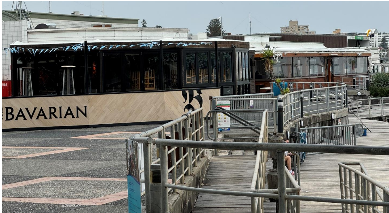
Figure 5: Current view of western balustrade, which is different to that visible in 1951, 1970s and 1980s photographs.

The replacement of the non-original balustrade with a steel-framed glazed balustrade will be of similar to that existing along the Hugos Manly (Figure 6), which appears as being three horizontal railing with glass inserts rather than just a frameless glass balustrade. As seen from the clientele perspective of Hugos Manly, the retractable steel-framed glass balustrade will provide benefit to the community while also establishing a uniform appearance across both sides of the wharf. This existing Hugos Manly tenancy on the western deck of the wharf were recently approved by both Northern Beaches Council and Heritage NSW via DA2020/602 to alter the existing metal balustrade to a retractable glazed balustrade. This balustrade compliments the form and scale of the original wharf as it is transparent and maintains views to and from the wharf while providing protection from wind and similar 'ship' railing appearance to the existing (see drawing sheet DA.105 - rev 5).