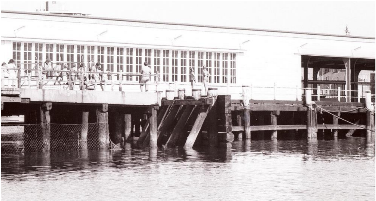
Figure 3: Photograph of the wharf in the 1980s (prior to retail addition to wharf), showing different timber balustrade.