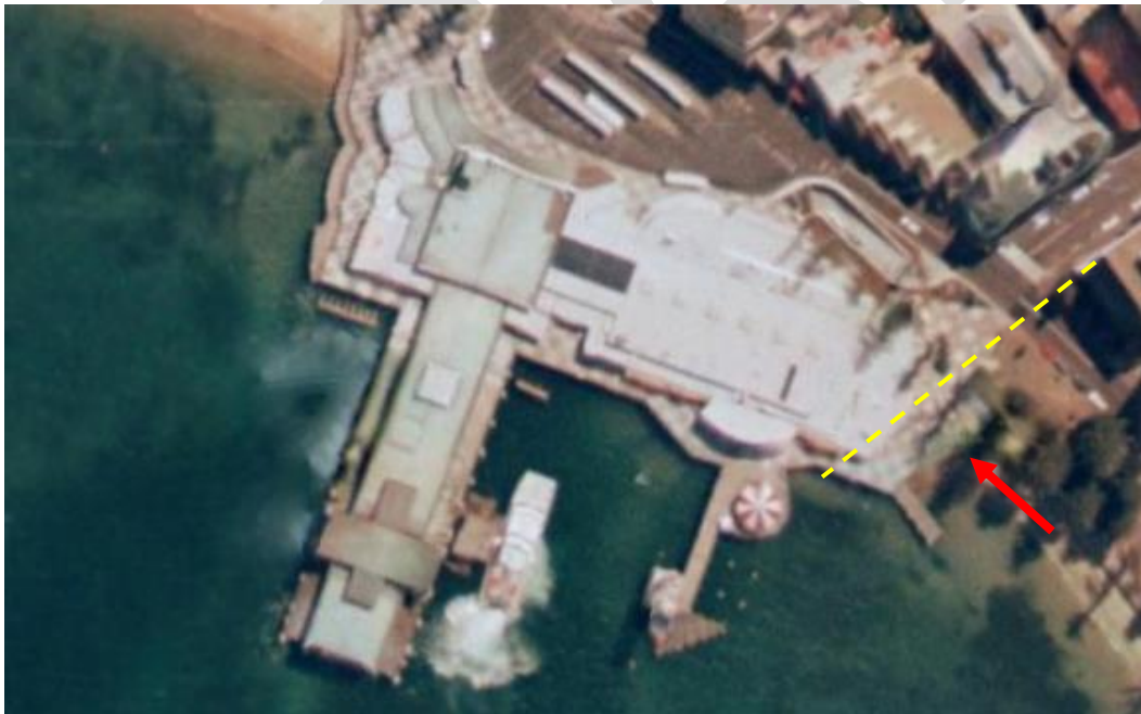
Figure 10: Aerial image from 1991 showing the location of the amphitheatre (indicated in red, with yellow dash used as point of reference).