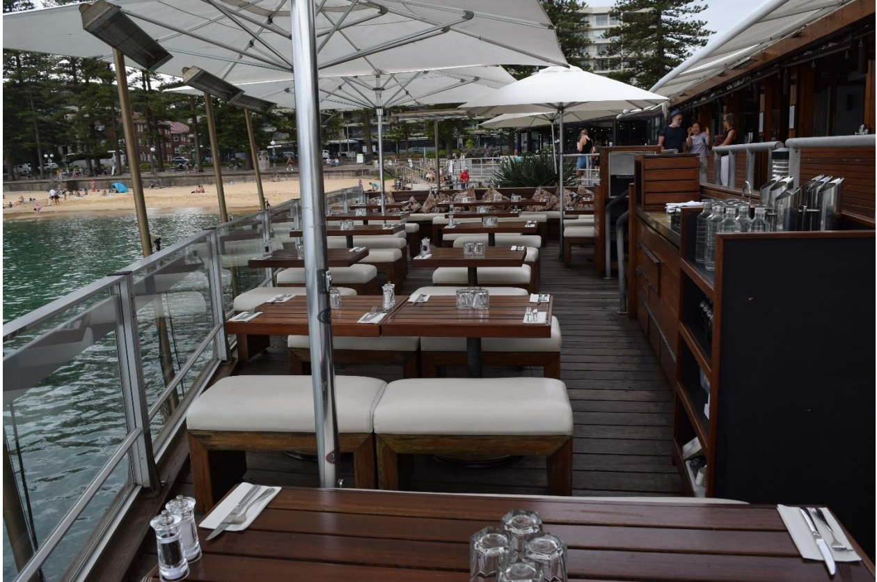
Figure 6: Photo of Hugos Manly showing steel framed balustrade with glazed inserts. This retains the "ship-like" railing when viewed from a distance.