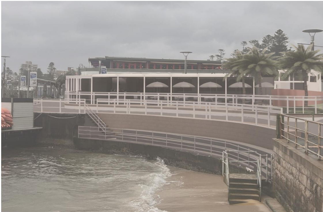
Figure 8: Render showing the proposed alterations to the amphitheatre.

This amphitheatre is not an original or significant element within the 'Manly Wharf' heritage item (item I145 and SHR# 01434) as it is a contemporary addition that came alongside the alterations to the wharf in 1990 to establish the eastern retail wing. This is confirmed in the comparison of historical aerial imagery of the site from 1986 and 1991 (Figure 9 and Figure 10). As such, the proposed partial infill will have no physical or visual impact on the heritage item. Likewise, the removal of the existing security fencing that exists around this amphitheatre (which is different to the ship like metal balustrade of the wharf) and replacement with the proposed operable glazed balustrade will further establish a consistent and uniform visual appearance around the wharf to match that currently existing at Hugo's Manly (approved under DA2020/602).