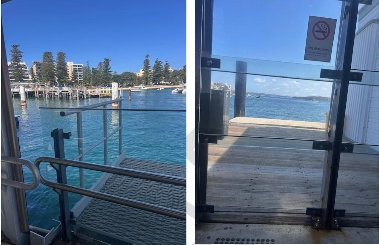
Figure 7: Views of glazed balustrade within the Manly Wharf ferry terminal (an area of 'Medium' heritage significance as identified in the 2016 CMP).