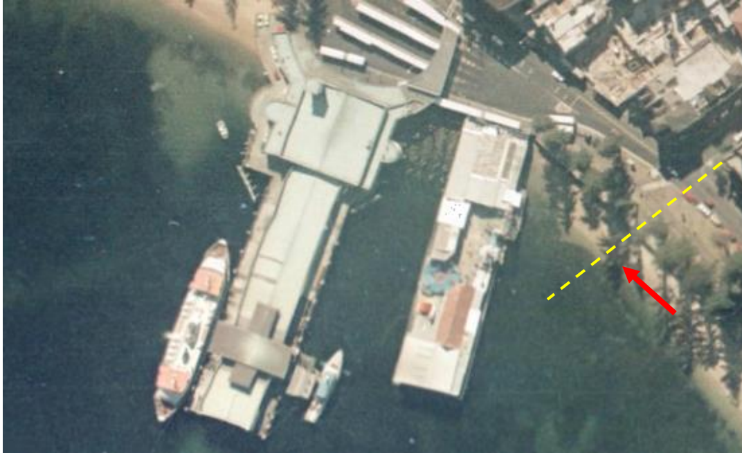
Figure 9: Aerial image of Manly Wharf from 1986, showing no amphitheatre prior to the 1990 addition of the retail wing (indicated in red, with yellow dash used as point of reference).