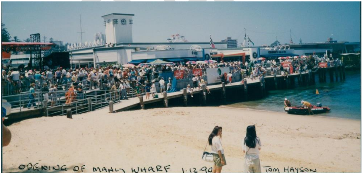
Figure 4: 1990 photograph at the opening of the Manly Wharf following the construction of the retail addition. Visible is the metal balustrade which currently exists on site.