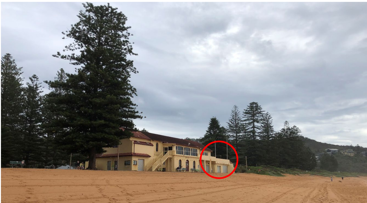
Figure 5 Location 7 View from Newport Beach opposite Bert Payne Park with the location of the new extension circled in red.