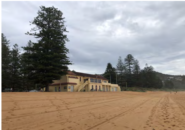
7. View from Newport Beach opposite Bert Payne Park.