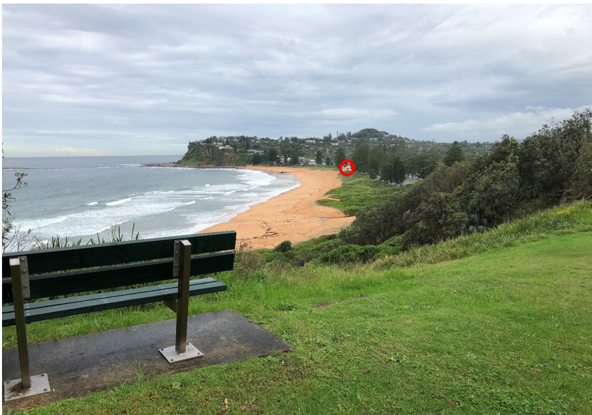
Figure 1 View from Eric Green Public Reserve with location of Newport SLSC identified in red.