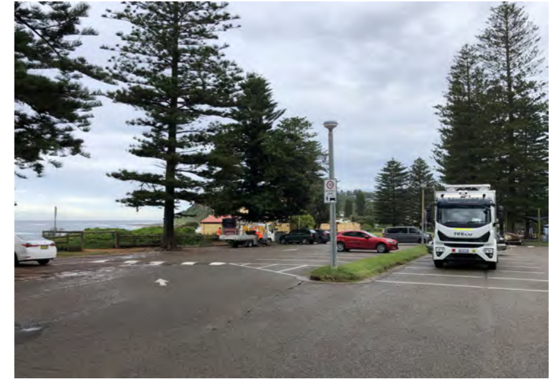
3. View from carpark towards SLSC building.