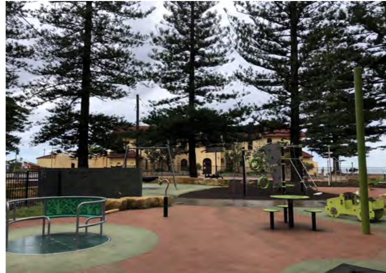
5. View from existing childrens playground area.