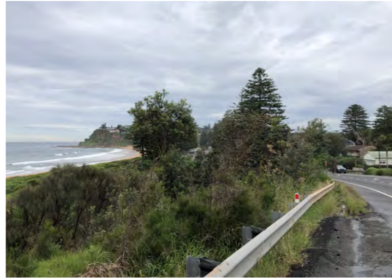
2. View looking south along Barrenjoey Road near Bourke Street.