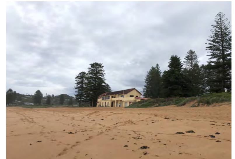
9. View from beach looking south towards Newport SLSC.