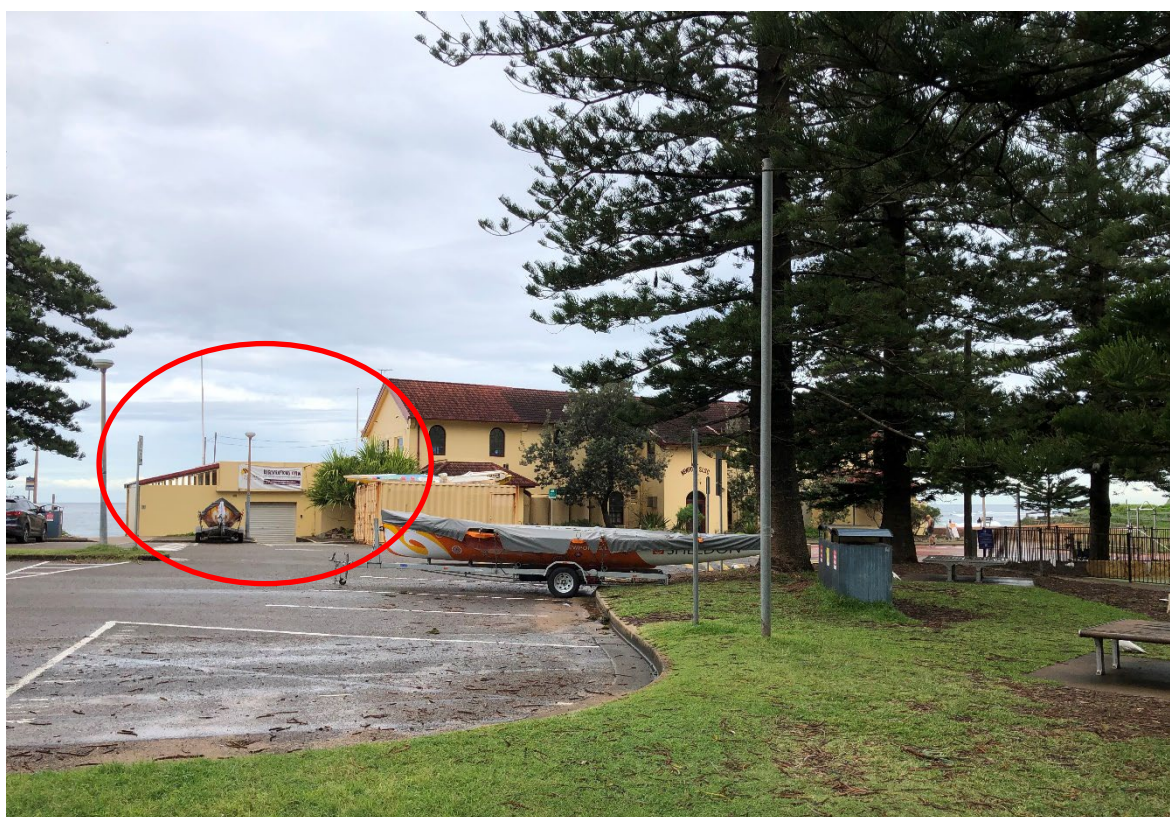
Figure 3 Location 4 from southern end of carpark with location of the new extension identified by a red circle. Removal of the shipping container will improve views of the Newport SLSC. The new addition does not obscure any public domain views towards Newport Beach