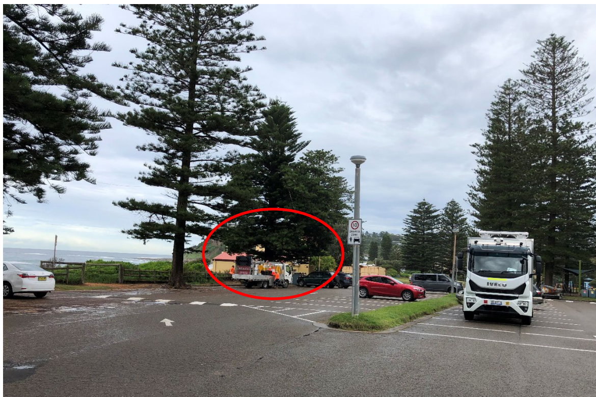
Figure 2 Location 3 from Newport Beach Carpark with location of the new extension identified by a red circle