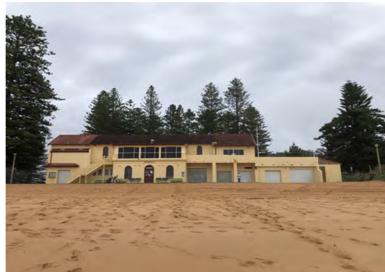
8. View from beach towards Newport SLSC.