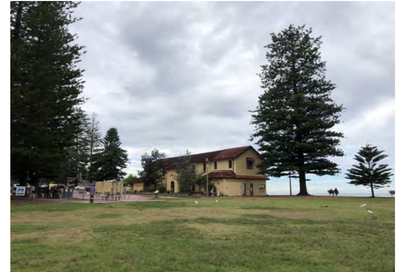
6. View from Bert Payne Park.