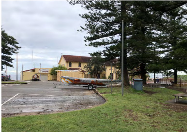
4. View from southern end of carpark.