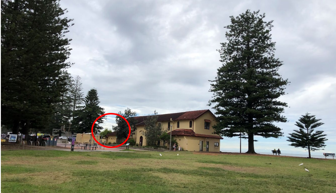
Figure 4 Location 6 View from Bert Payne Park with the location of the new extension circled in red