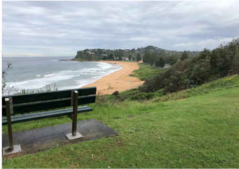
1. View looking south from Eric Green Public Reserve.