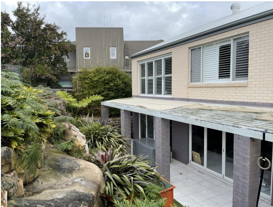
Figure 6. The property frontage and location of proposed garage and carport, looking north west.