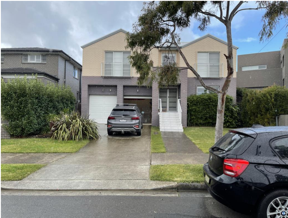
Figure 4. The existing dwelling viewed from Acacia Road