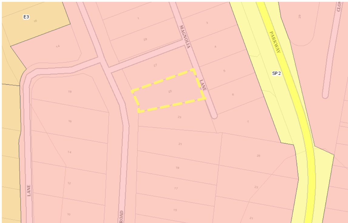
Figure 8. Extract from Manly LEP 2013 zoning map

The site is zoned R2 Low Density Residential, pursuant to the provisions of the Manly Local Environmental Plan 2013 and dwellings are permitted with development consent in Zone R2.