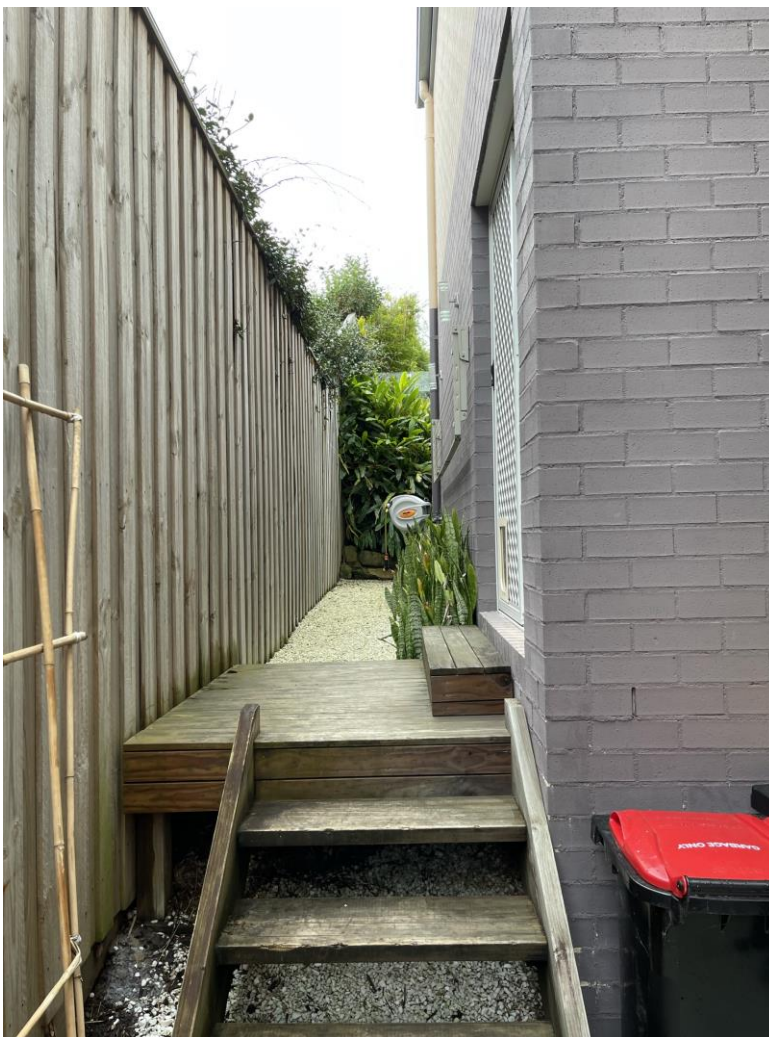
Figure 7. The Northern side boundary, looking East.