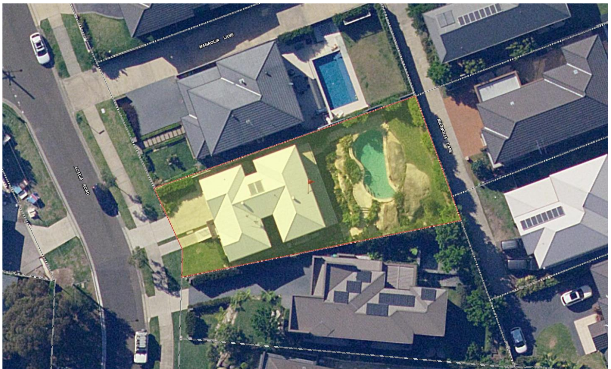
Figure 1. The site and its immediate surrounds