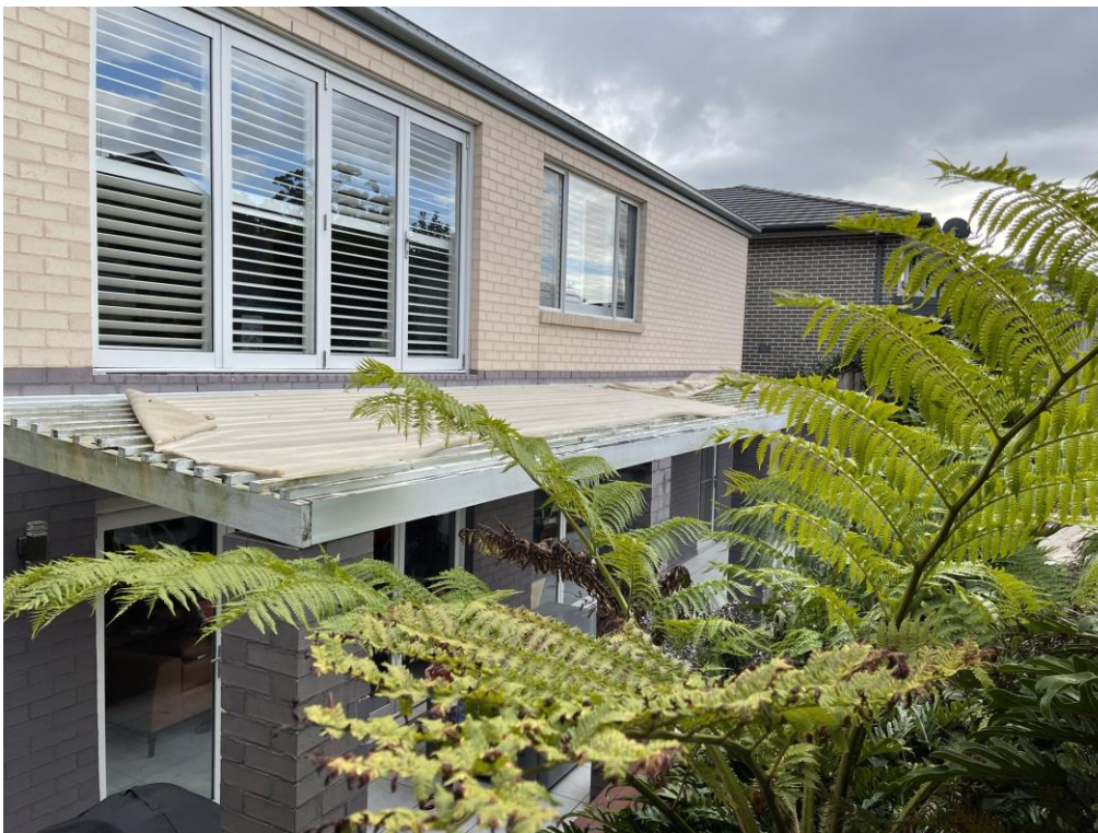
Figure 5. Rear of existing dwelling viewed from pool level