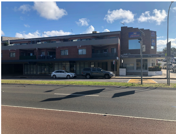
307-319 Condamine Street

The development further to the south (307-317) uses a compliant design, which steps the height over the incline so its not imposing from Condamine Street and remains 3 storeys as the building inclines. REV2021/0014 is 4 storeys at the front to the back so will be over-scaled to buildings on the southern boundary which is a maximum height of 3 storeys (images below):