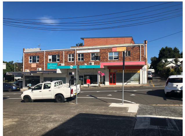
View from Sunshine St (3 storey max neighbours)