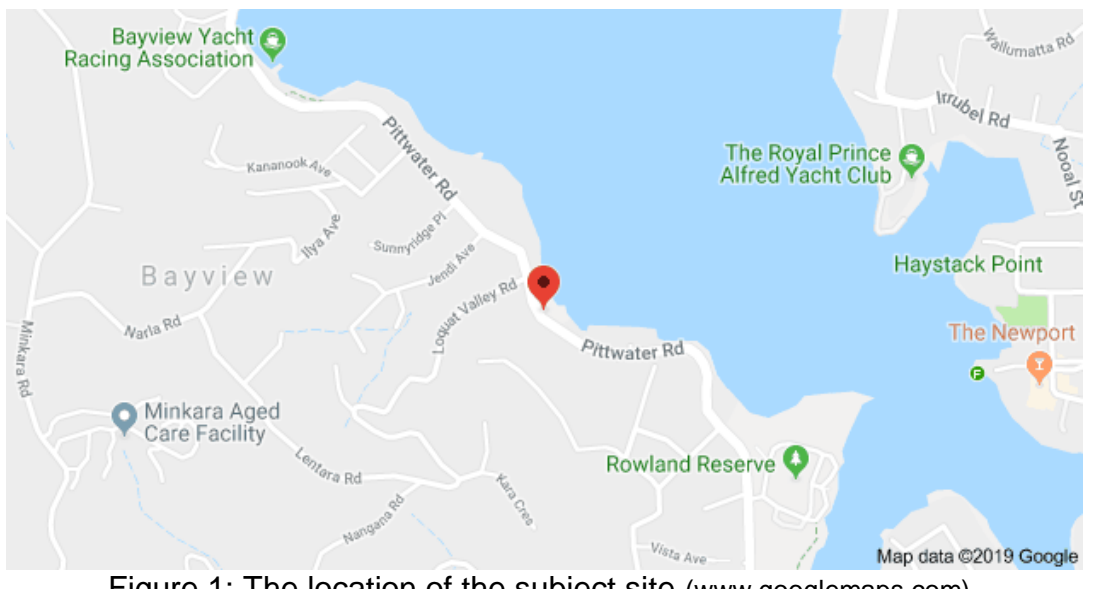
Figure 1: The location of the subject site.