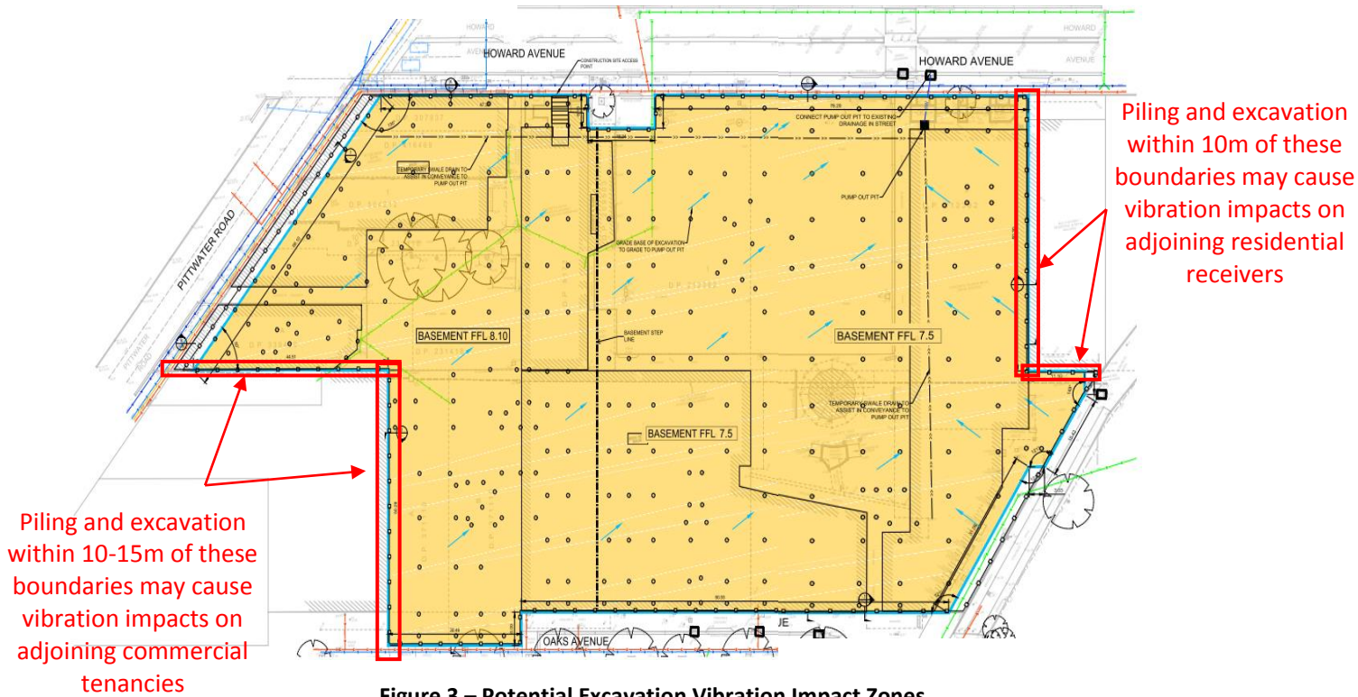
Figure 3 – Potential Excavation Vibration Impact Zones