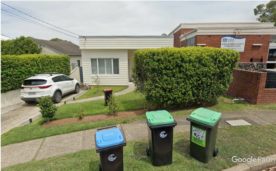
View of the existing dwelling from Blandford Street.

The building is not listed under the Warringah Local Environmental Plan 2011 as having any heritage significance nor is it in the immediate vicinity of any items of heritage significance.