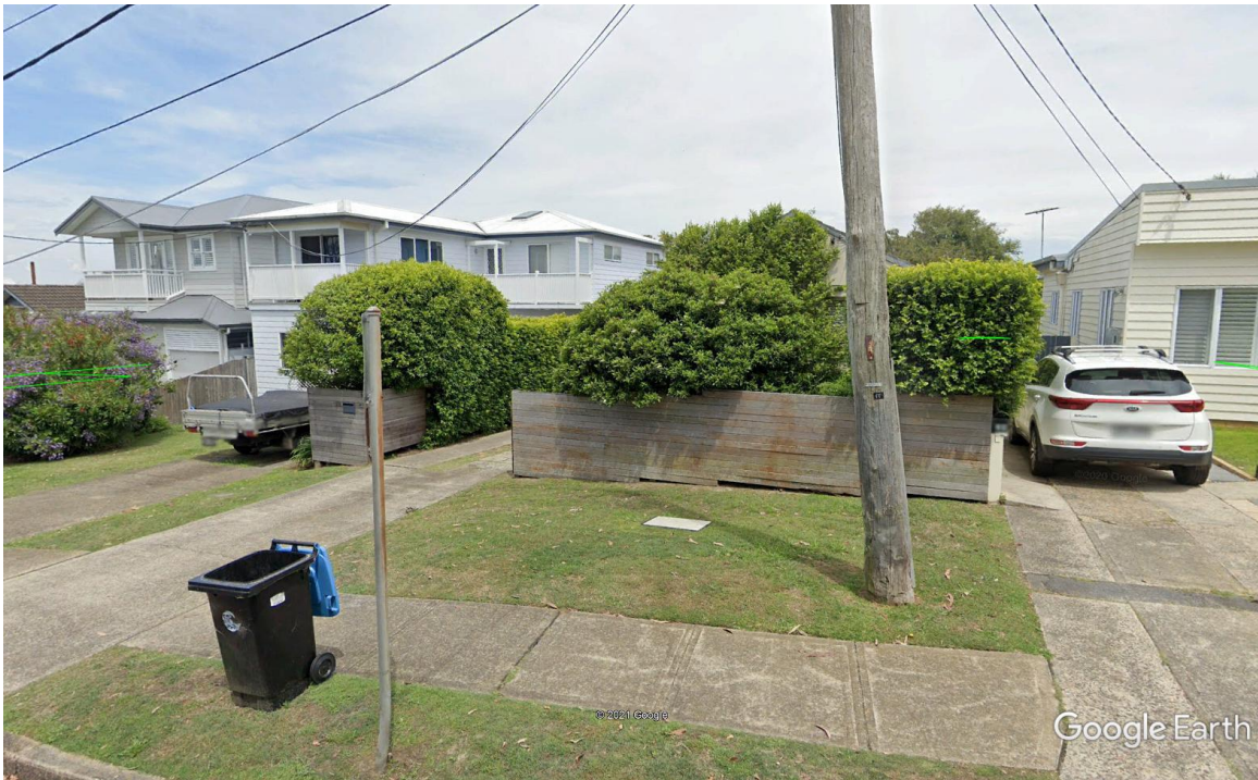
View of the southern adjoining property

It is noted that there are two examples of recent upper level additions further to the south of the subject property.