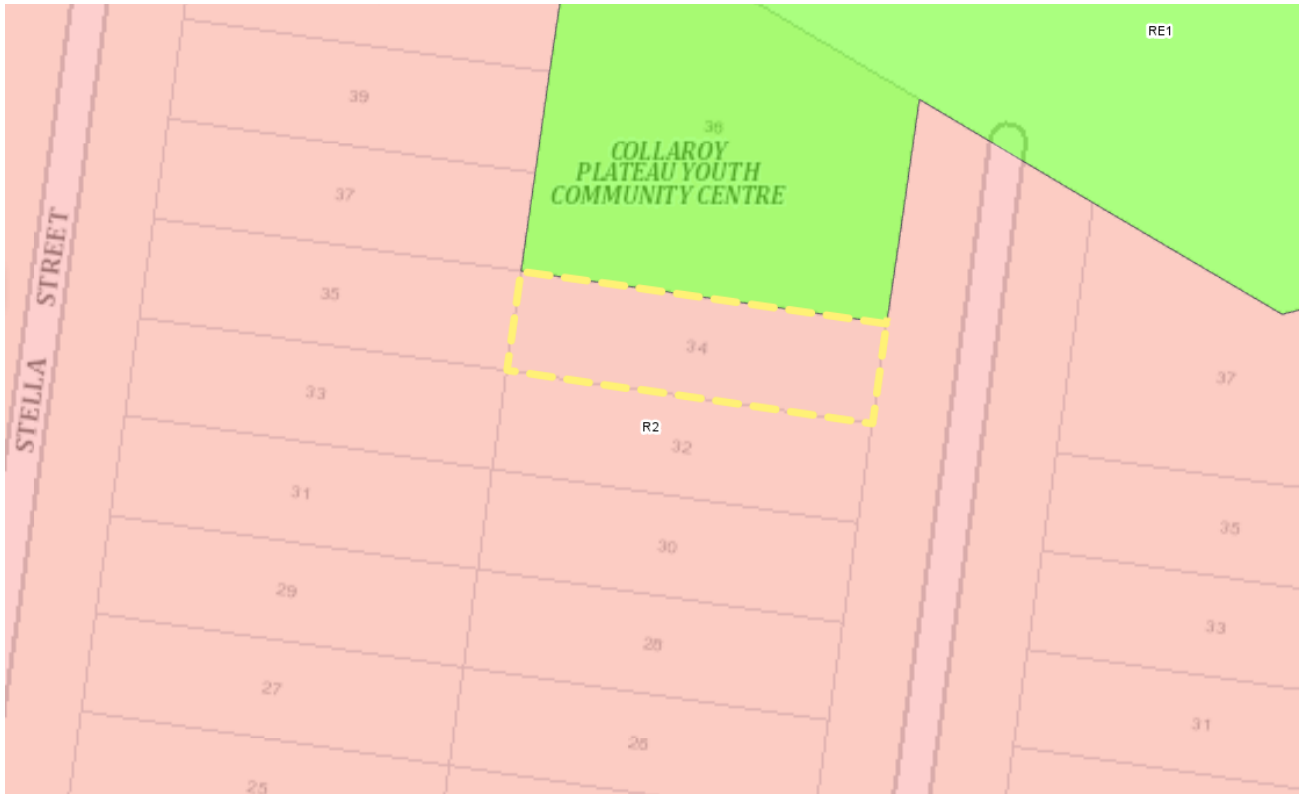
Land Zoning Extract – R2 Low Density Residential

The subject land is zoned R2 Low Density Residential pursuant to Warringah LEP 2011.