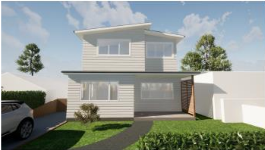
Proposed Streetscape elevation