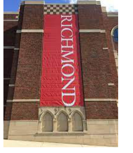
Breeze cloth/mesh for perimeter signage