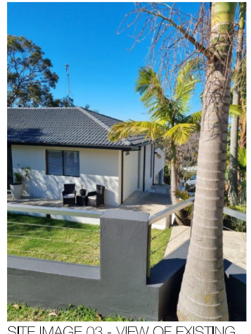
SITE IMAGE 03 - VIEW OF EXISTING DWELLING FROM KERB