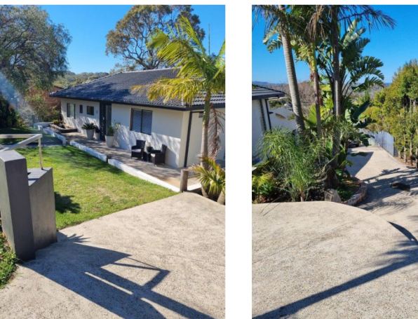
SITE IMAGE 03 - VIEW OF EXISTING DRIVEWAY/DWELLING FROM KERB