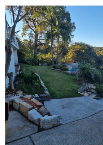
SITE IMAGE 06 - VIEW OF EXISTING REAR TURF AREA/DRIVEWAY