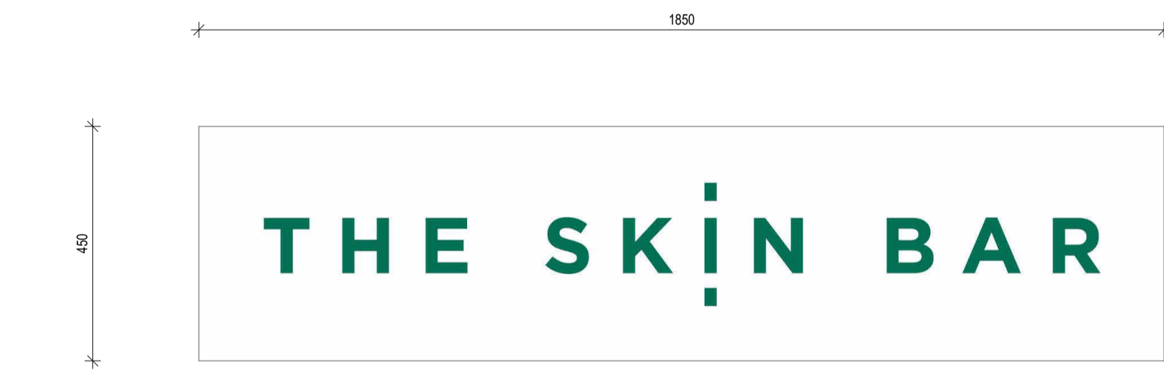
5 Drafting View Signage 3 - The Skin Bar 1:10

NOTES: • (C) Antoniaades Architects Pty Ltd all rights reserved. This work is copyright and cannot be reproduced or copied in any form or by any means without the written permission of Antoniaades Architects. Any license to use this document, whether expressed or implied is restricted to the terms of the agreement or implied agreement between Antoniaades Architects Pty Ltd and the instructing party. • All dimensions in millimeters unless otherwise shown. • Use figured dimensions only. • Do not scale from drawings. • Check all dimensions on site prior to construction. • To be read in conjunction with all other documents. • Report any discrepancies to Antoniaades Architects Pty Ltd. • All boundary dimensions and bearings to be verified by licensed surveyor prior to proceeding with work.