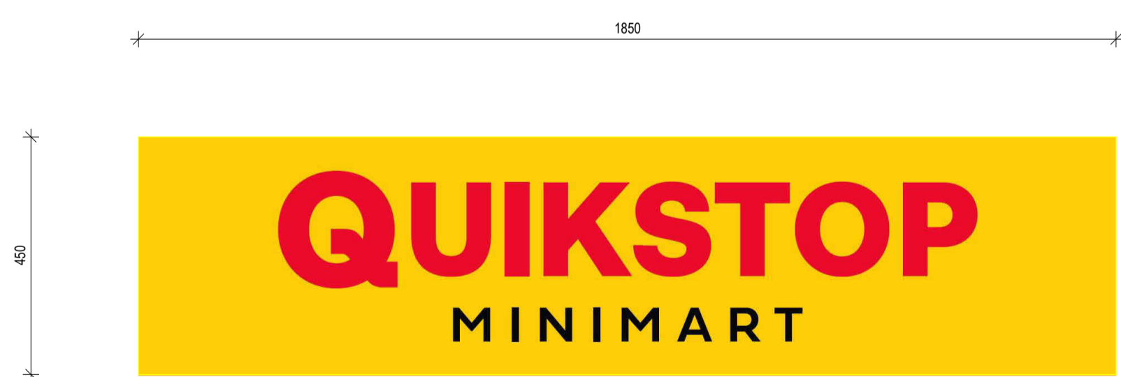
3 Drafting View Signage 1 - Quikstop 1:10