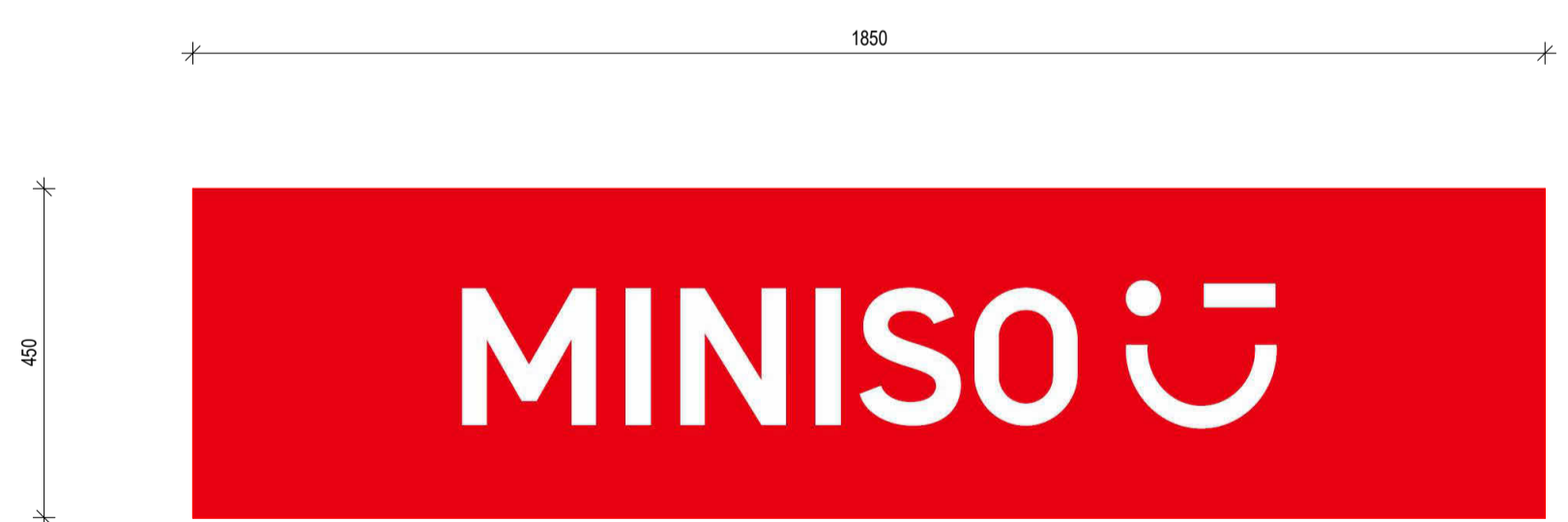
4 Drafting View Signage 2 - Miniso 1:10