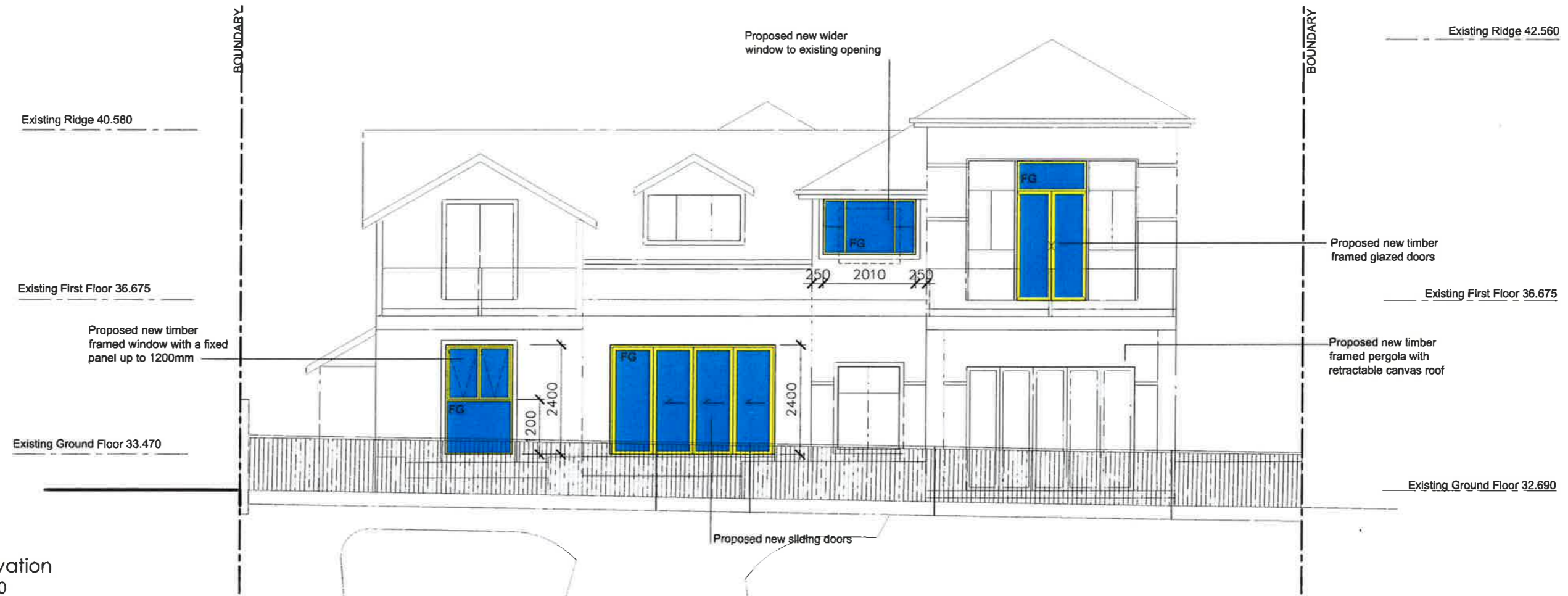
West Elevation scale 1:100

WASHINGTON TRUS PILLARS TO IN CONNECTION CONSTRUCTION CC2010/0718