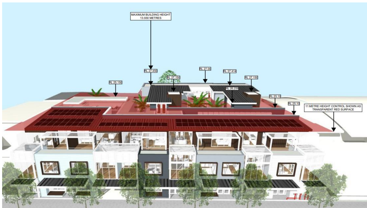
Figure 1 – Building height blanket diagram showing non-compliant building height elements

We note that the front and rear facing building façades sit comfortably below the prescribed height standard.