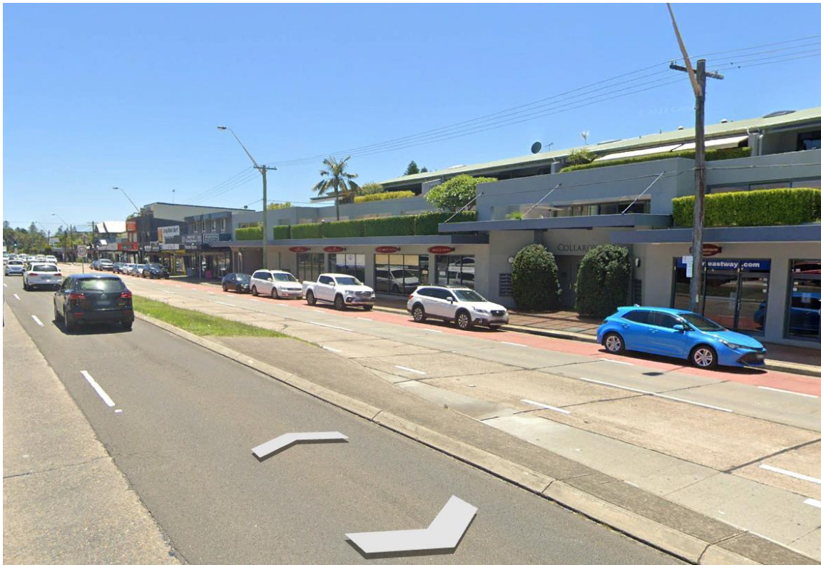
Figure 3: View towards the site from Pittwater Road

The consideration of building compatibility is dealt with in the Planning Principle established by the Land and Environment Court of New South Wales in the matter of Project Venture Developments v Pittwater Council [2005] NSWLEC 191. At paragraph 23 of the judgment Roseth SC provided the following commentary in relation to compatibility in an urban design context: