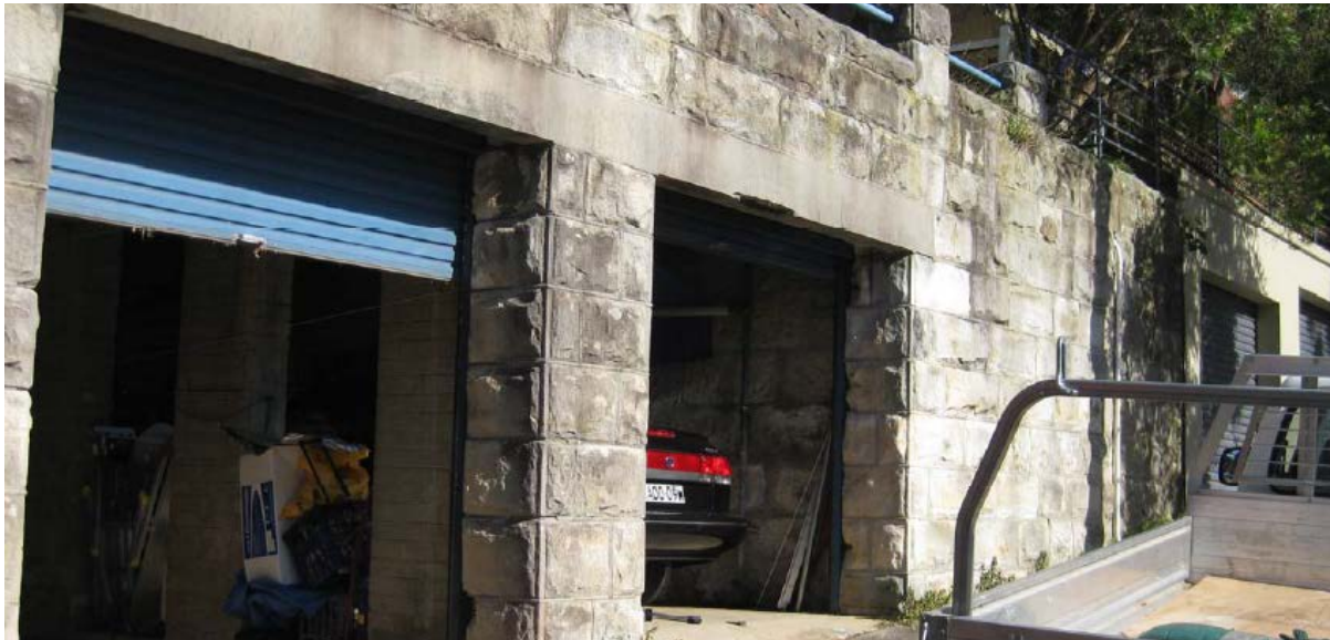
1 Quinton Road Street Level