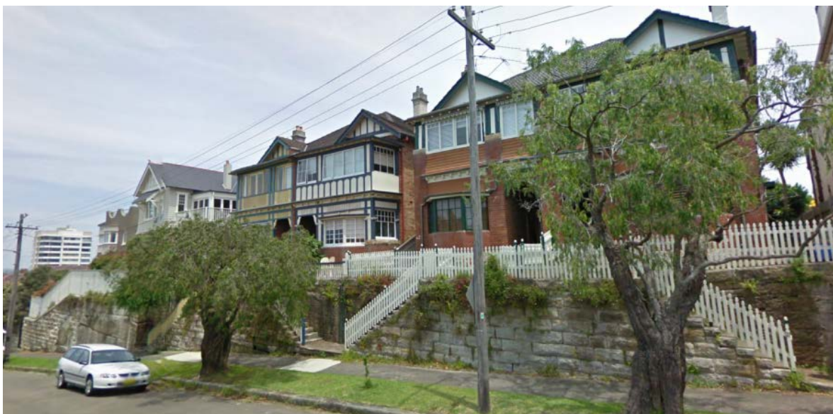
Quinton Road Streetscape Heritage

By 1913, Quinton Road’s Streetscape was completed in the lower region of Quinton Road. During the Great War and up until Second World War, some of the dwellings on Quinton Road and the surrounding areas were used as boarding houses.