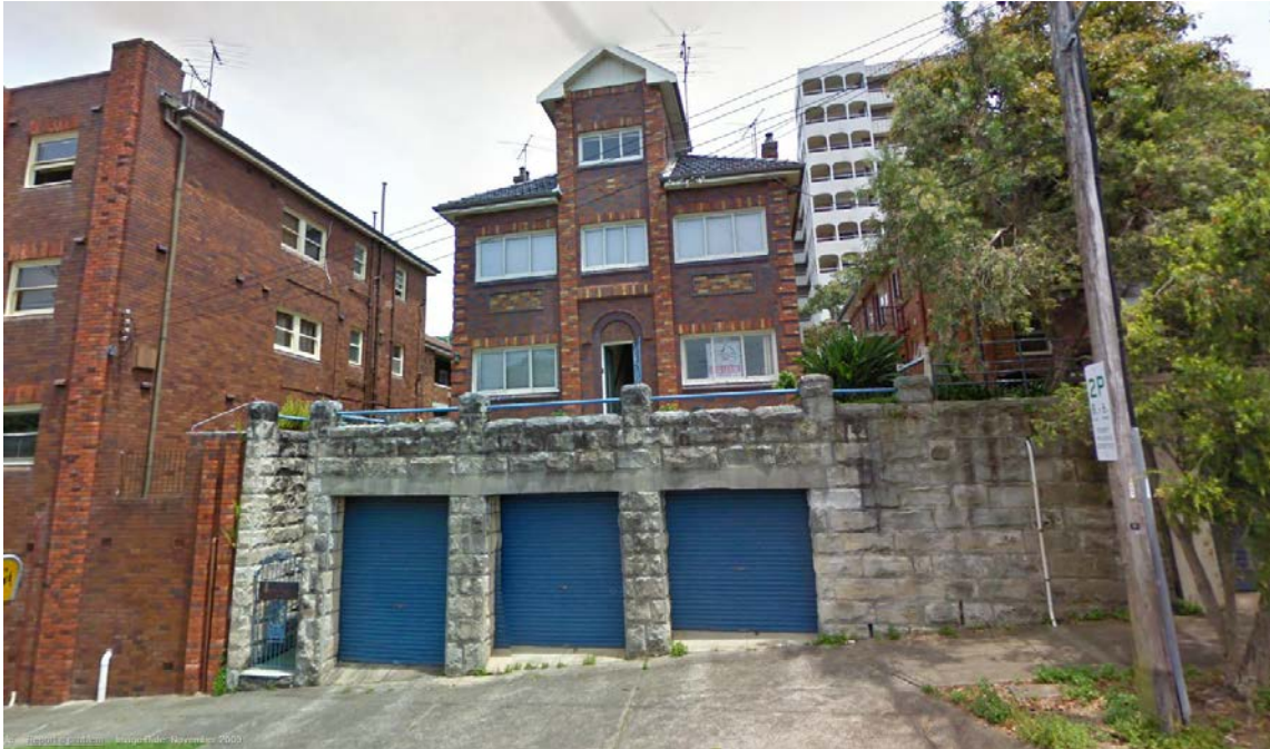
1 Quinton Road

The property owner of 1 Quinton Road, Manly NSW 2095 has contacted Neilly Davies & Partners Pty Ltd to prepare DA forms for the repair of the property courtyard and the replacement of the existing fence.