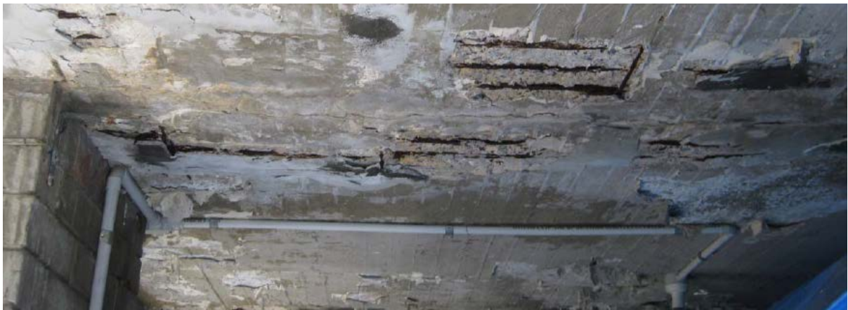
Underside of garage ceiling slab