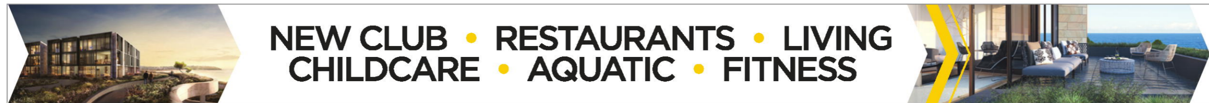
3. 32m x 2.65m