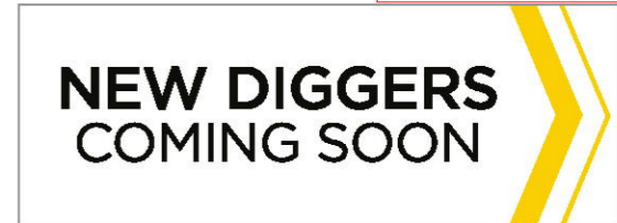
2. 7.2m x 2.65m